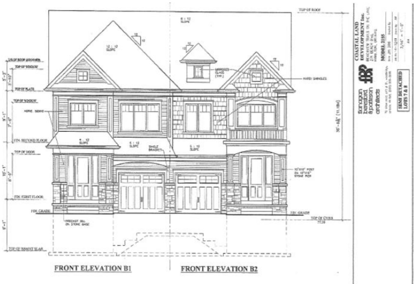
Figure 18: Façade elevations for Block 1 (Unit 2-3)

ADDENDUM - CHIA | 271 Beach Boulevard, Hamilton, ON