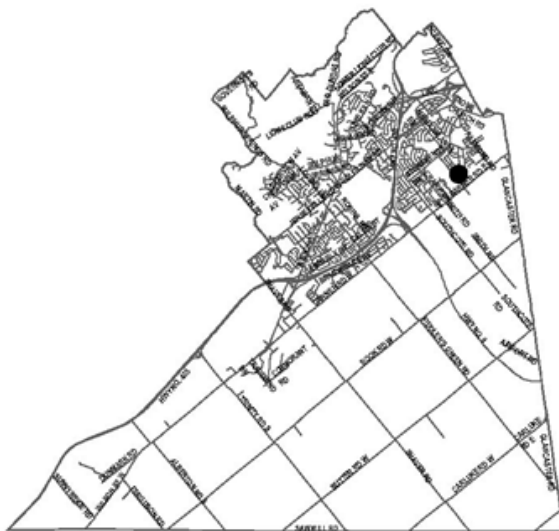
Key Map - Ward 12