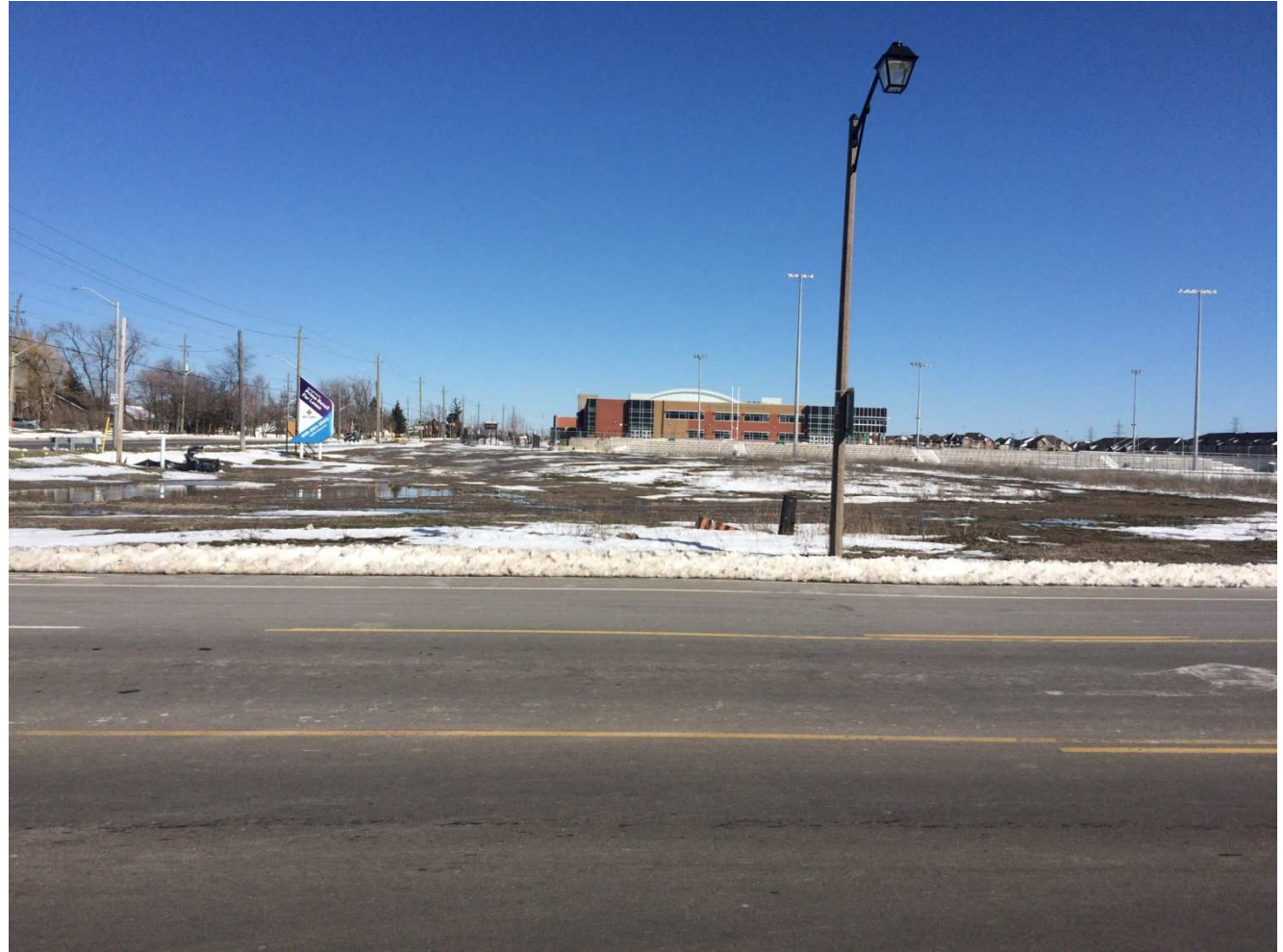
Photo 1 – Photo of the Subject Property as seen from Trinity Church Road looking East.