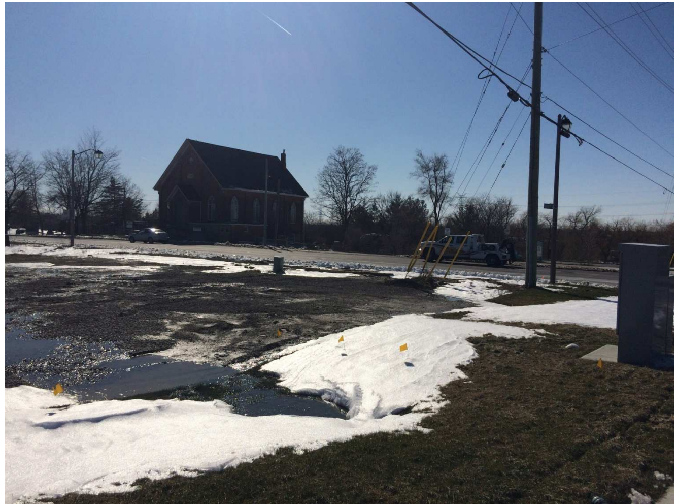
Photo 7 – Photo of the Subject Property and Trinity Church which is located to the West of the Subject Property as seen from Rymal Road East looking South West.