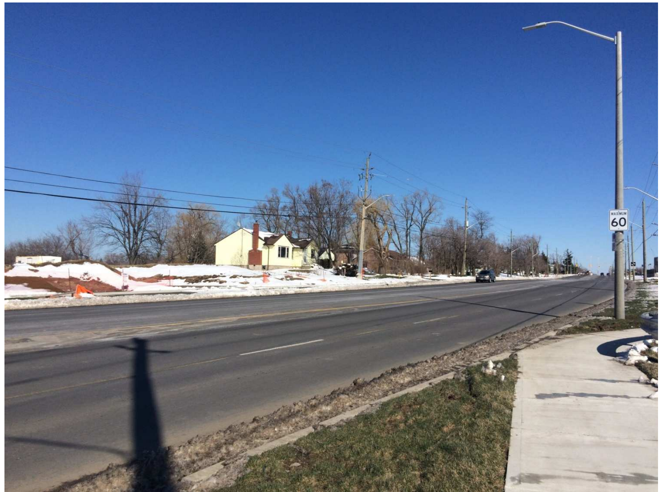
Photo 5 – Photo of the Existing Dwellings located to the North East of the Subject Property as seen from Rymal Road East looking North East.