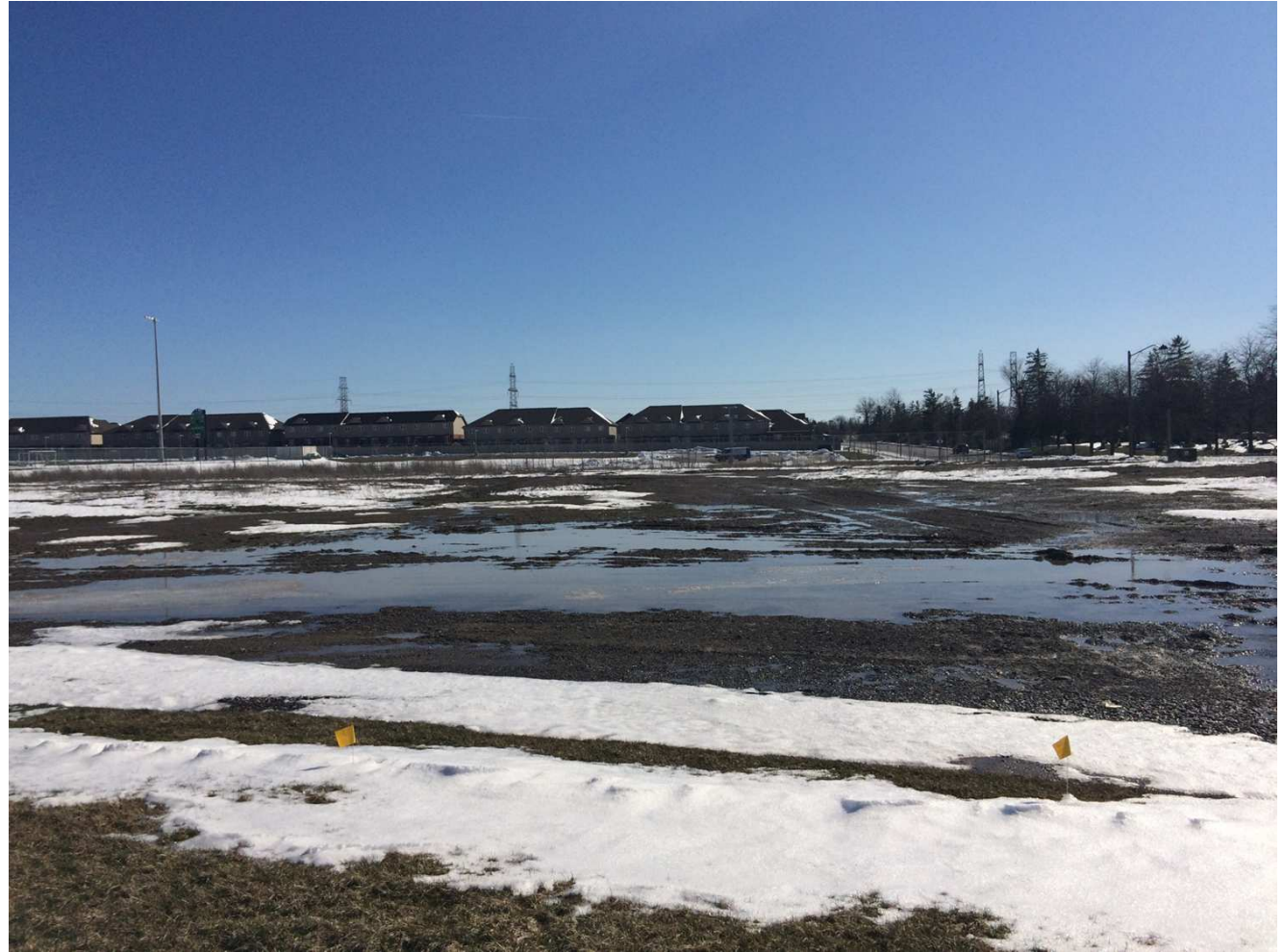
Photo 2 – Photo of the Subject Property as seen from Rymal Road East looking South.