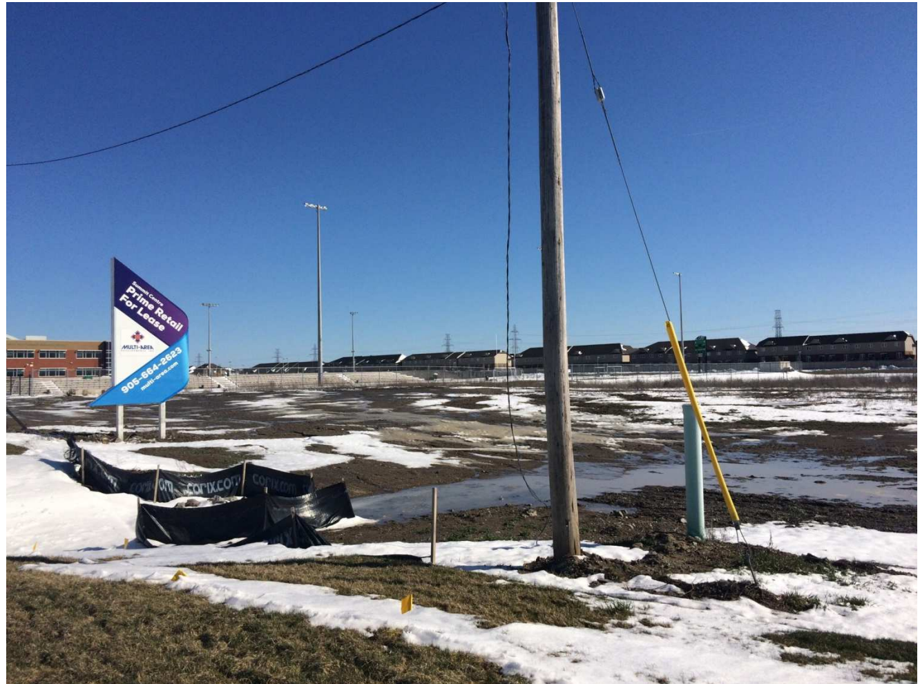
Photo 3 – Photo of the Subject Property and the High School property as seen from Rymal Road East looking south East.