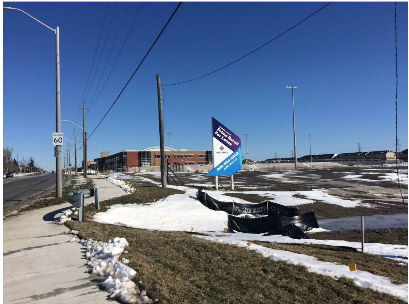
Photo 4 – Photo of the Subject Property and the High School property as seen from Rymal Road East looking East.