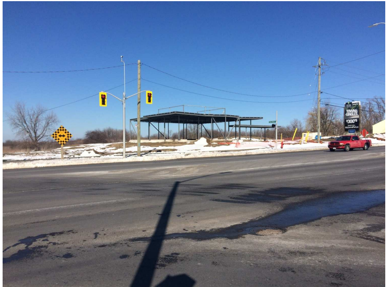
Photo 6 – Photo of the property located to the North of the Subject Property as seen from the intersection of Rymal Road East and Trinity Church Road looking North East.