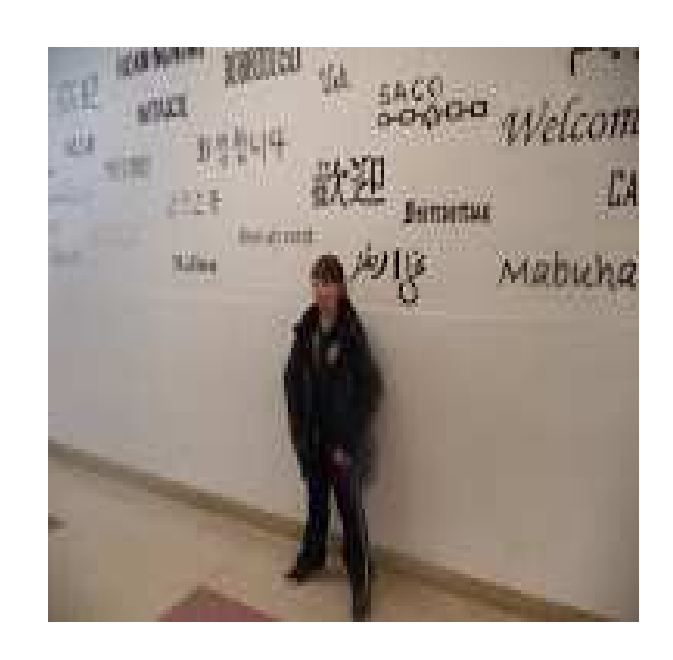
"Keep the welcome wall"