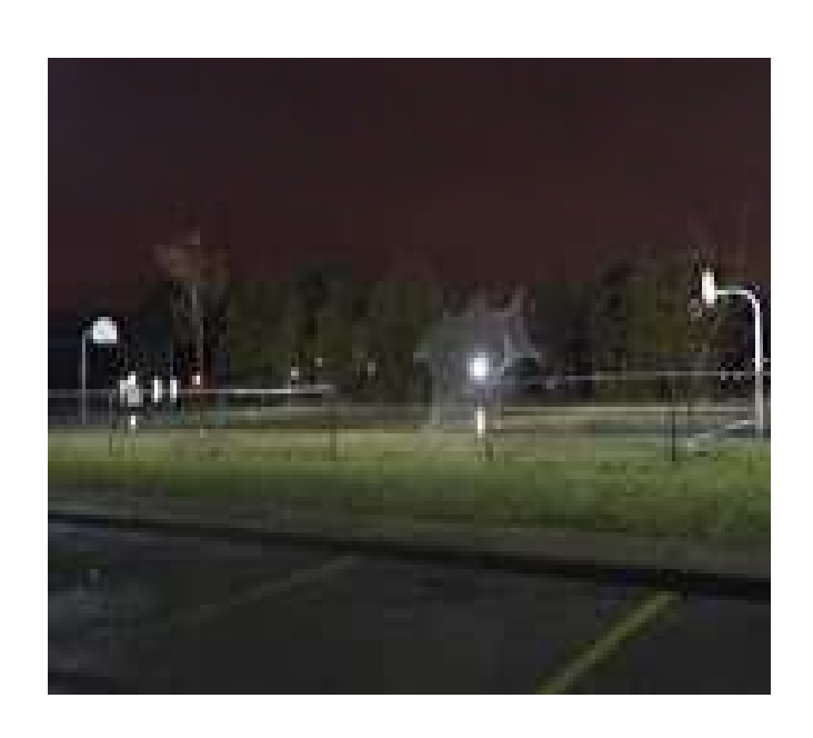
"More lights around the centre and on the paths we usually take"