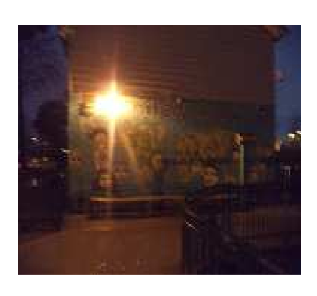
"Keep the mural as part of the neighbourhood"