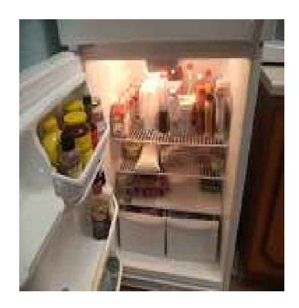
"Would like more snacks and maybe a dinner program"