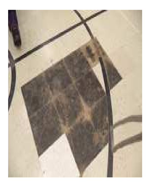
"Fix the flooring in the gym"