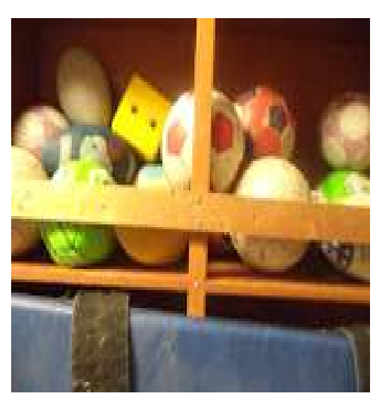
"Would like new gym equipment"