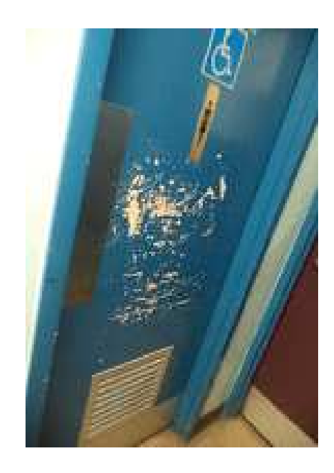
"Paint the doors"