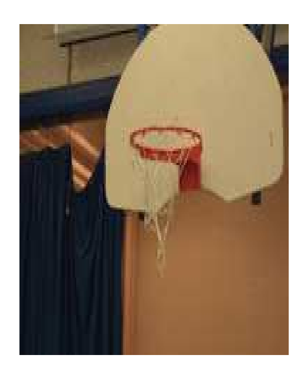
"New basketball nets in the centre"