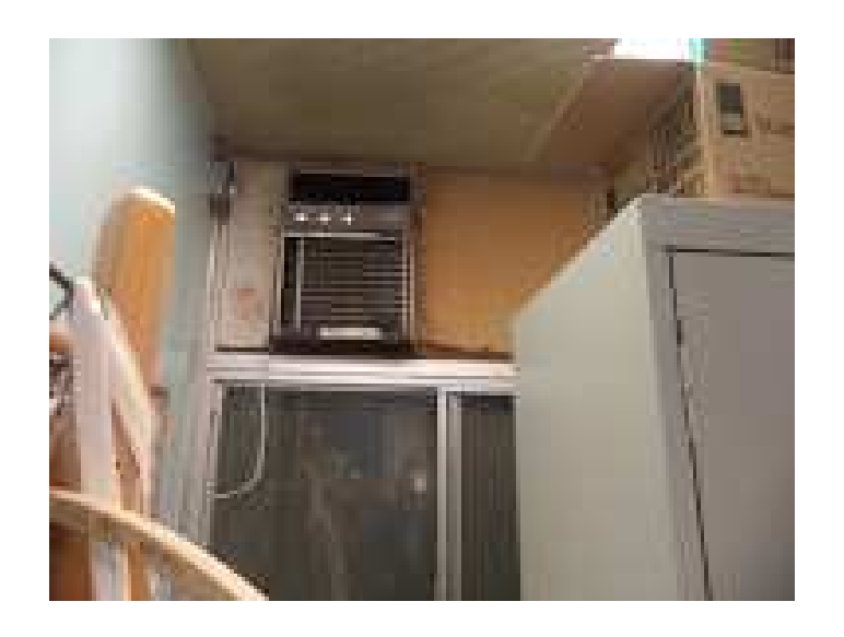
"Would like to have central air conditioning"