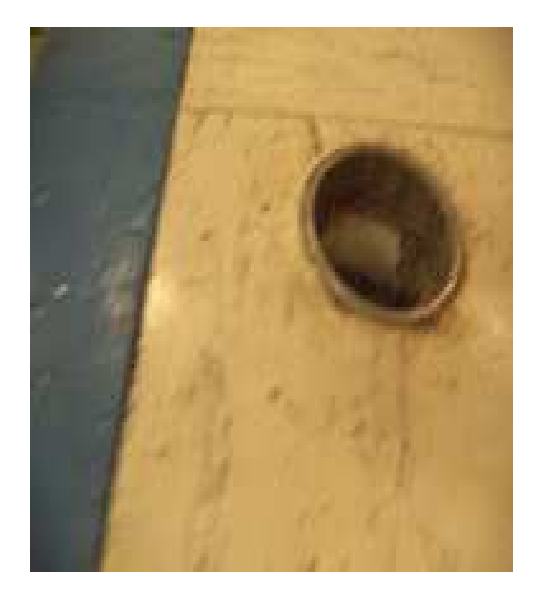
"Fix the hole on the gym stage – tripping hazard"