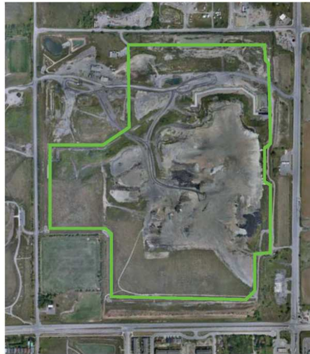
Alternative Footprint #2