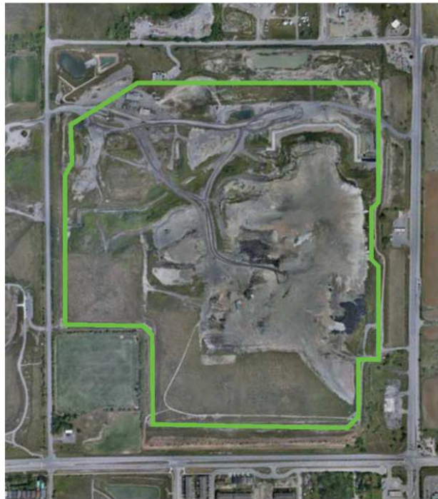
Alternative Footprint #1