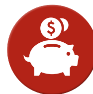
Income – 11 –