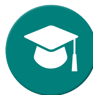
Education & Training / Bursaries for Youth – 8 –