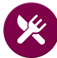
Food – 3 –