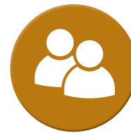
Employment – 7 –