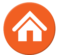
Housing – 4 –