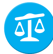
Legal – 3 –