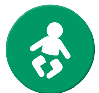
Child Care – 14 –