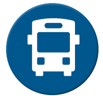
Transportation – 7 –