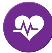
Health – 5 –