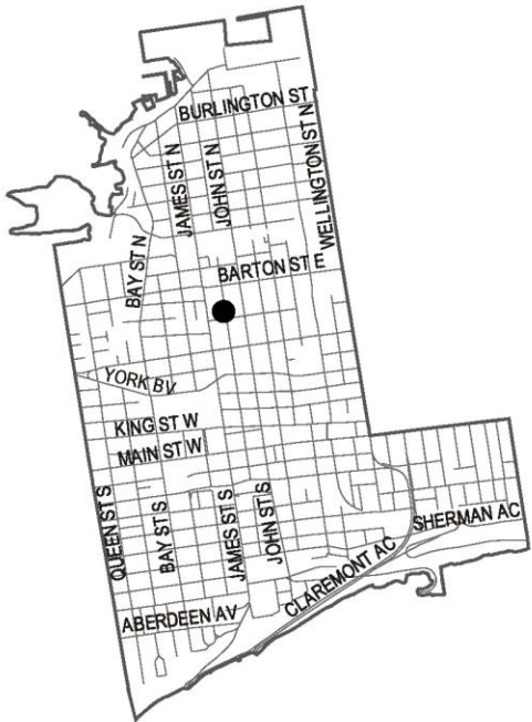
Key Map - Ward 2