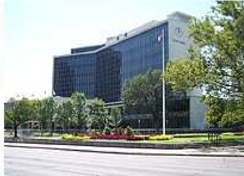
Hamilton - Ontario wikipedia

Hamilton is running a $3 billion infrastructure debt which will balloon by 150 million every year.