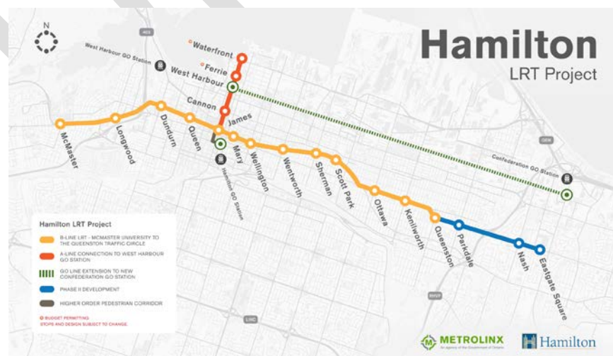
This map identifies the study boundary of the project.

The City of Hamilton and Metrolinx invite you to attend Public Information Centres (PICs) to learn about a number of new developments and improvements to the project and to provide your input on the preliminary plans.