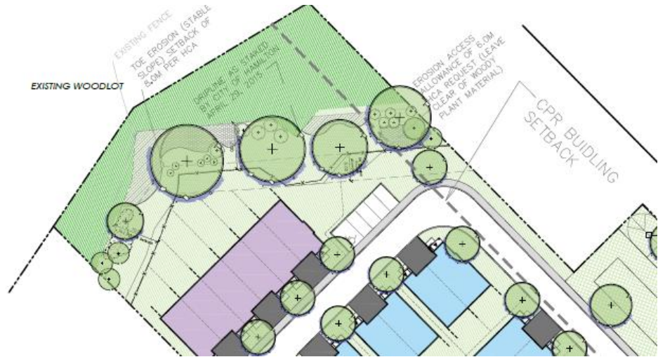
Plan Showing Vegetation Management Zone (VMZ)