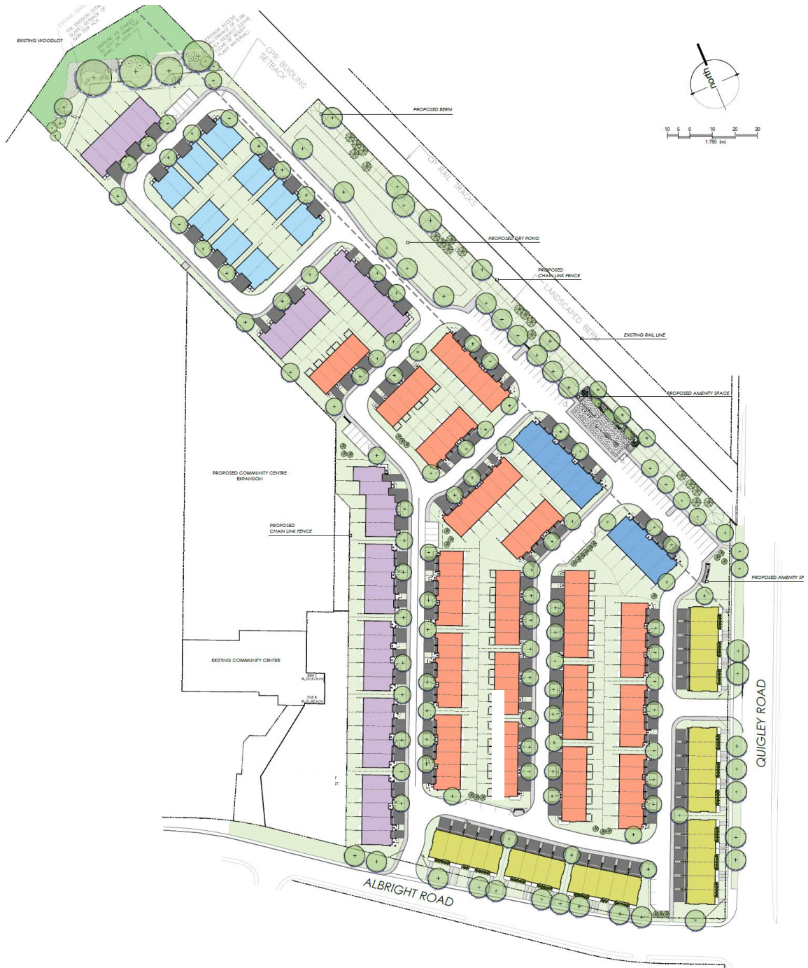
Overall Planting Concept