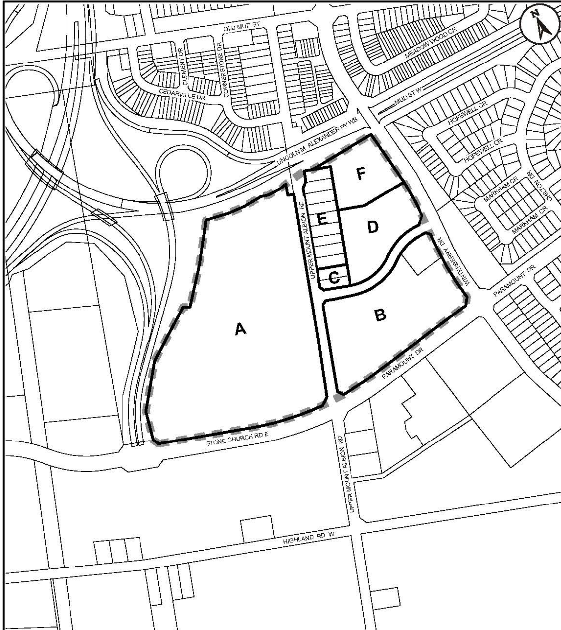
Figure 8: Heritage Green