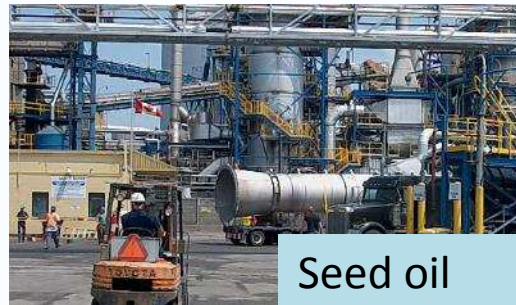
Seed oil crushing