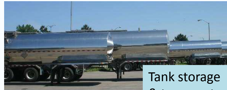
Tank storage & transport