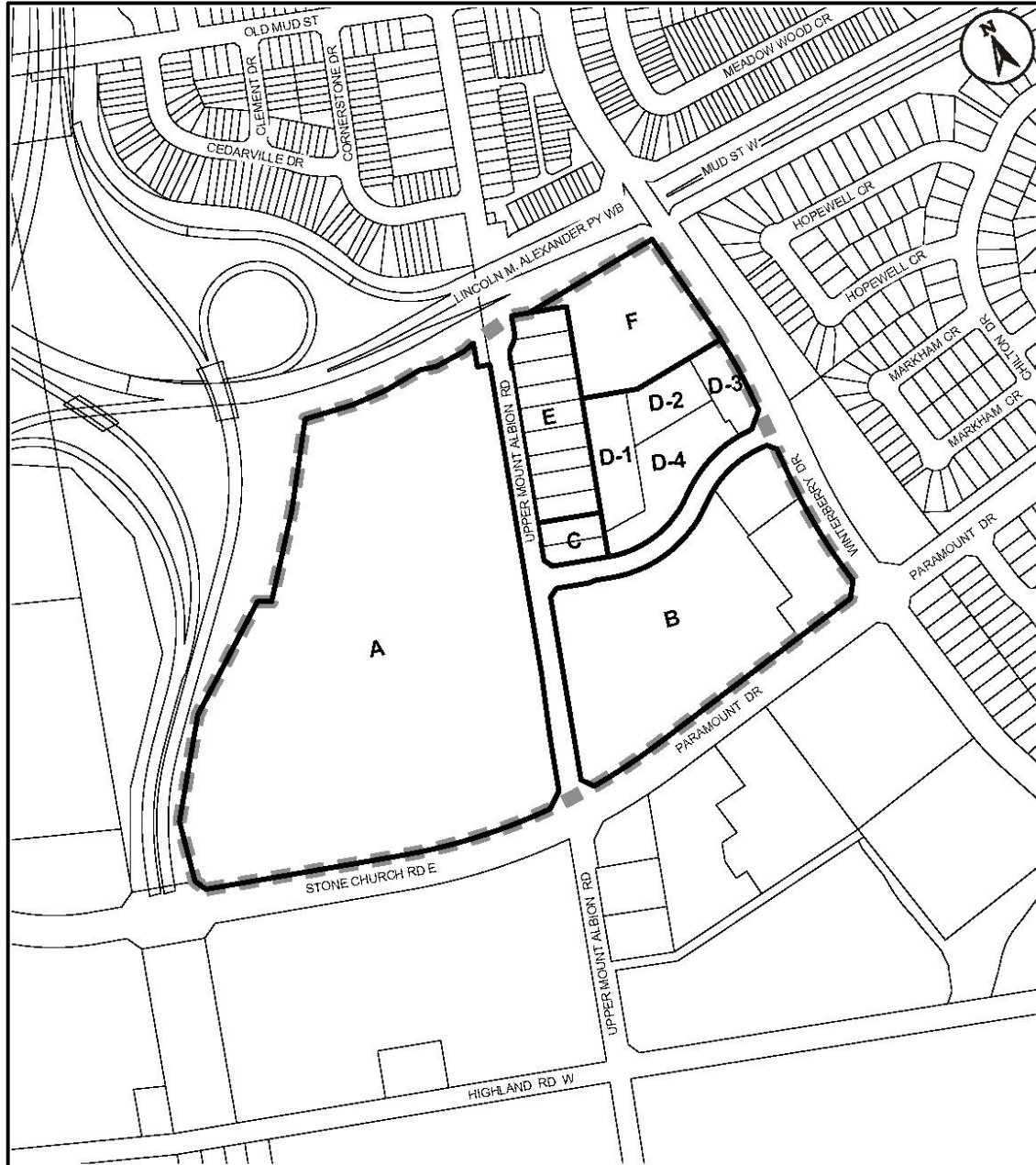
Figure 8: Heritage Green