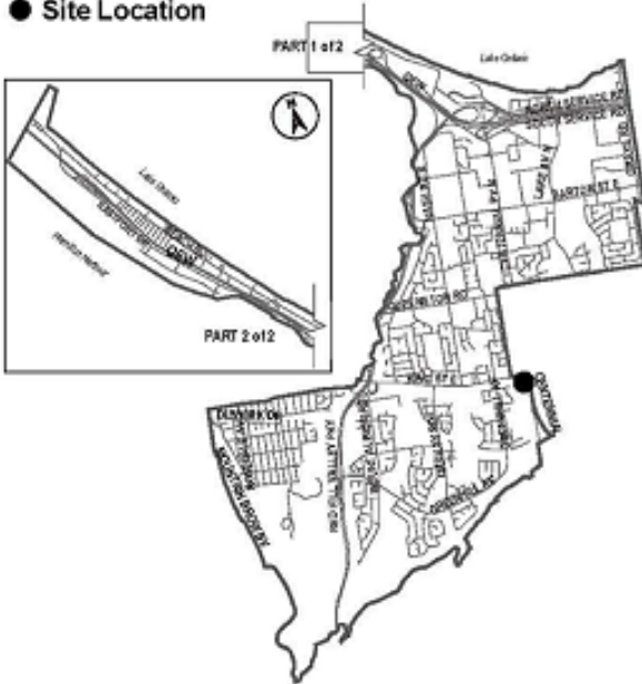
Key Map - Ward 5