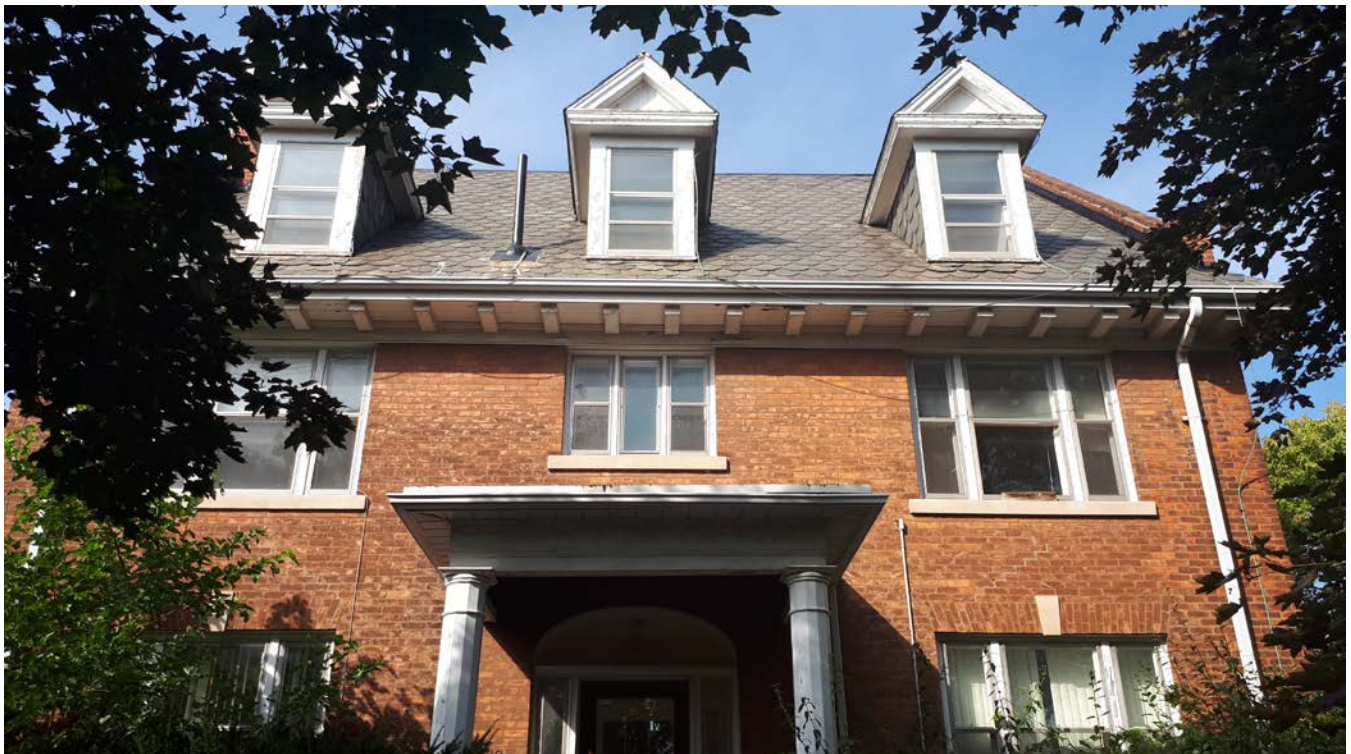
Figure 2: A closer view of the symmetrical southern façade showing the columned portico, window keystones, slate roof, and Classical pedimented dormers (2017).