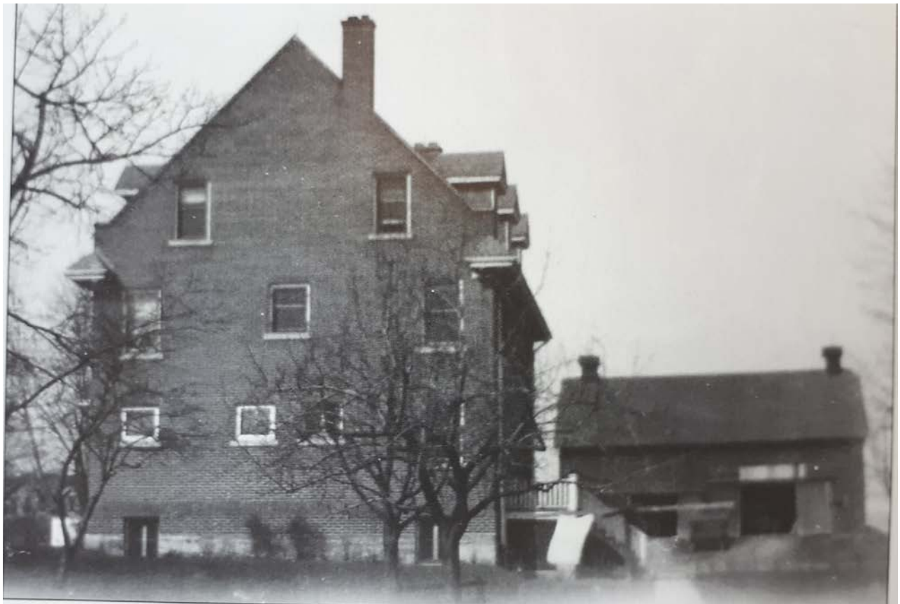
Figure 7: An early photograph of the San House, looking west. A bank barn which was believed to be torn down in the late 1930s can be seen in the background (Ralph Wilson, Chedoke: More Than a Sanatorium , 2006).