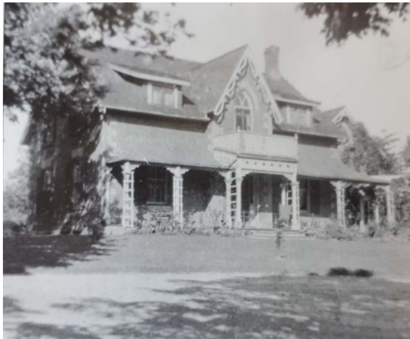
Figure 9: The original farmhouse on the property that was purposed as the home of the Holbrook family until it was destroyed by fire in 1922 (Wilson, Chedoke , 2006).