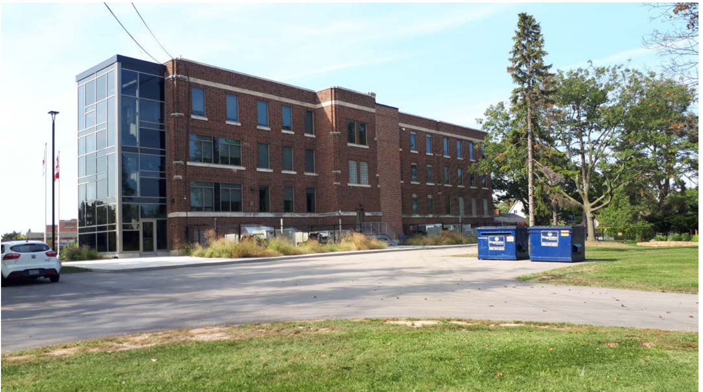
Figure 15: The rear (east) portion of the building. Note the modern addition, off-colour brick elevator addition, and modern windows. The brick building features a simple rear façade with stone sills, soldier course brick lintels, and stone stringcourses running the length of the façade (2017).