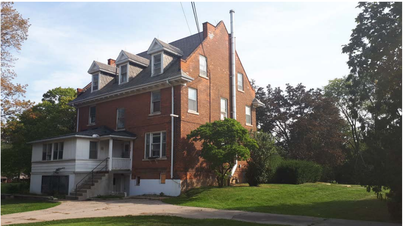
Figure 5: A closer look at the rear of the building (2017).