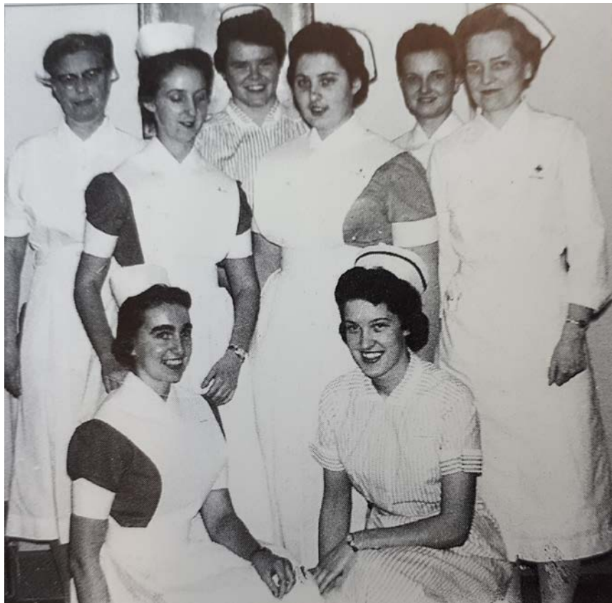
Figure 17: The Patterson Building was built as a nurse residence in 1932. Pictured are a group of "Patterson Nurses" (Wilson, Chedoke , 2006).