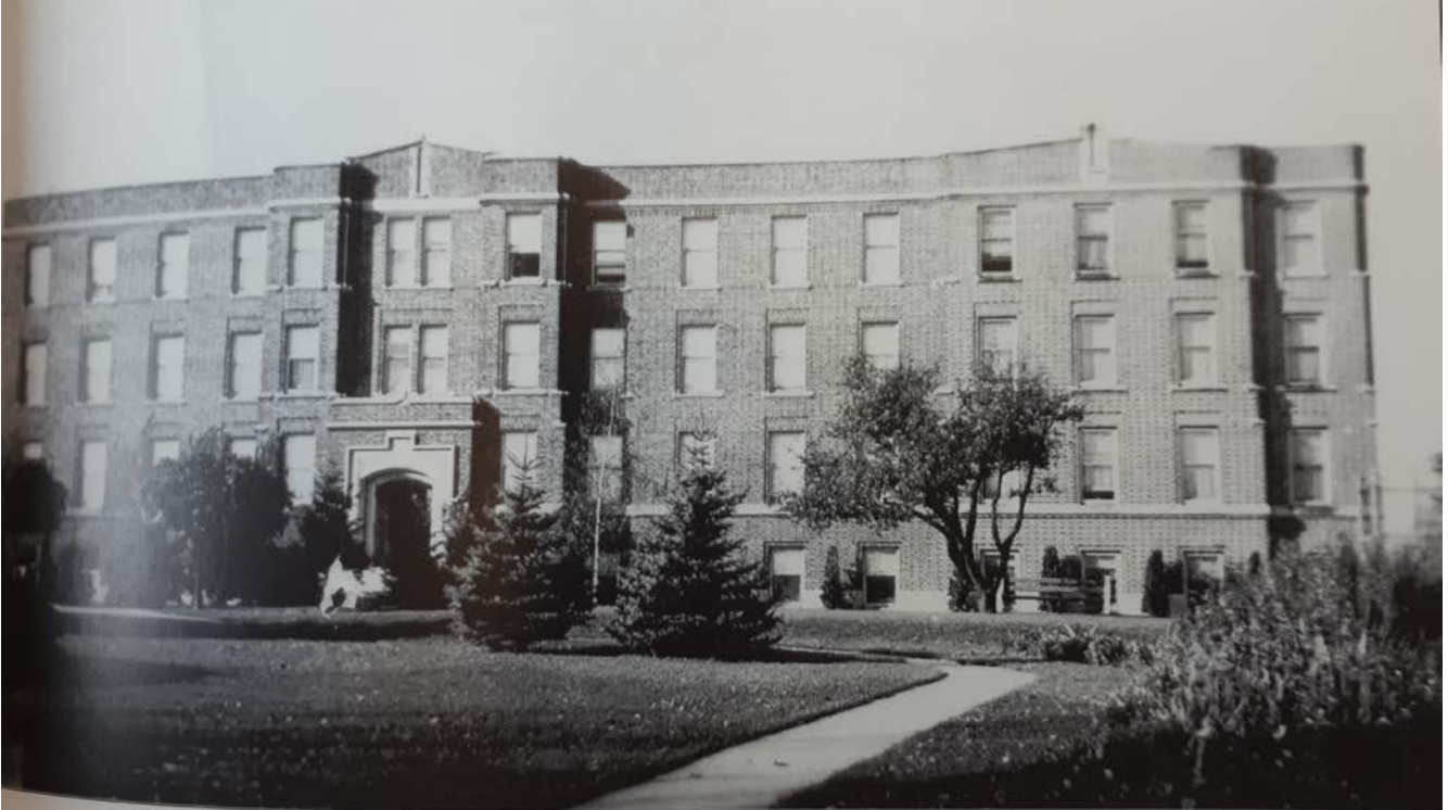
Figure 16: An early photograph (ca. 1930s) of the Patterson Building (Wilson, Chedoke , 2006).