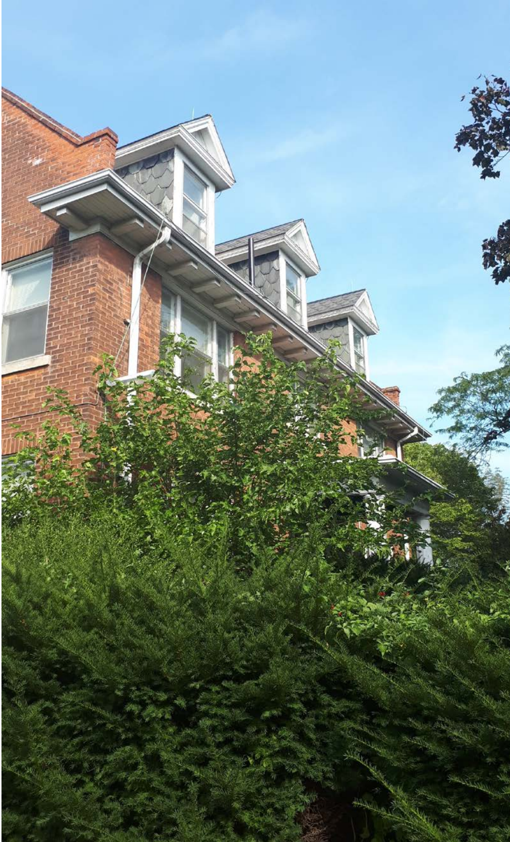
Figure 3: View from the southwest corner of the roofline profile. The image displays slate siding on the dormers, projected brick corbel corners, and modillion brackets on the underside of an extended cornice soffit (2017).