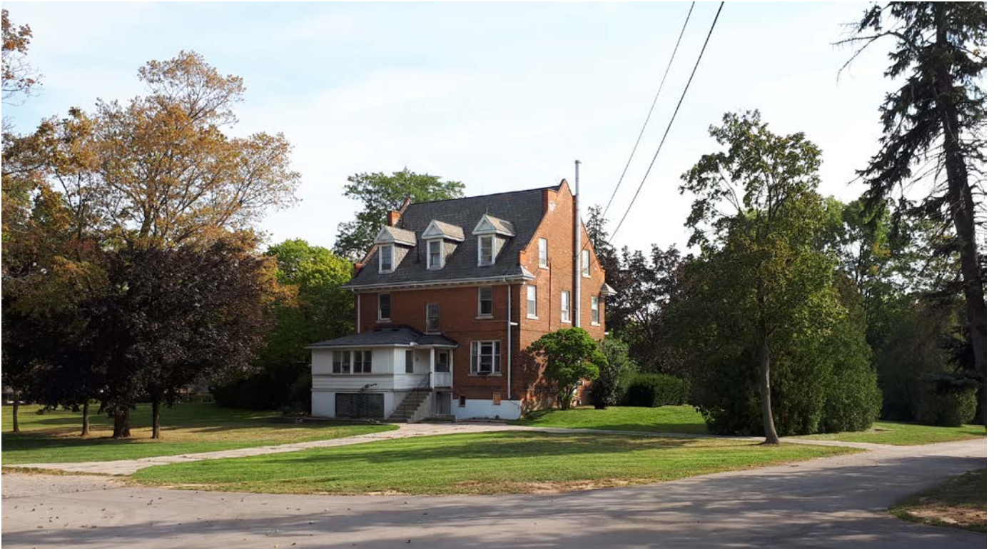
Figure 4: View of the rear of the building (north and west elevations) showing a matching profile with equivalent pedimented dormers. An early one-and-a-half storey aluminum and wooden-clad addition is shown on the eastern portion of the rear façade (2017).