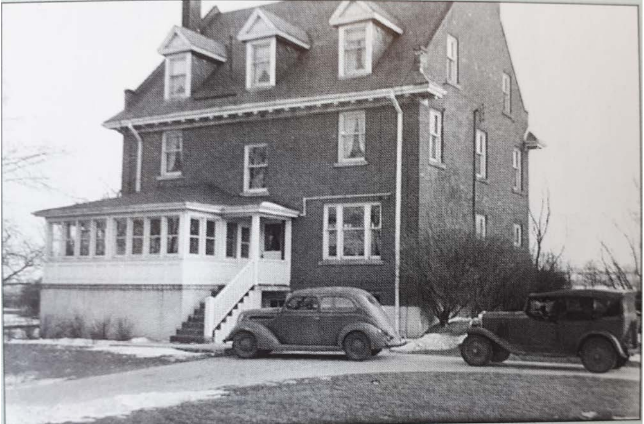
Figure 8: A circa 1930s photograph showing the rear of the building, the early wood-clad addition, and two automobiles (Wilson, Chedoke , 2006).