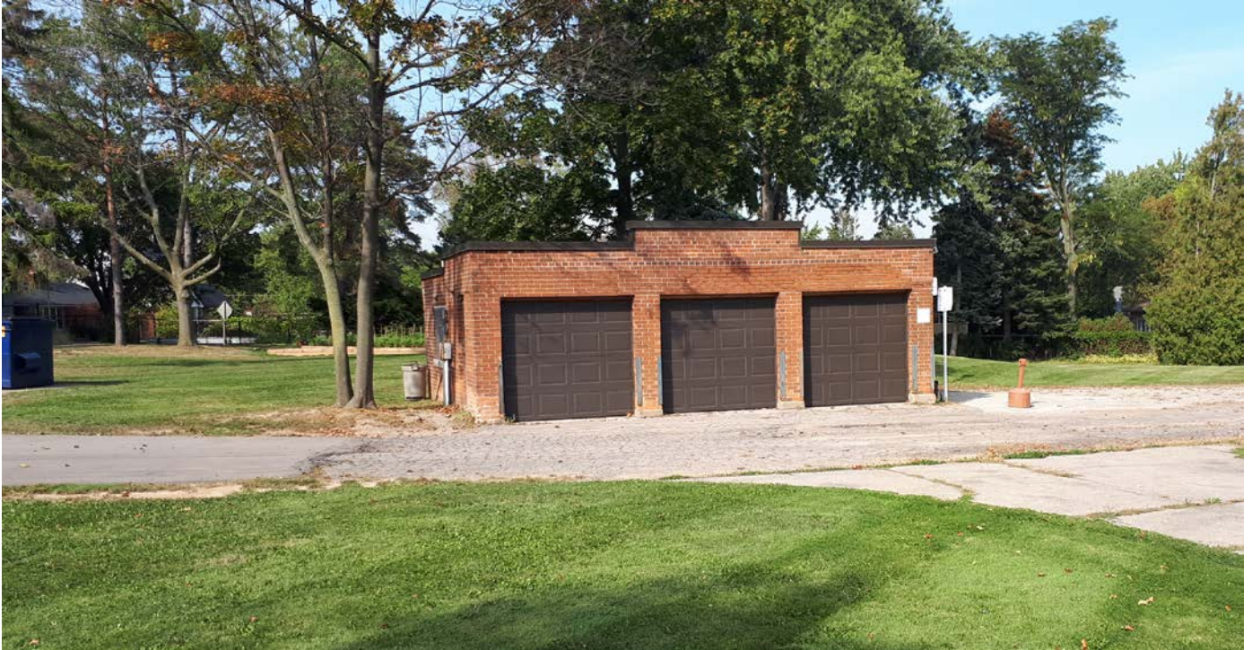
Figure 6: An accessory garage building on the property with a yet unknown history (2017).