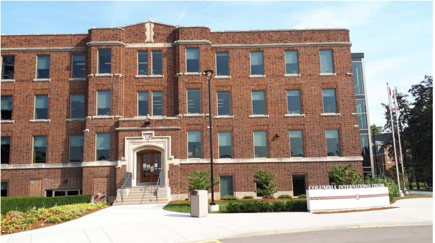
Figure 12: The southern end of the front (west) façade of the Patterson Building now owned and adaptively-reused by Columbia International College. The projected entrance features a subtle ogee arch peak and an attractive hood moulding made of stone (2017).