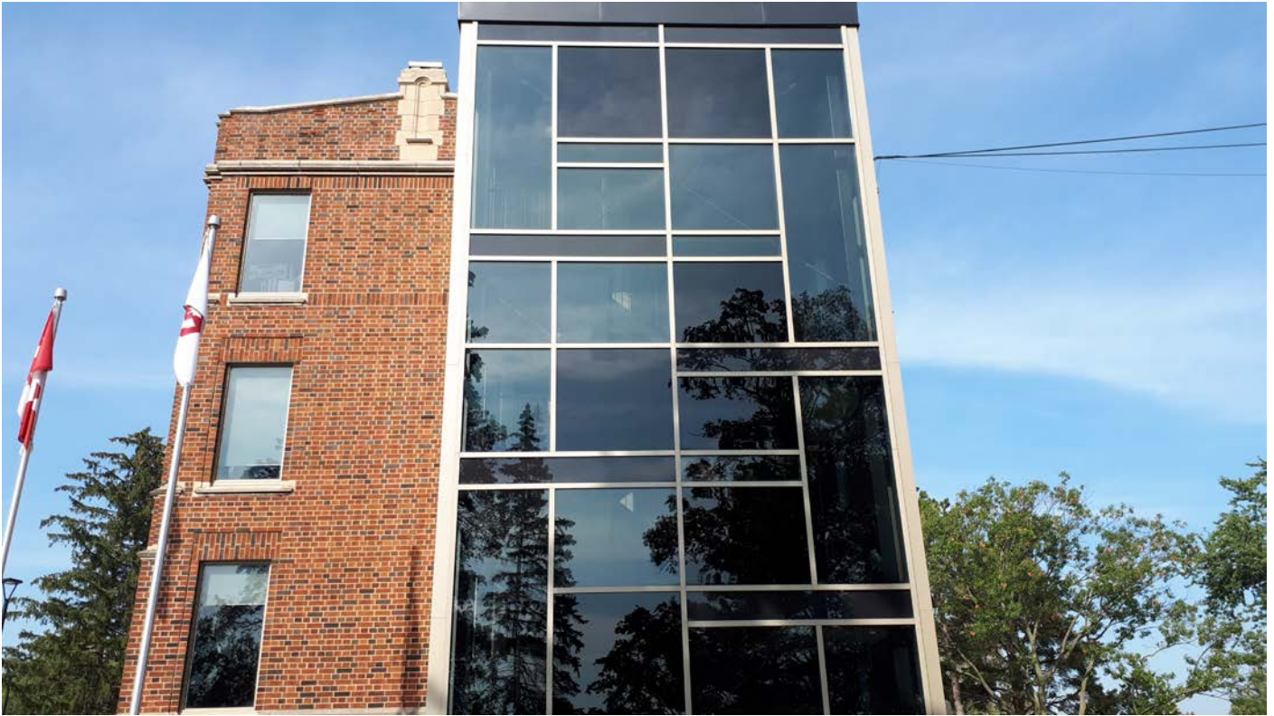
Figure 14: The southern end of the rectangular Patterson Building with a projecting modern glass addition housing a connecting stairwell (2017).