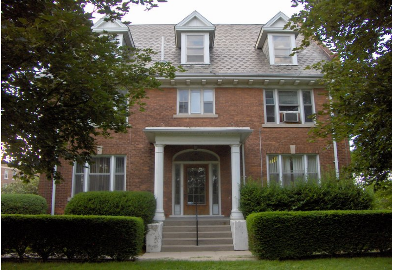
Figure 1: Front (south) façade of the former Medical Superintendent's Residence, the “San House”, at 650 Sanatorium Road, Hamilton (Historical Hamilton, 2015).