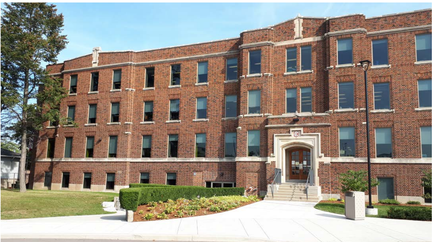
Figure 13: The northern end of the front façade. The building displays a restrained application of the Gothic Collegiate style with roofline enhanced with open stone niches (2017).