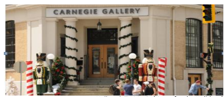
Hallmark TV Movie 'Home for the Holidays'

Staff continue to track, measure, analyse and implement solutions for work related to film permitting to ensure the needs of our two primary customers, residents/businesses and the film industry, are being met. As was reported in 2016, 8% of film permits generated complaints to the Hamilton Film Office. Staff have worked to implement continuous improvement initiatives and through various efforts have seen a 25% decrease in the total number of complaints stemming from filming. In 2016, staff reported that the most number of complaints were in regards to Parking – this number dropped to zero the first 3 quarters of 2017.