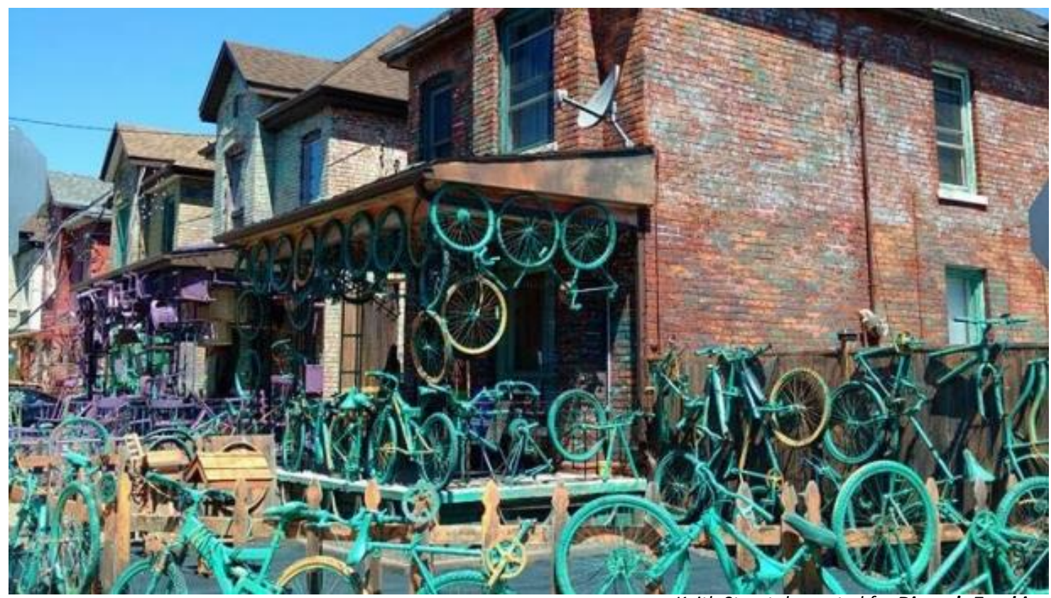
Keith Street decorated for Disney's Zombies