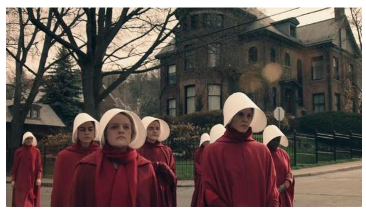
Still from the series 'The Handmaid's Tale'

Of the productions that have been welcomed to the City, some have been feature films and TV Movies however TV Series account for the greatest type of production annually within Hamilton. TV Series such as Taken, Designated Survivor, The Handmaid's Tale and Murdoch Mysteries have all used Hamilton to create their stories. As of September 30<sup>th</sup>, 2017, 87 productions registered with the Hamilton Film Office with 37 being TV Series.