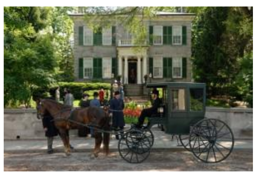
Murdoch Mysteries at Whitehern Historic House & Garden