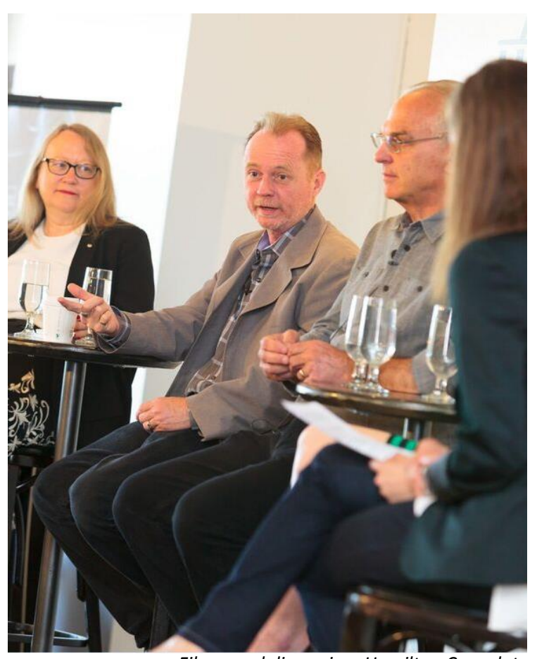
Film panel discussion, Hamilton Consulate