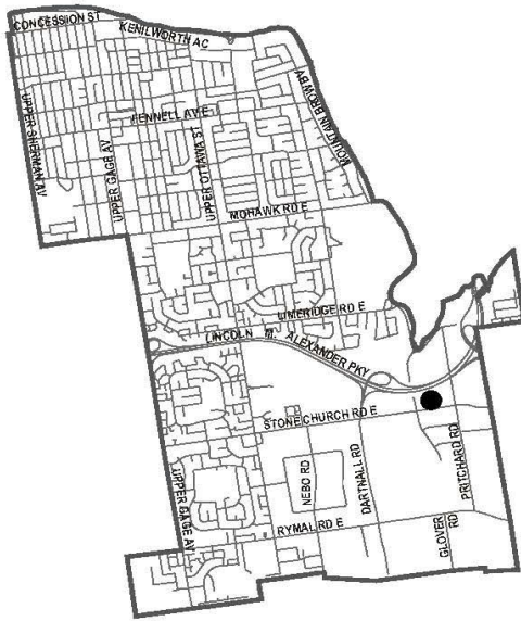
Key Map - Ward 6