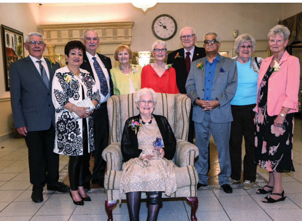
2017 Award Winners