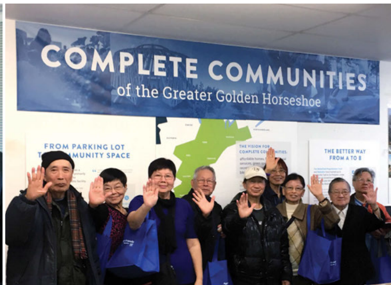
Pedestrian safety workshop