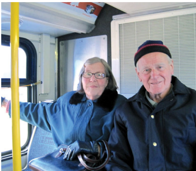
Let’s Take the Bus workshop