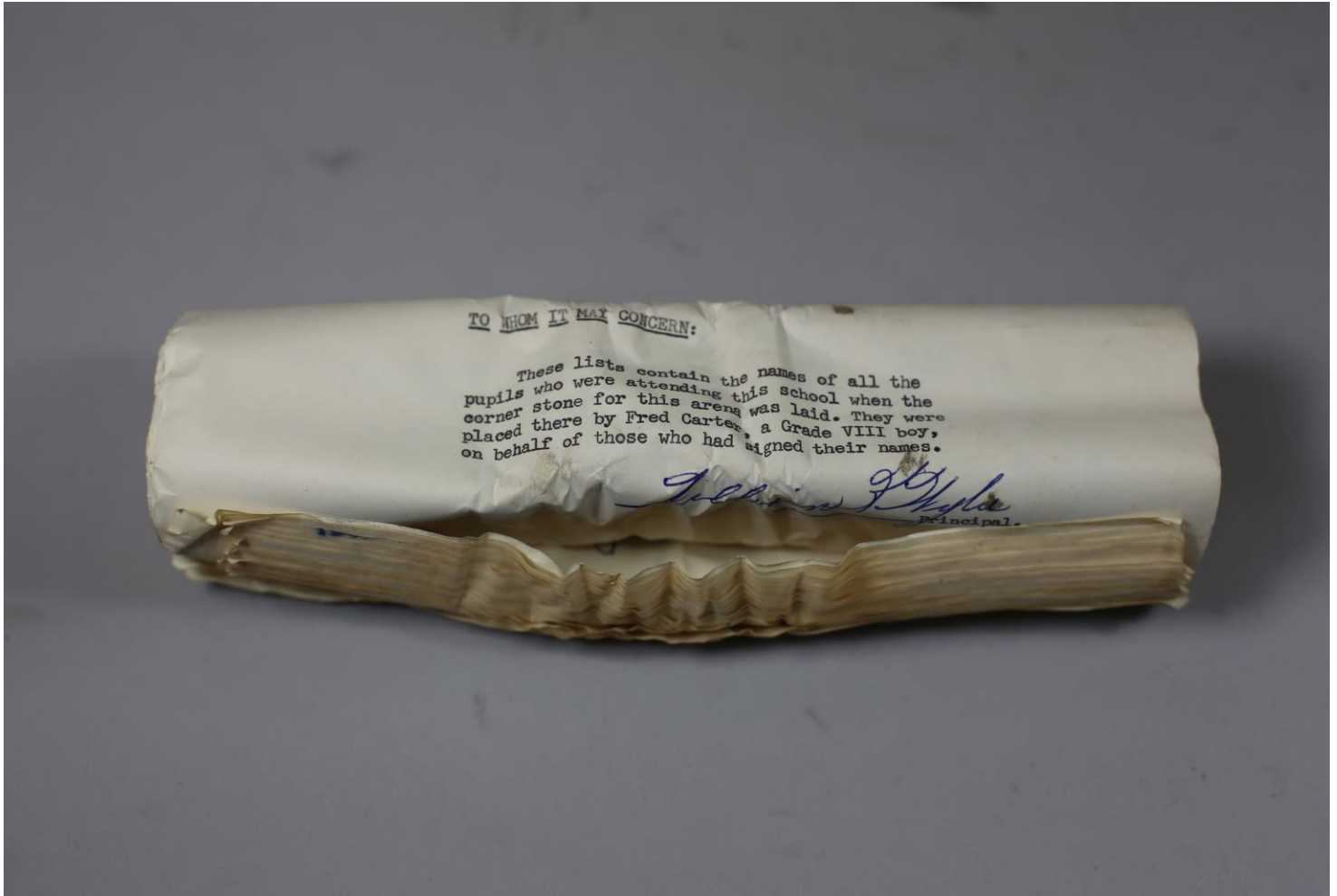
Image 2: View of the bottom of the cover page which notes who deposited the capsule, its contents, and its location. The document is signed by former principal William R. Wylie (Dundas Museum & Archives).