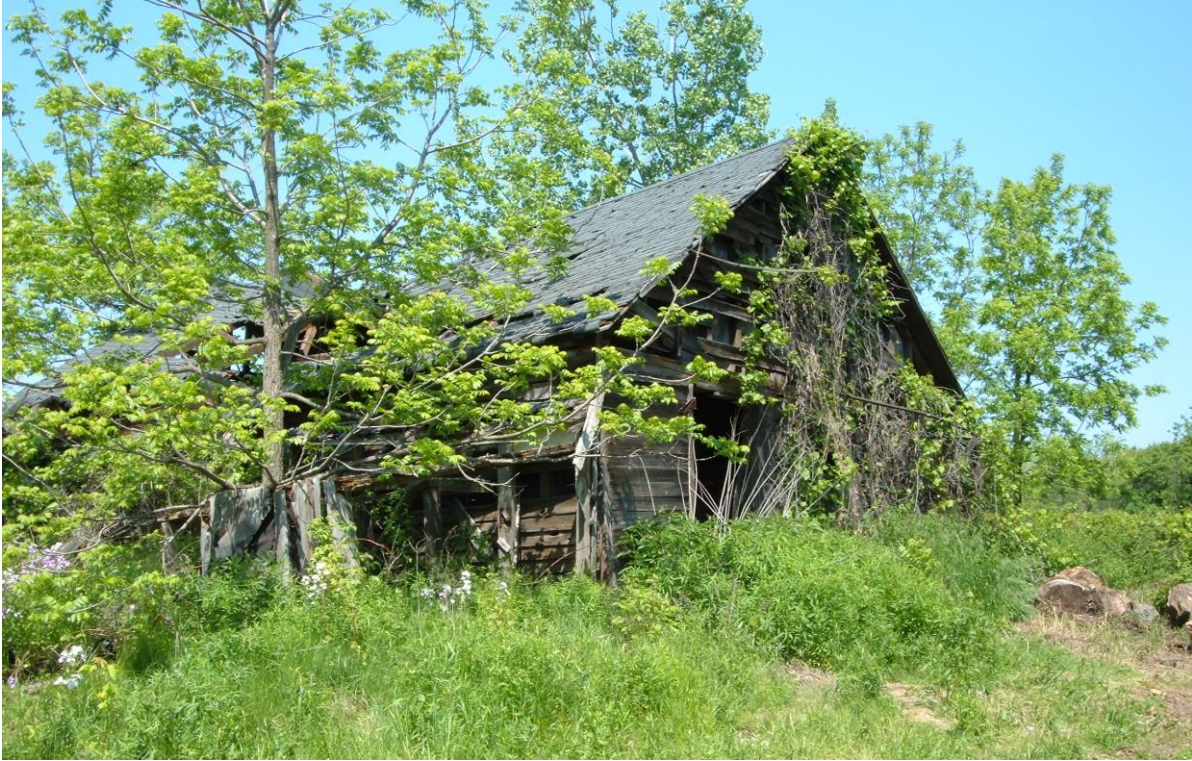
Image 5: View of one of the property’s crumbling outbuildings in 2010 (Wray, 2010).