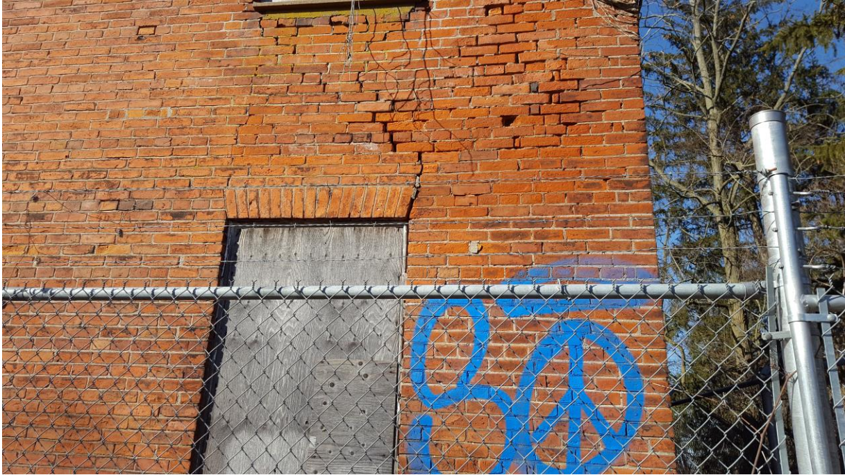
Image 3: The building has seen multiple instances of vandalism, such as graffiti as can be seen here on the northeast corner. Failing masonry and crumbling mortar is also visible throughout the walls (RCDH, 2018).