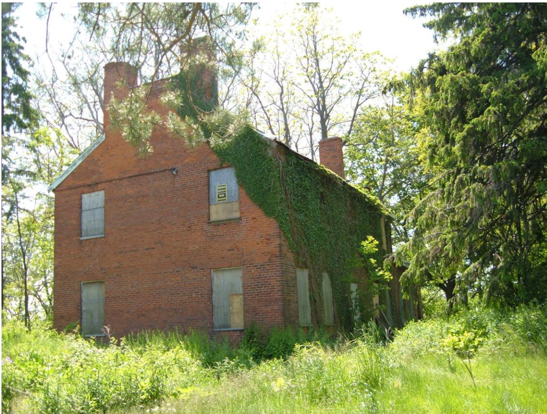
Image 4: In 2010, HMHC member Sylvia Wray conducted a site visit of the property. This image of the northeast corner shows the structure from the east (Wray, 2010).