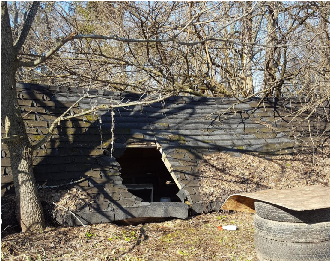
Image 6: View of what appears to be the remains of the same structure in 2018 (RCDH, 2018).