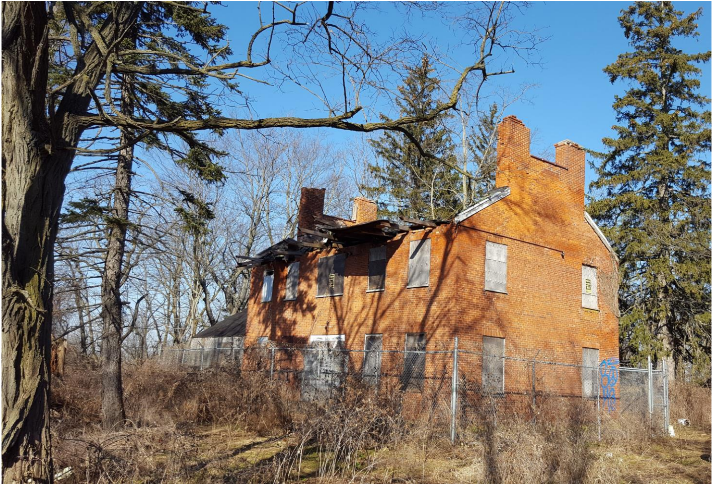
Image 1: Northwest-facing image of the Book House showing the structure’s disrepair and roof collapse (Roman Catholic Diocese of Hamilton, 2018).