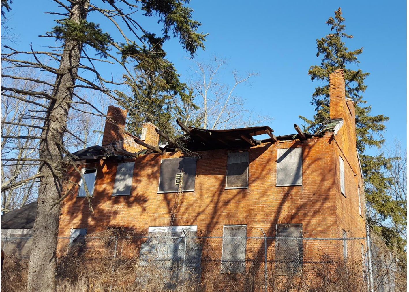
Image 2: A closer view of the front façade showing the remains of the roof and plywood covered windows and door. The owners erected a barbed wire fence perimeter around the building sometime after 2010 (RCDH, 2018).