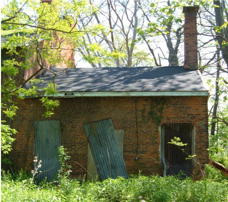
Image 7: The property contains an early or original one-storey brick wing, likely built as a kitchen, with a large chimney (Wray, 2010).