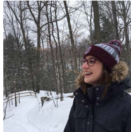
Current President of SwimAbility Hamilton