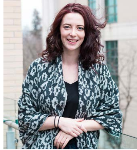
Current Coordinator at the Women and Gender Equity Network (WGEN) of the McMaster Student Union