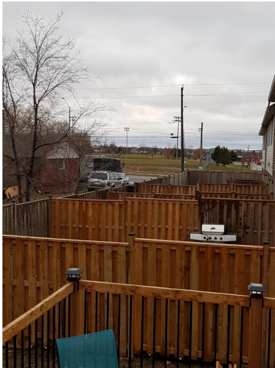
Current View From My Deck