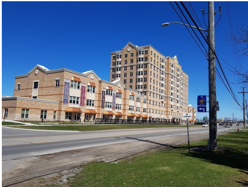
Rymal Rd and Upper Wentworth 10 Storey Building