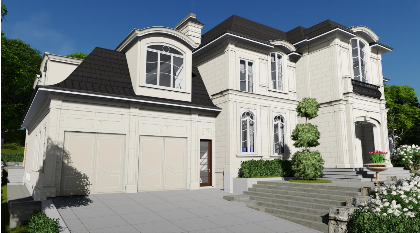
Front View No.2