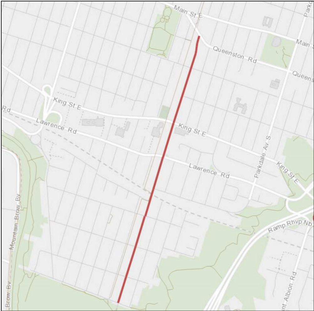
_____ RESTRICTED AREA