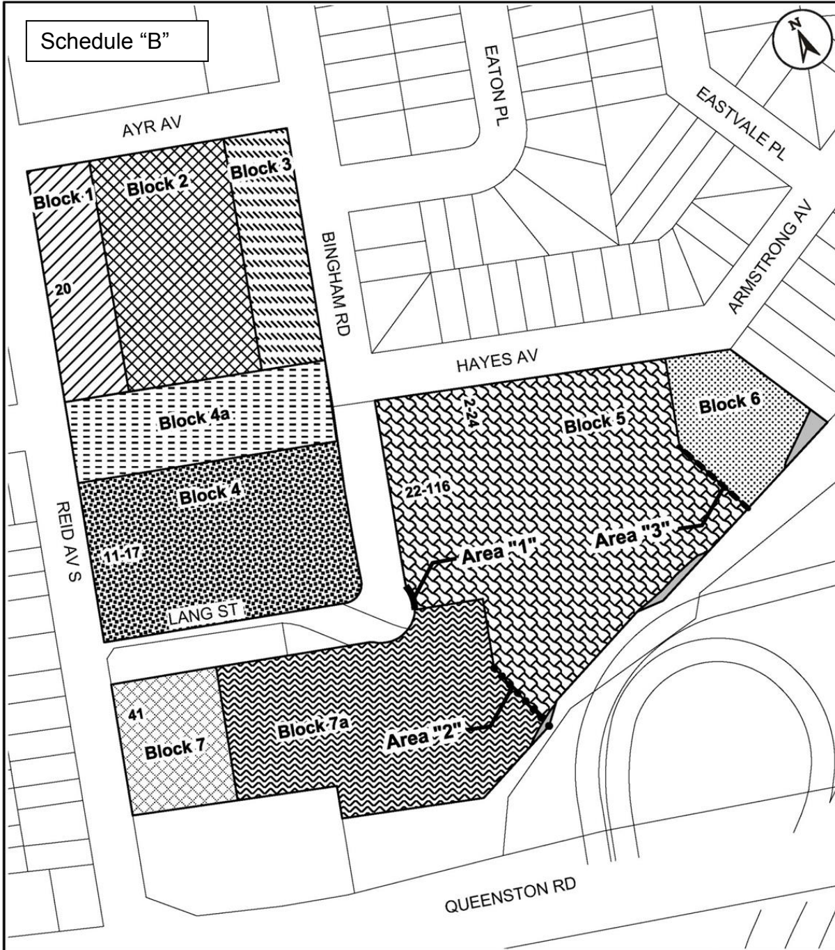
Figure 20 to Schedule F - Special Figures