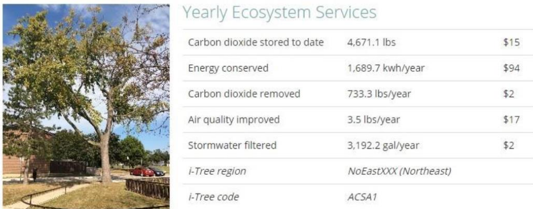
Figure 3: Ecosystem services provided by the mature Silver Maple

Many of the trees that may be removed in this process are mature Norway Maples, which are non-native and invasive. However, there is a mature Silver Maple (43.234405, -79.786541) with a diameter at breast height of 59 cm. If possible, efforts should be made to preserve this individual, which contributes significant ecosystem services to the area (see Figure 3 ). The 60 trees inventoried in the area are mostly mature specimens providing important ecosystem services ( Figure 4 ).