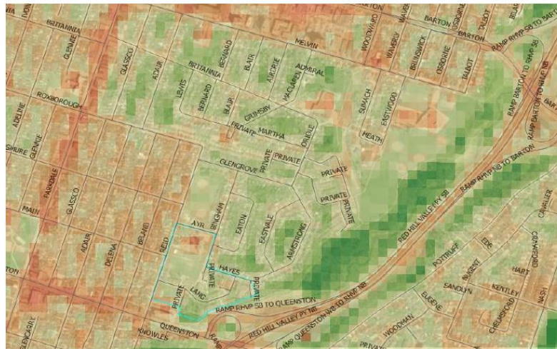
Figure 1: Vegetation index in McQuesten, with proposed development highlighted in blue. City Housing property has some of the greatest tree canopy in the neighbourhood.

Air particulate pollution monitoring occurred throughout the summer of 2017 in the region, conducted by Trees Please staff using hand-held Dylos DC1700 particulate matter sensors. Volunteers could also sign out these monitors to collect local air quality data, providing a broader data set. These monitors detect the levels of particulate matter less than 2.5 microns in diameter (PM2.5). This air particulate matter is a fine dust produced by traffic, industry, and construction. Particulate matter as large as 10 microns in diameter is inhalable and linked to many respiratory and cardiac-related illnesses, whereas PM2.5 is even more concerning as the particles and any attached heavy metals are small enough to enter deeper into the lungs and even bloodstream. Trees are able to capture 50% of PM2.5 while also sequestering carbon, therefore strategic planting is needed to help manage urban air quality and mitigate human health risk.