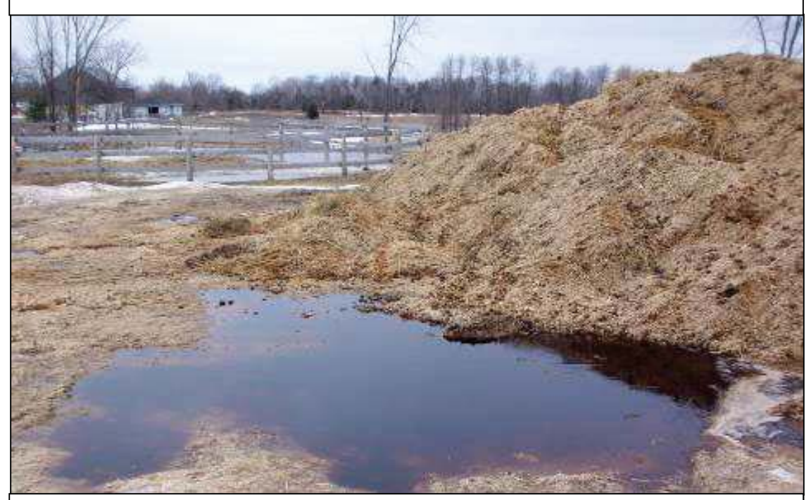
This equates to 38,092 dump trucks of manure!

Safely store 265,125 m³ of livestock manure to reduce the risk of nutrient, pathogen and bacteria contaminating drinking water, streams and wetlands.