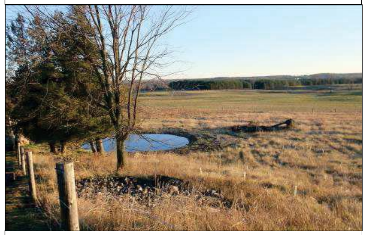
This is an area equal to 114 football fields!