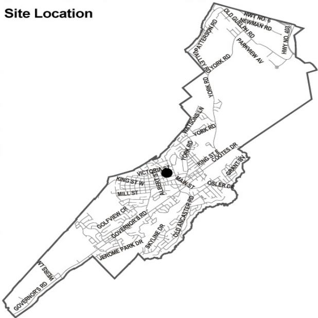
Key Map - Ward 13