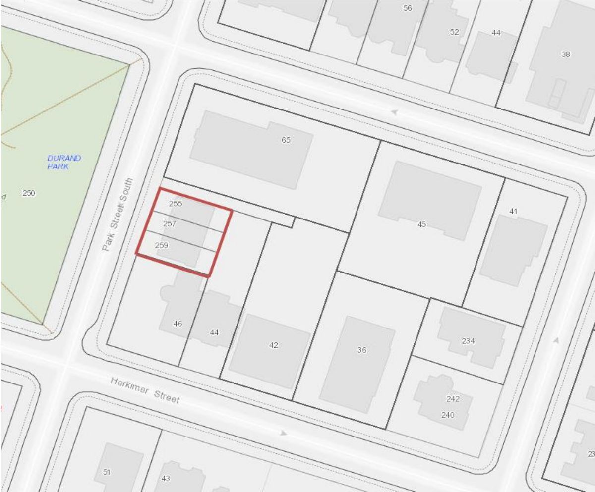
Map identifying 255-259 Park Street South, Hamilton: