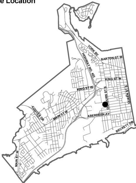
Key Map - Ward 1