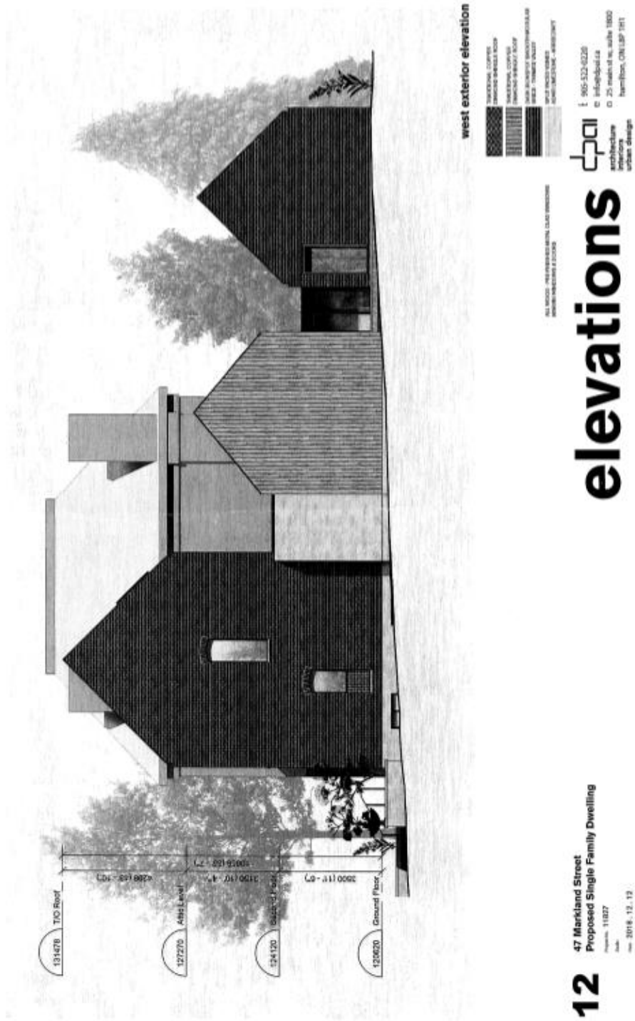
West Side Elevation