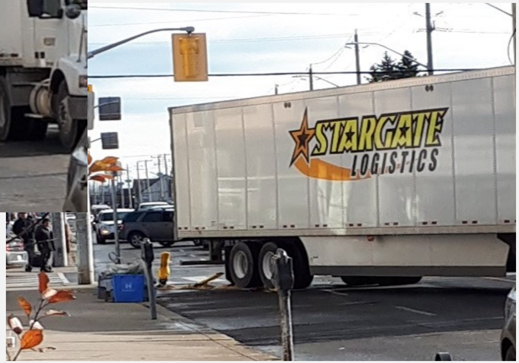
Barton and Lottridge – Bollards knocked down