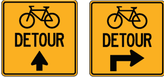
Tc-41 (OTM) (450 mm x 450 mm)