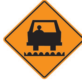
Tc-19 (OTM) (600 mm x 600 mm)