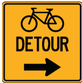
Tc-41R (OTM) (450 mm x 450 mm)