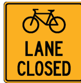
Tc-43 (OTM) (450 mm x 450 mm)