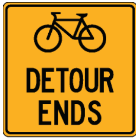
Tc-42 (OTM) (450 mm x 450 mm)