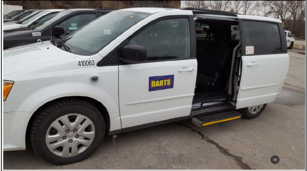
DARTS van showing the installed step (these are on both sides of the vehicle) to assist seniors with entering the van.