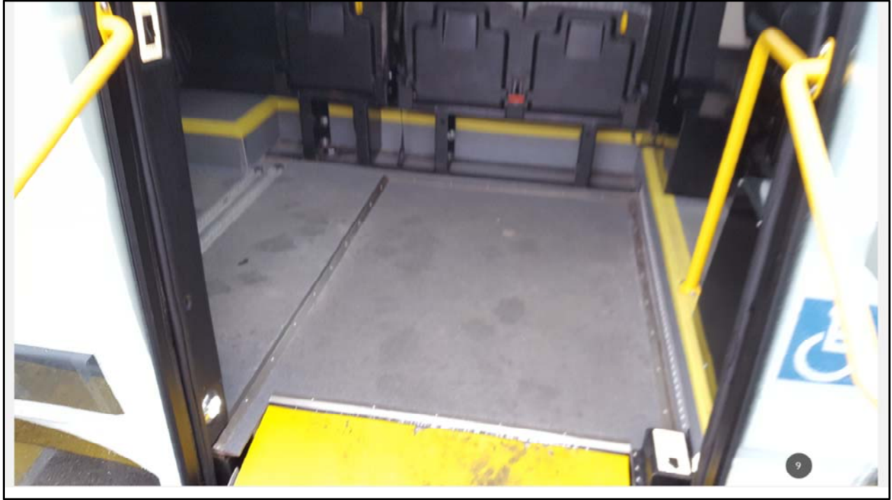
The door of the Promaster showing the floor space for two wheelchairs.