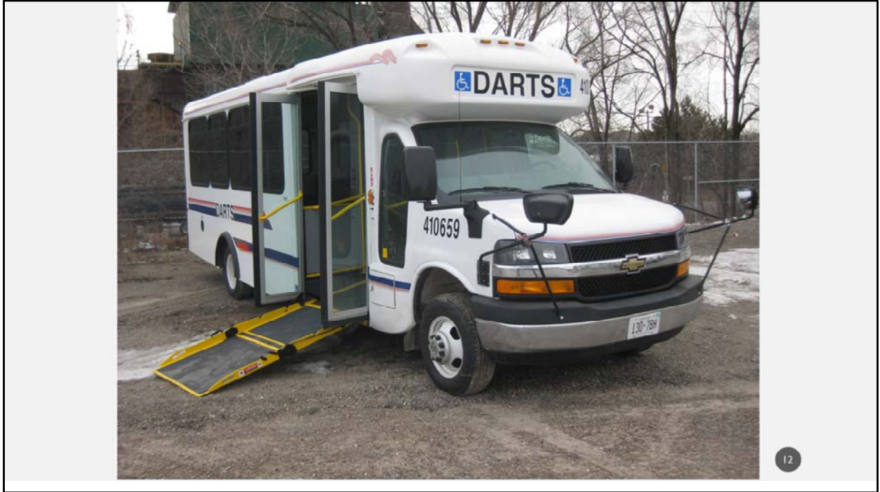
ARBOC bus with the ramp extended.