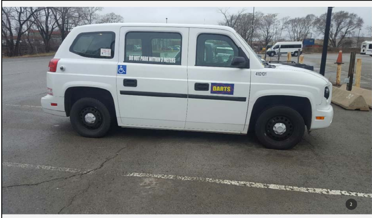
Outside view of a MV-1 vehicle.