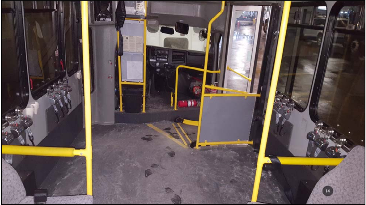
Inside the ARBOC bus standing at the back looking forward. Note the space for wheelchairs and the greater width of the floor space relative to the Promaster.