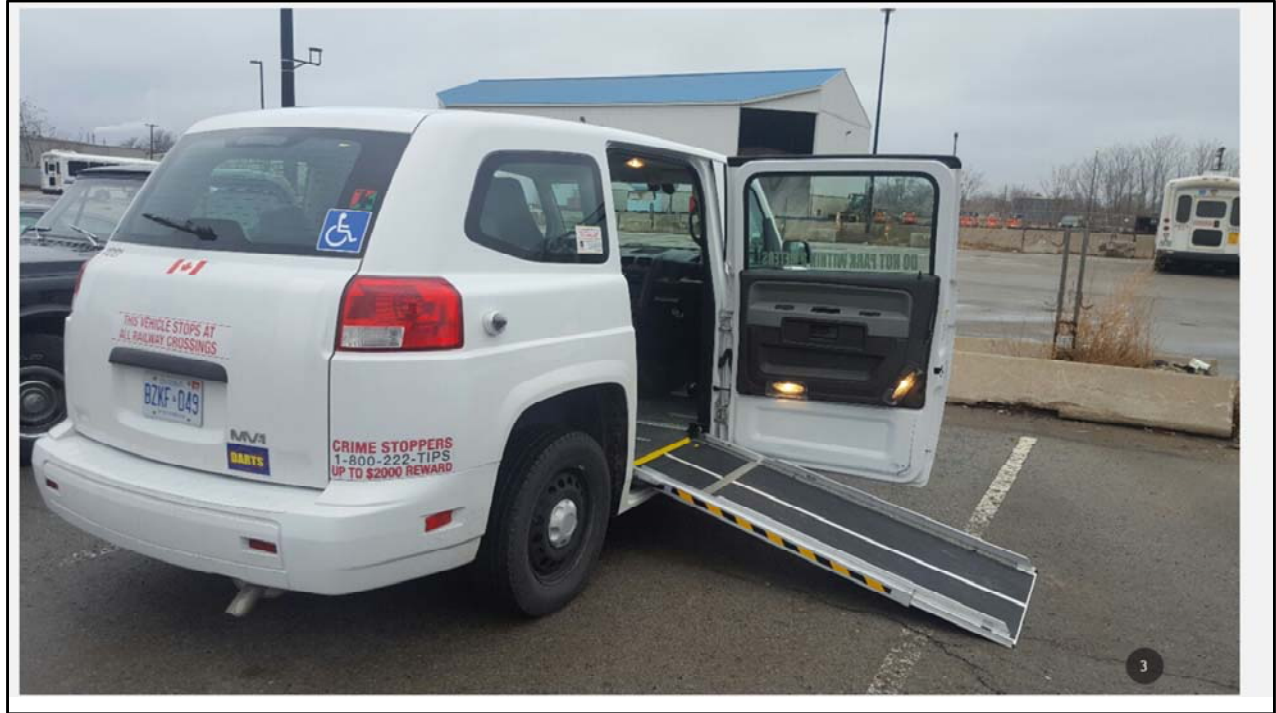
MV-1 with the ramp extended.