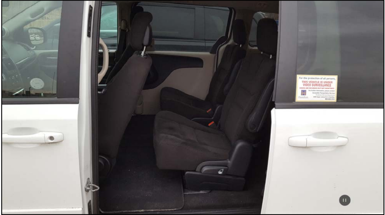
Showing the back seats of the DARTS vans.