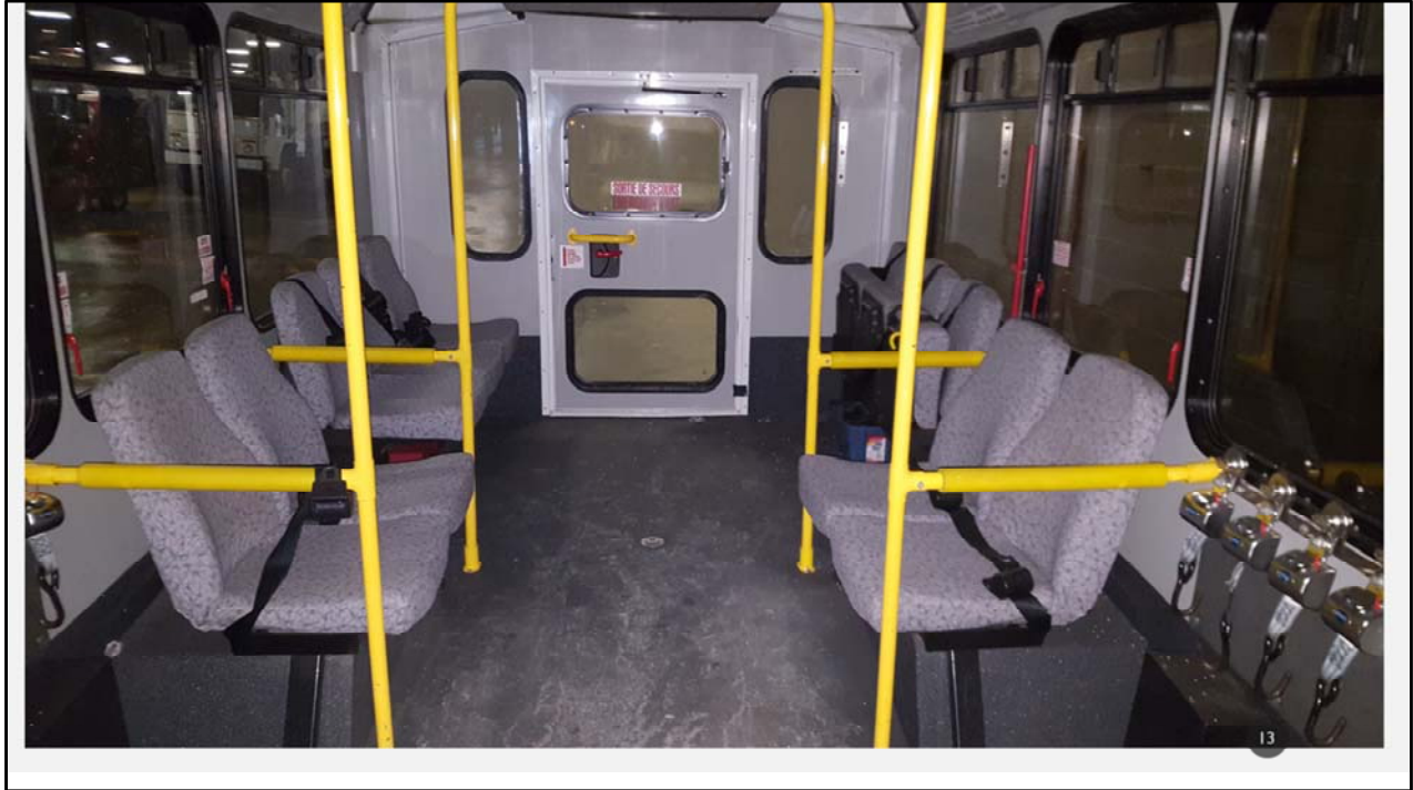
Inside the ARBOC bus looking towards the back. The very back seats can flip up to expose two wheelchair spots.