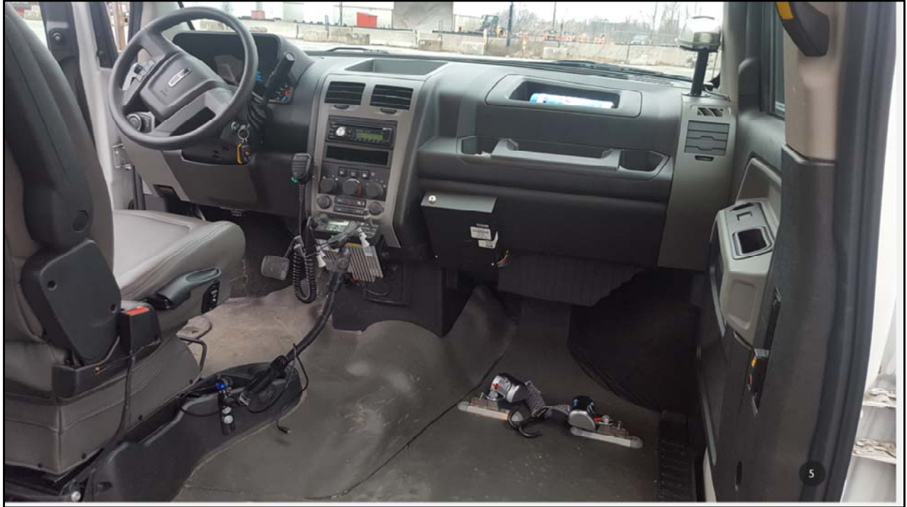
Inside the MV-1 vehicle looking forward. Shows the position of the one wheelchair spot in the front passenger position.