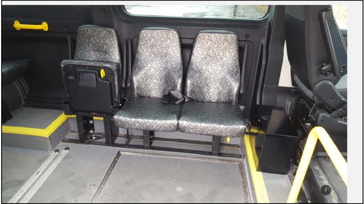
Inside the Promaster showing the three bench seats on the far wall of the vehicle.