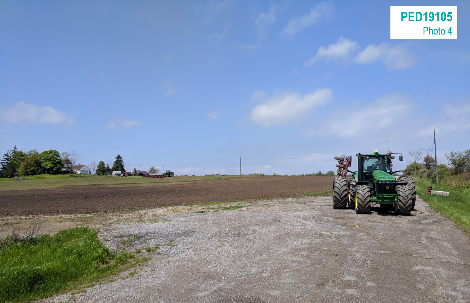
Looking north at the retained farmland.