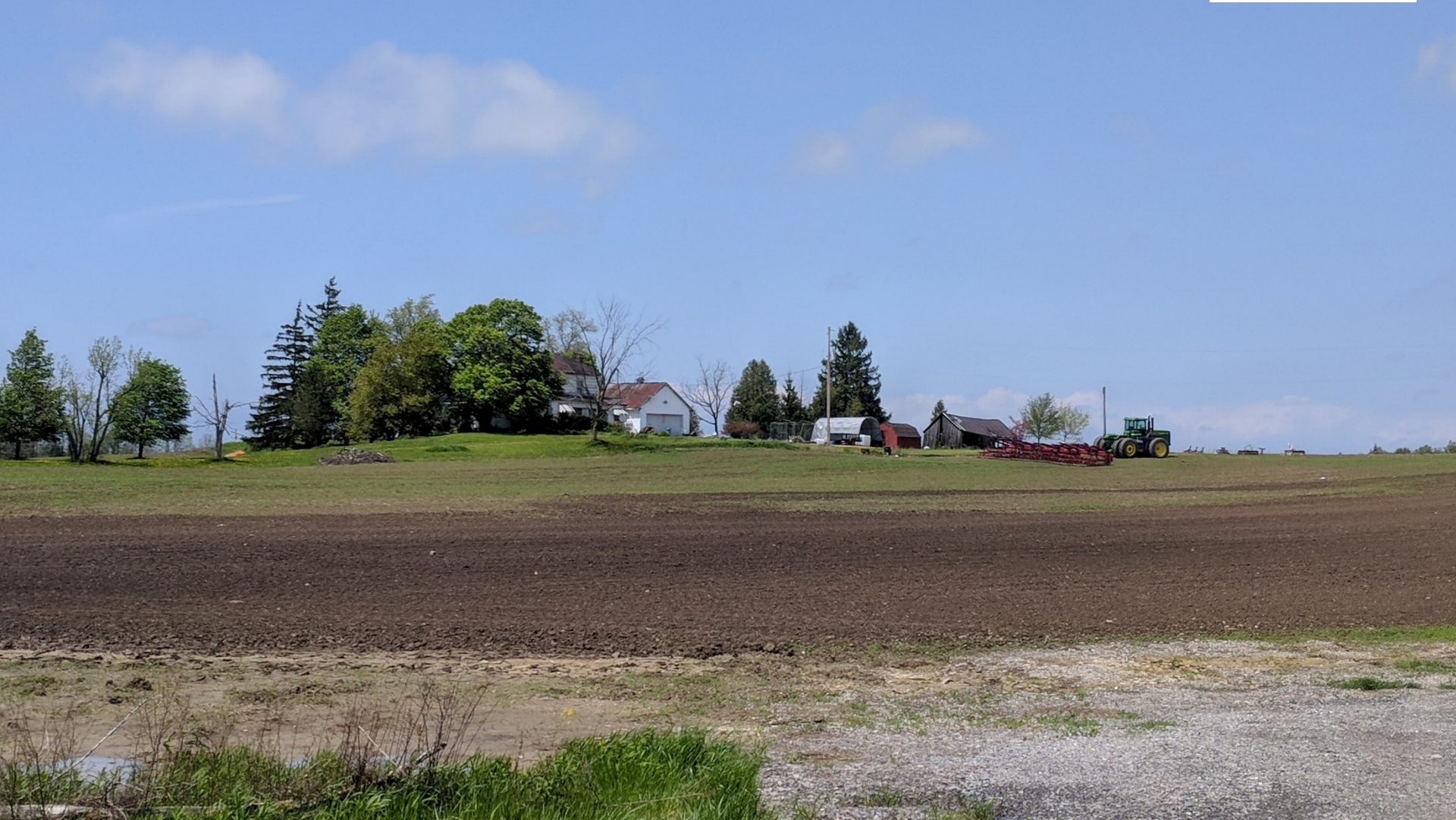
Surplus Farm Dwelling to be Severed.