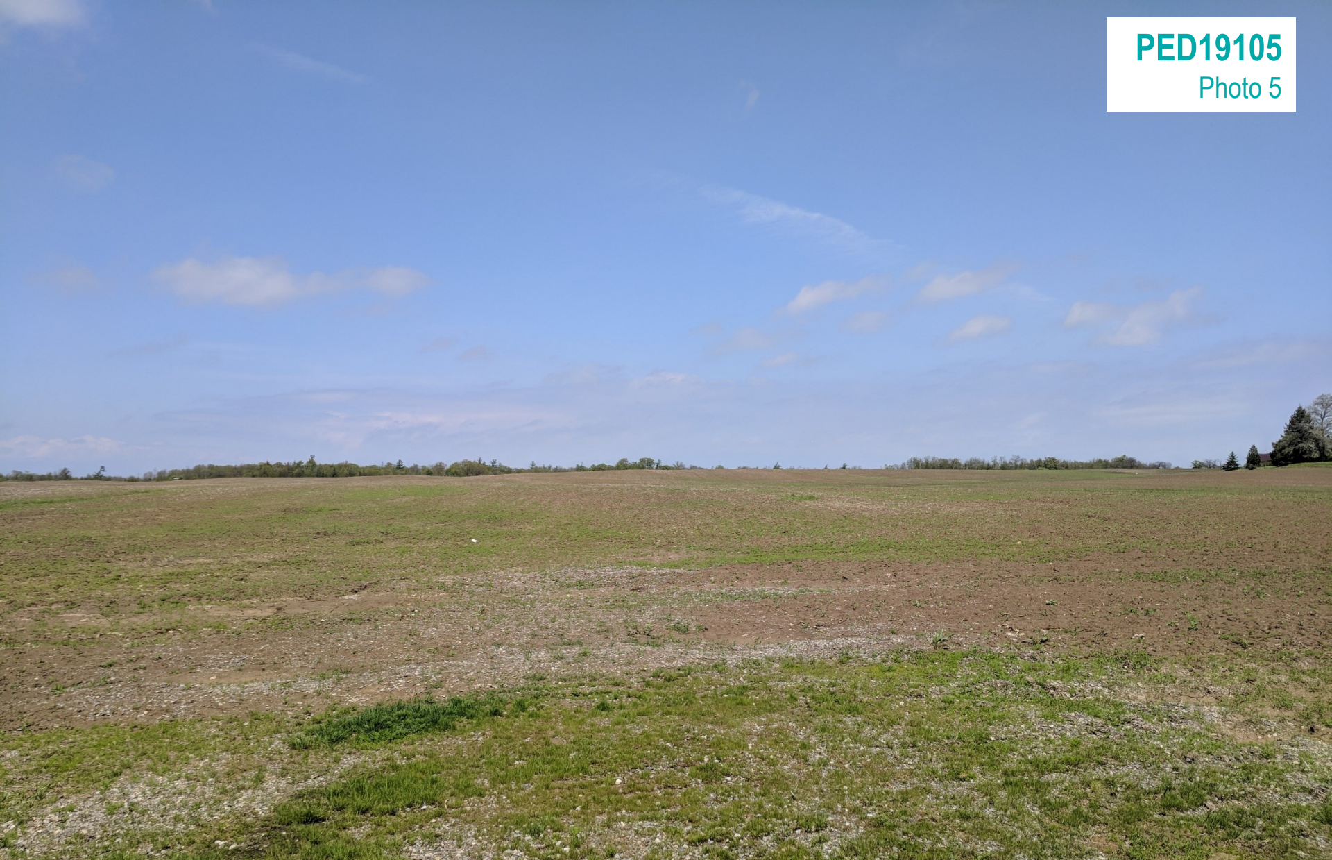
Looking north at the retained farmland.