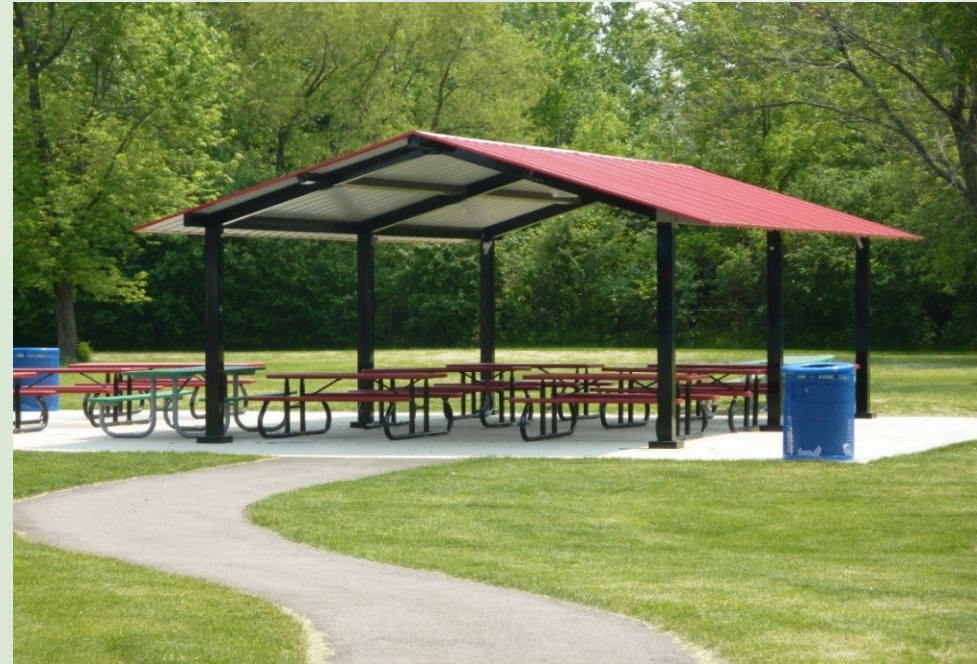
Outdoor Gazebo Structure