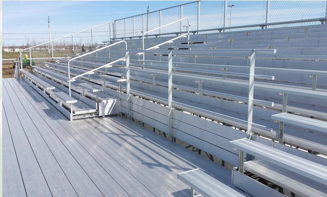
Spectator Bleacher Seating