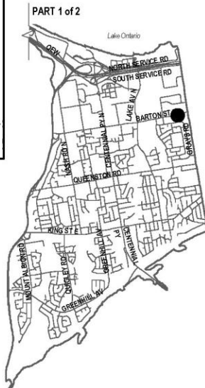
Key Map - Ward 5