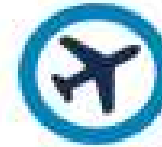
Monitoring Airline Partner Activities