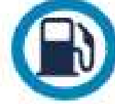
Fleet Gasoline and Diesel Consumption