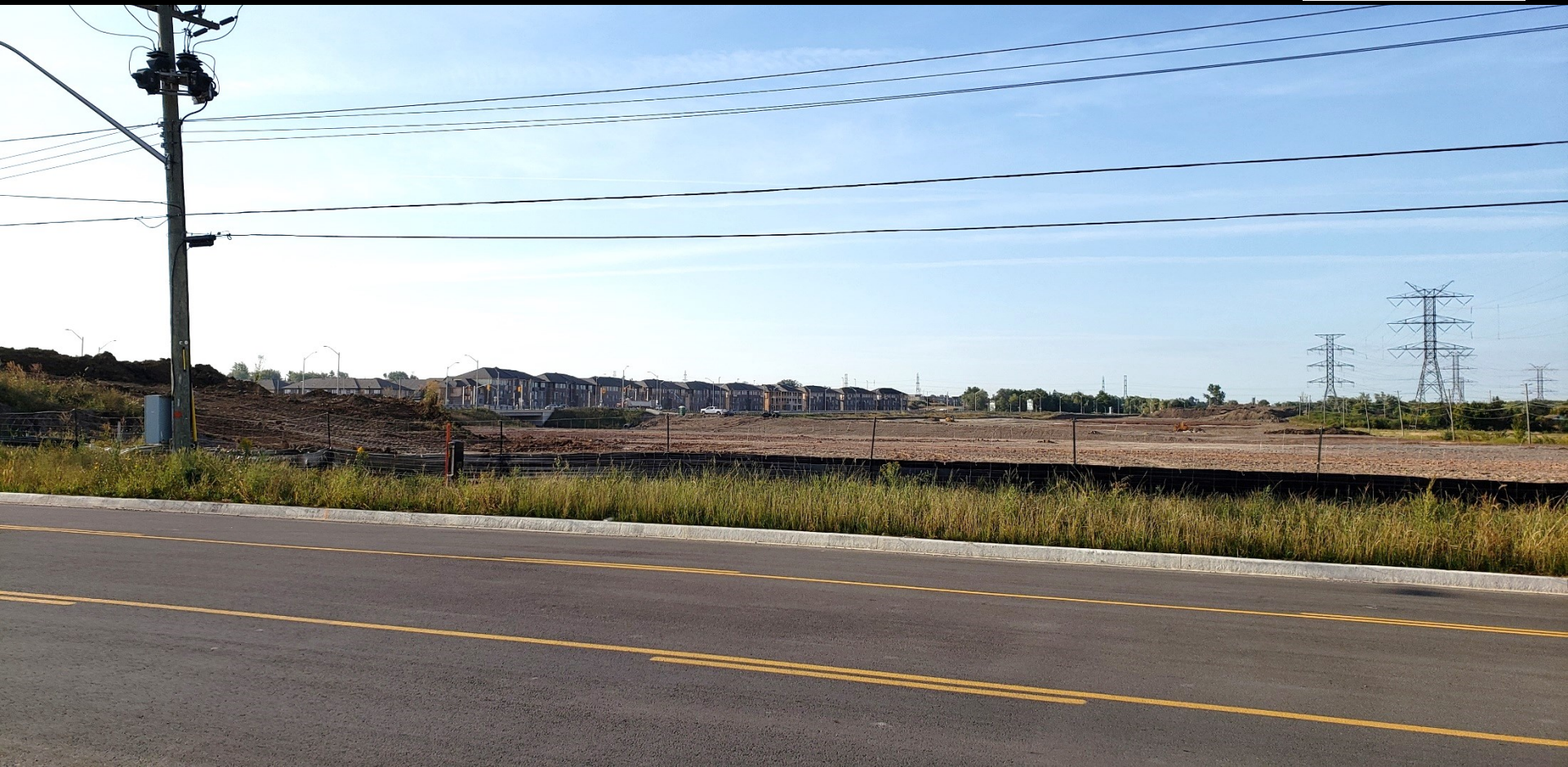
View to the west along Highland Road West