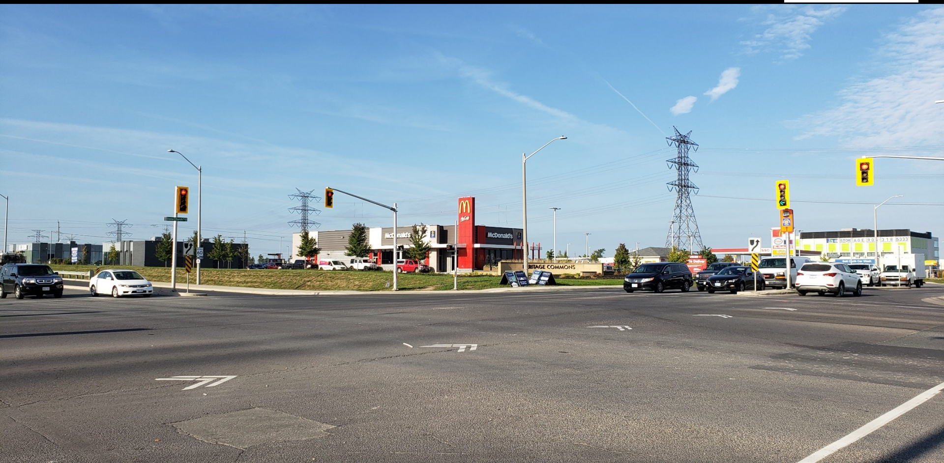
Northwest corner of site from Upper Red Hill Valley Parkway and Stone Church Road East