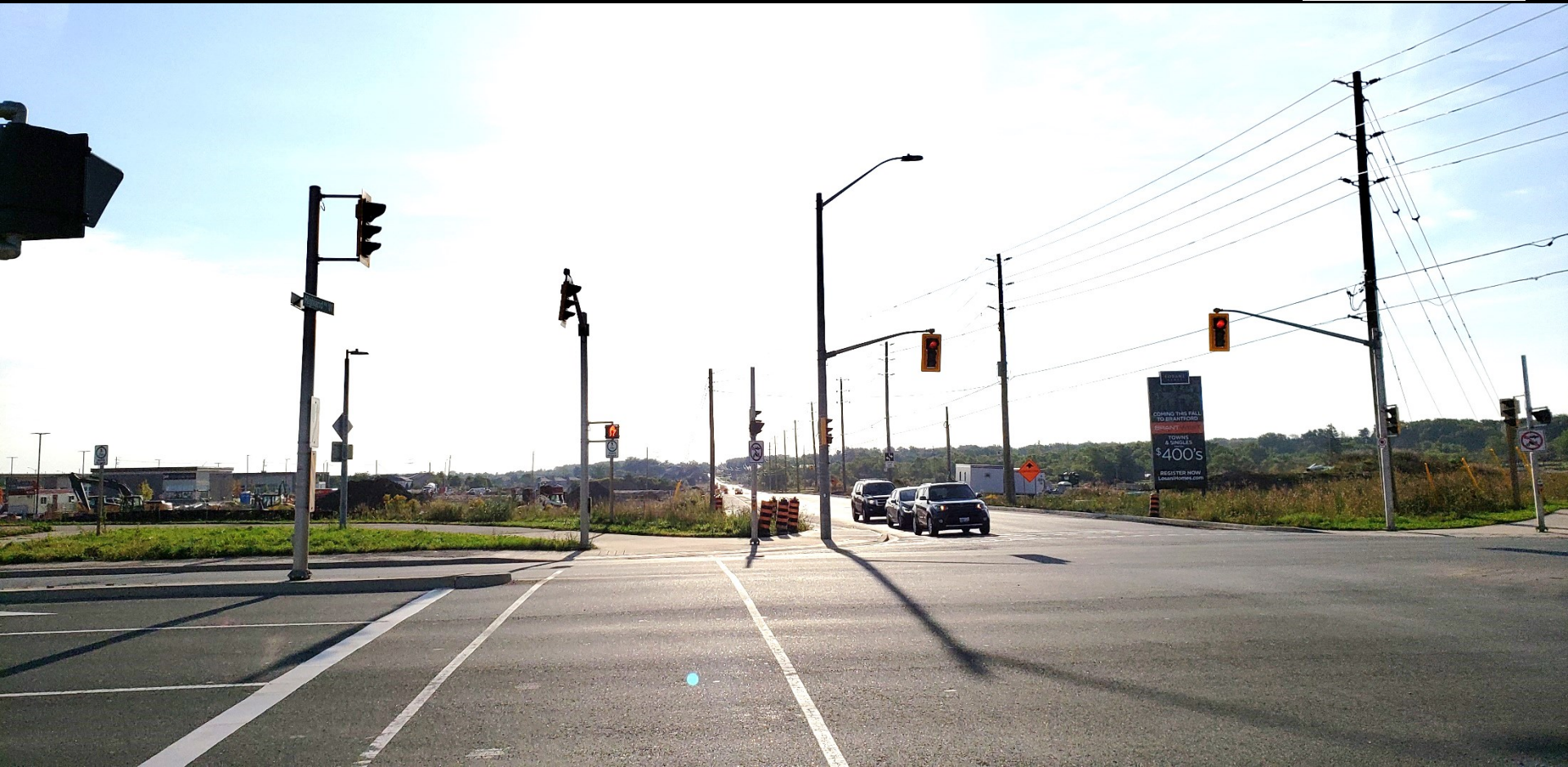
View to the east along Highland Road West