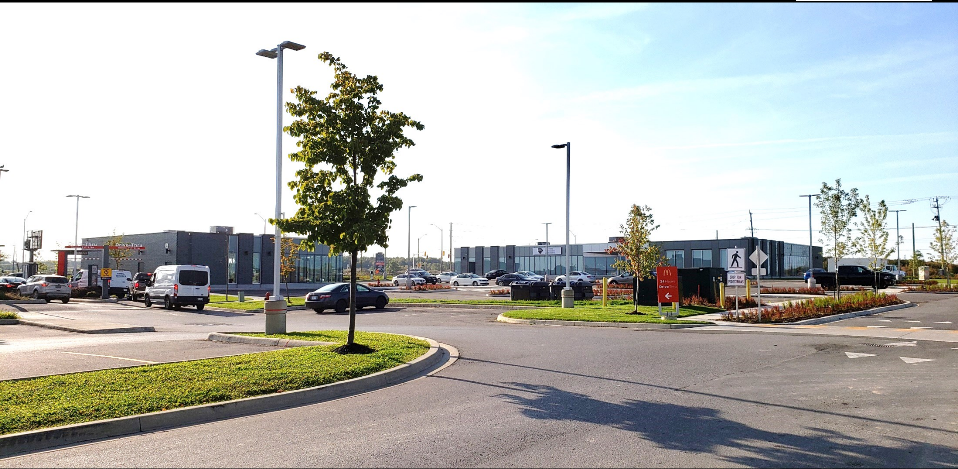
Interior of the subject site from the northeast