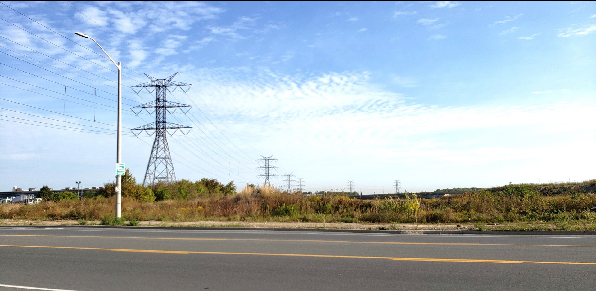
View to the west along Stone Church Road East