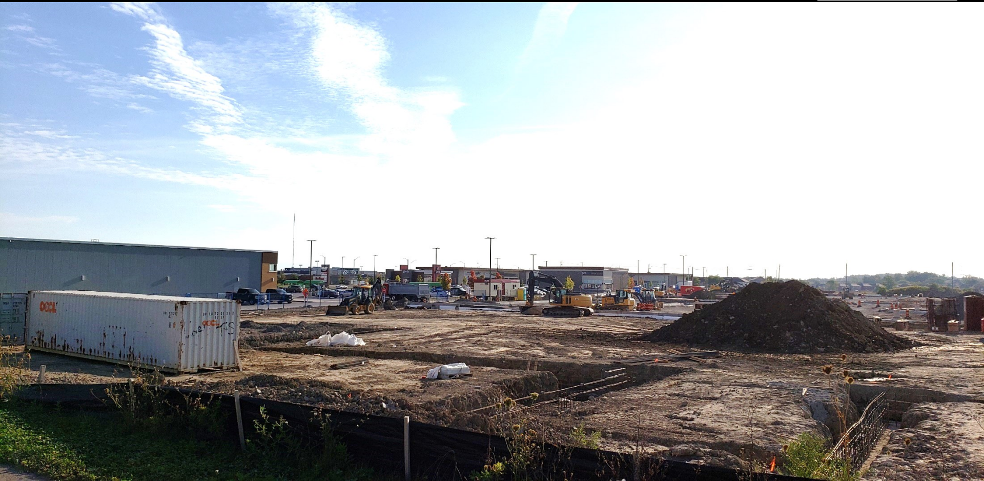
Adjacent development to the east across Upper Red Hill Valley Parkway