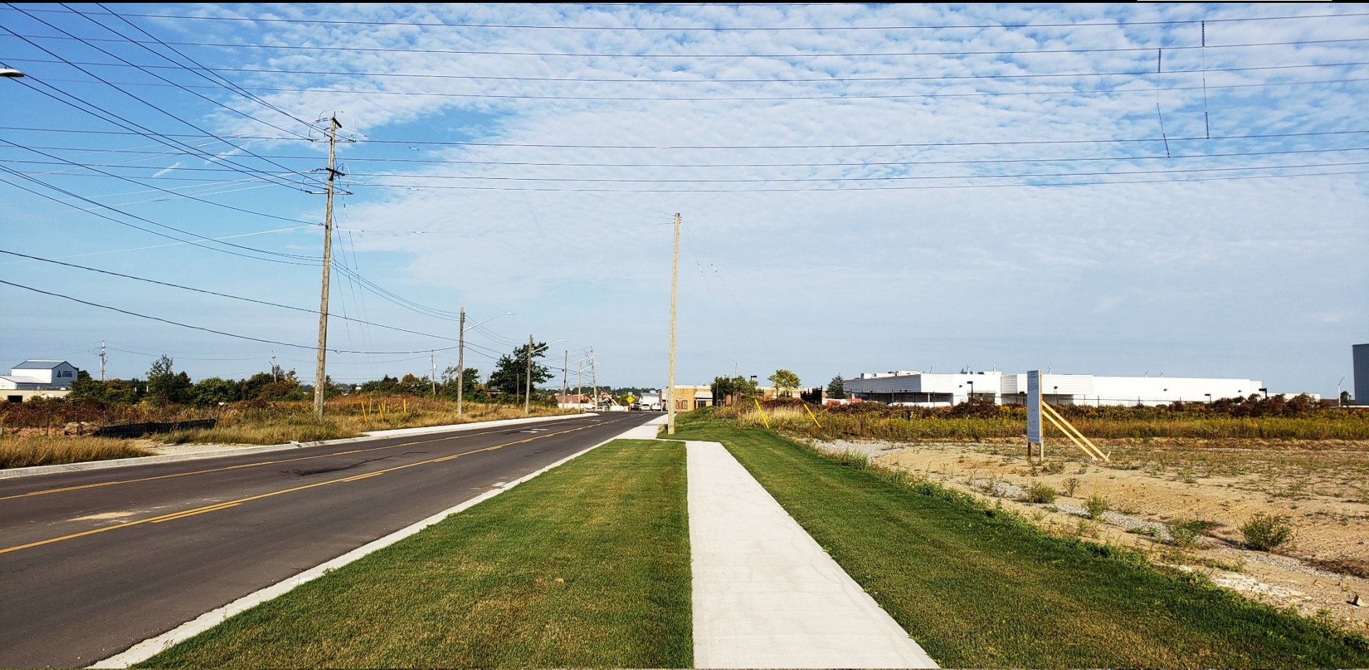
Adjacent development to the west