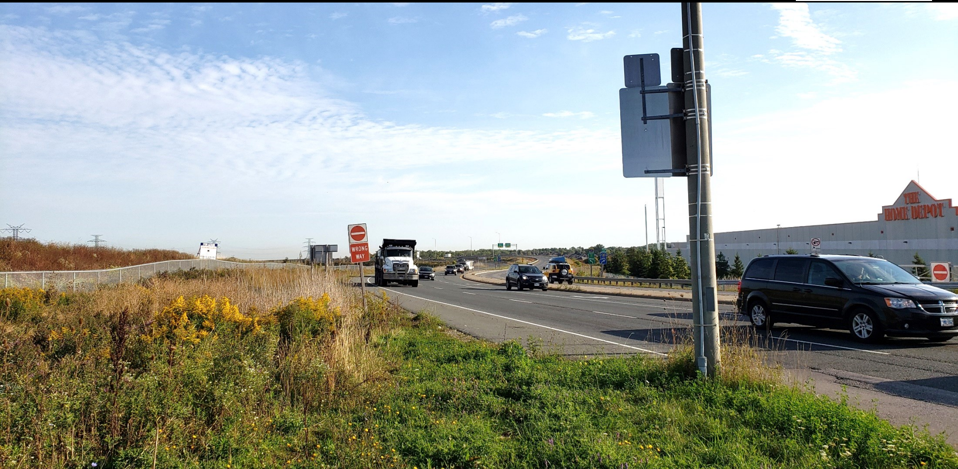
View to the north along Upper Red Hill Valley Parkway