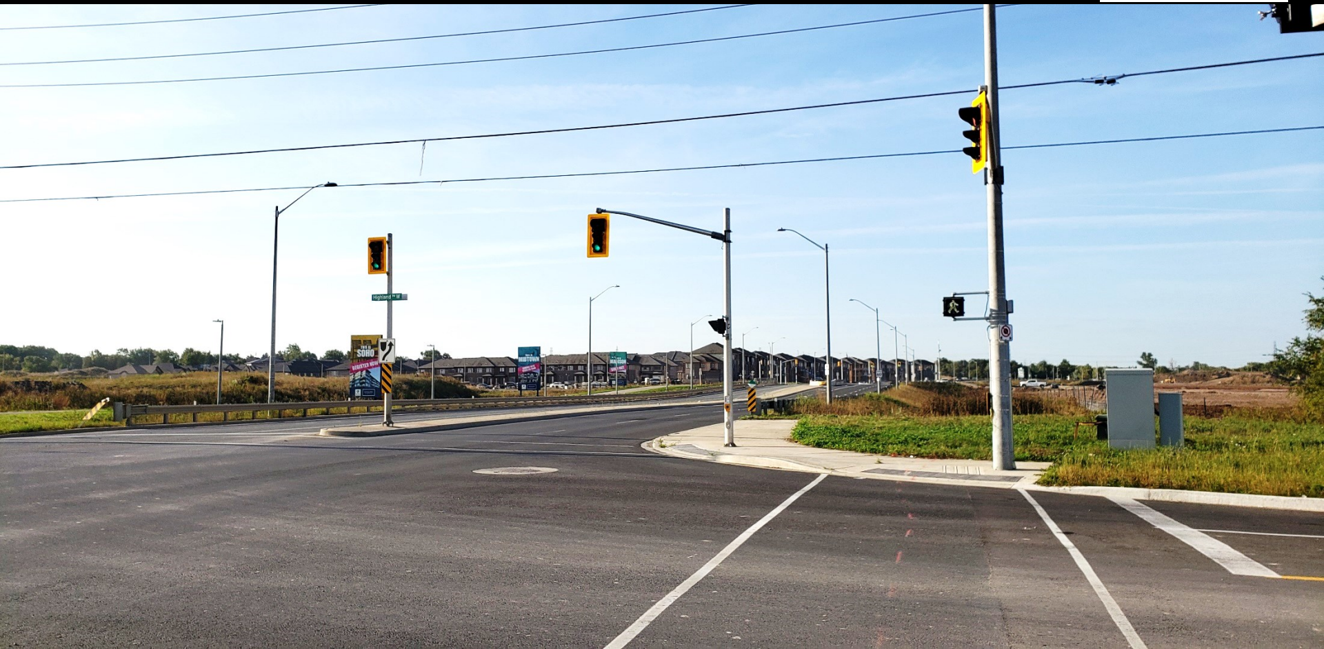
View to the south along Upper Red Hill Valley Parkway