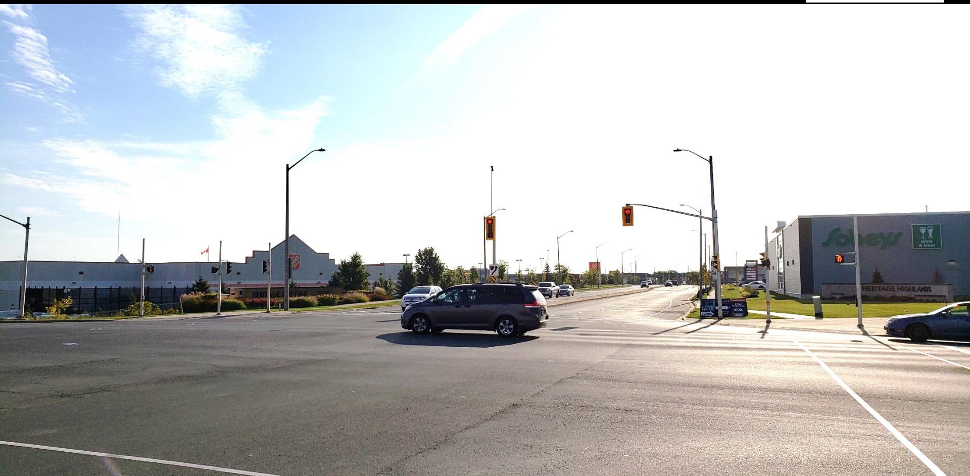
View to the east along Stone Church Road East