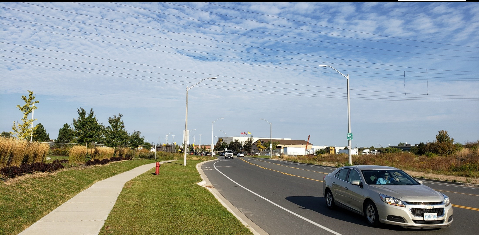
View to the south across Highland Road West along hydro corridor