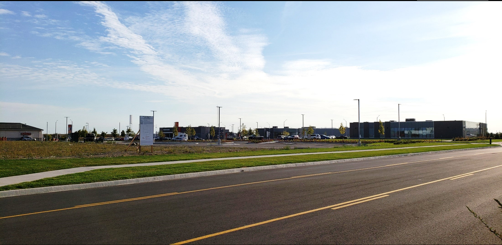
Southwest corner of site from Highland Road West