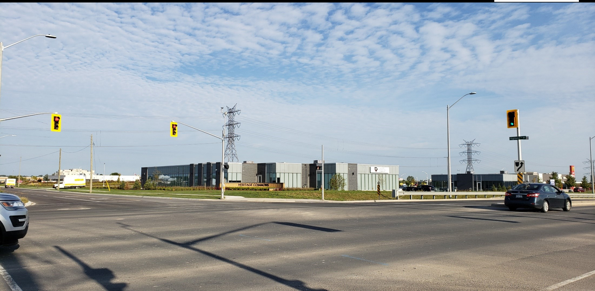
Southeast corner of site from intersection of Upper Red Hill Valley Parkway and Highland Road West