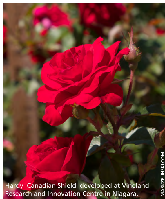
Hardy 'Canadian Shield' developed at Vineland Research and Innovation Centre in Niagara.