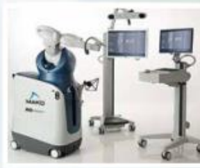
The MAKO Rio Surgical Robotic System

In Canada, arthritis is the second most common chronic illness with 1 in 5 Hamiltonians affected by this debilitating condition. Over 1,800 arthritis patients from across the region visit St. Joe's each year for orthopaedic surgery and many others are patients in the Fracture Clinic.