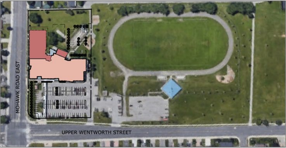
CONTEXT PLAN 1 N.T.S.