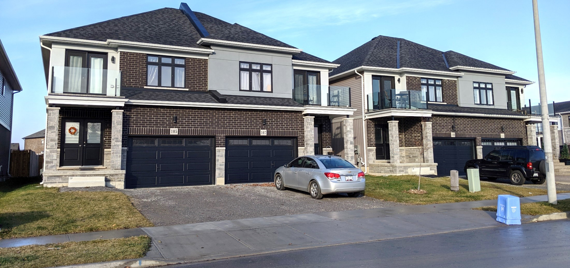
West side of Springvalley Crescent