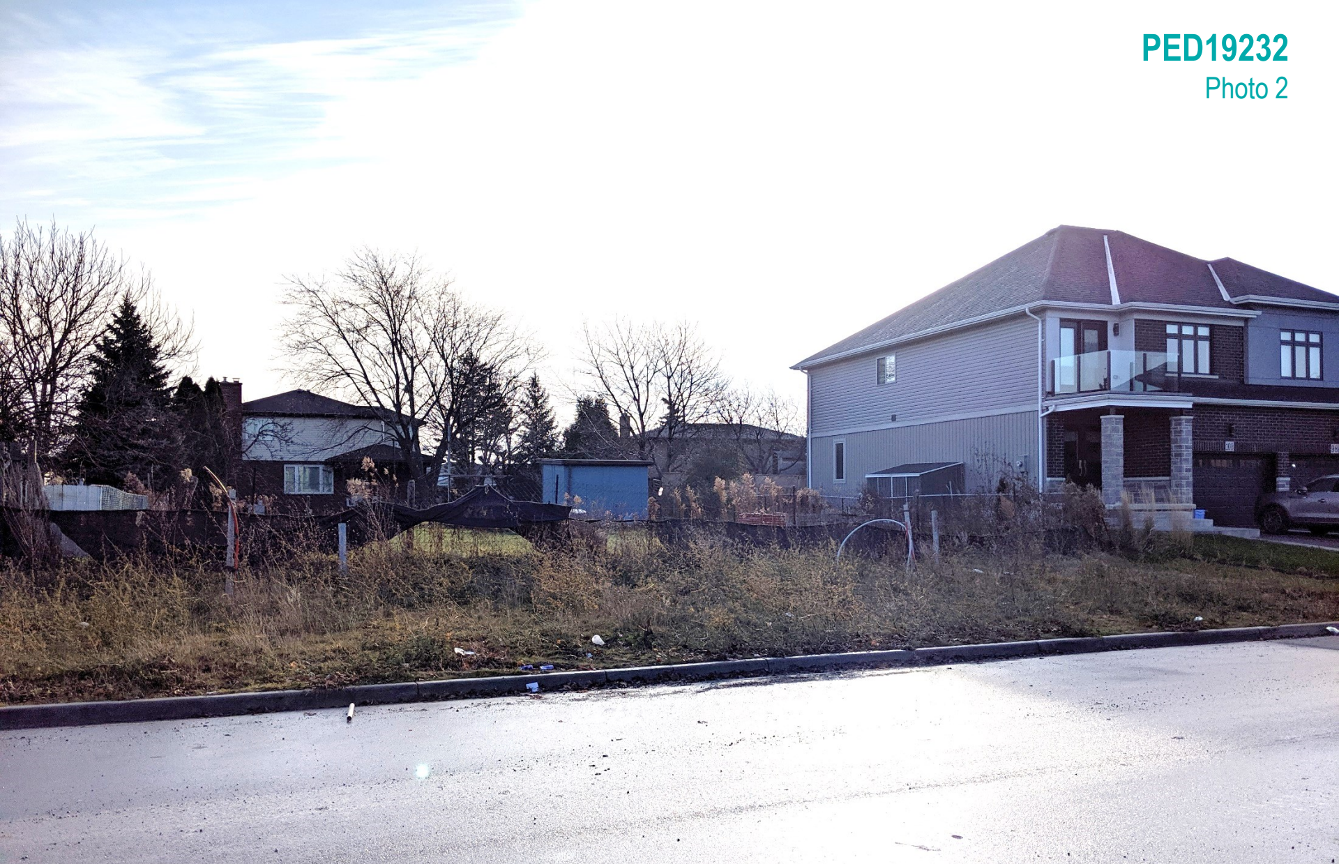
Vacant lands to the south and existing semi detached dwellings