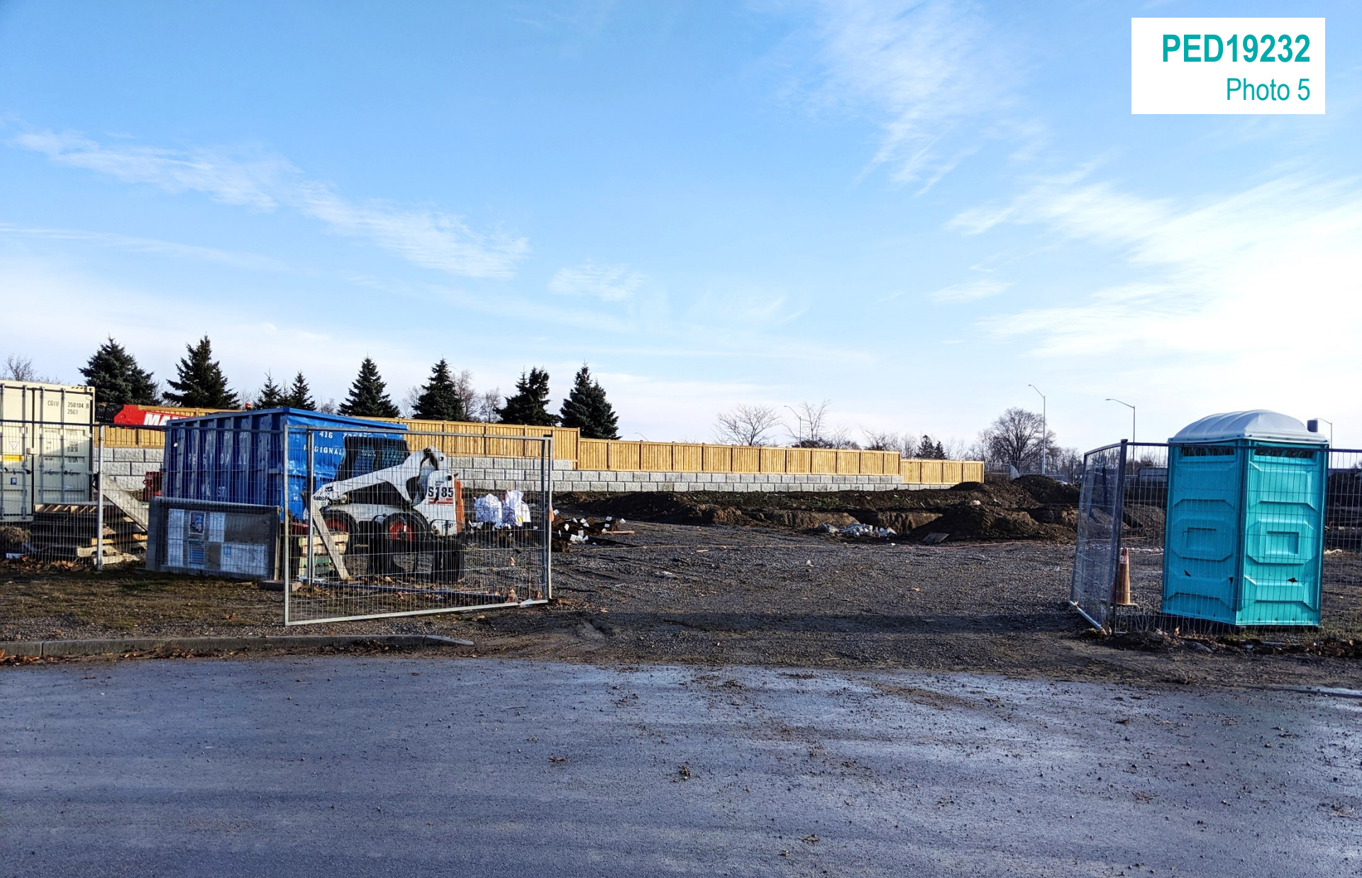
Lands to the North, proposed four storey multiple dwelling