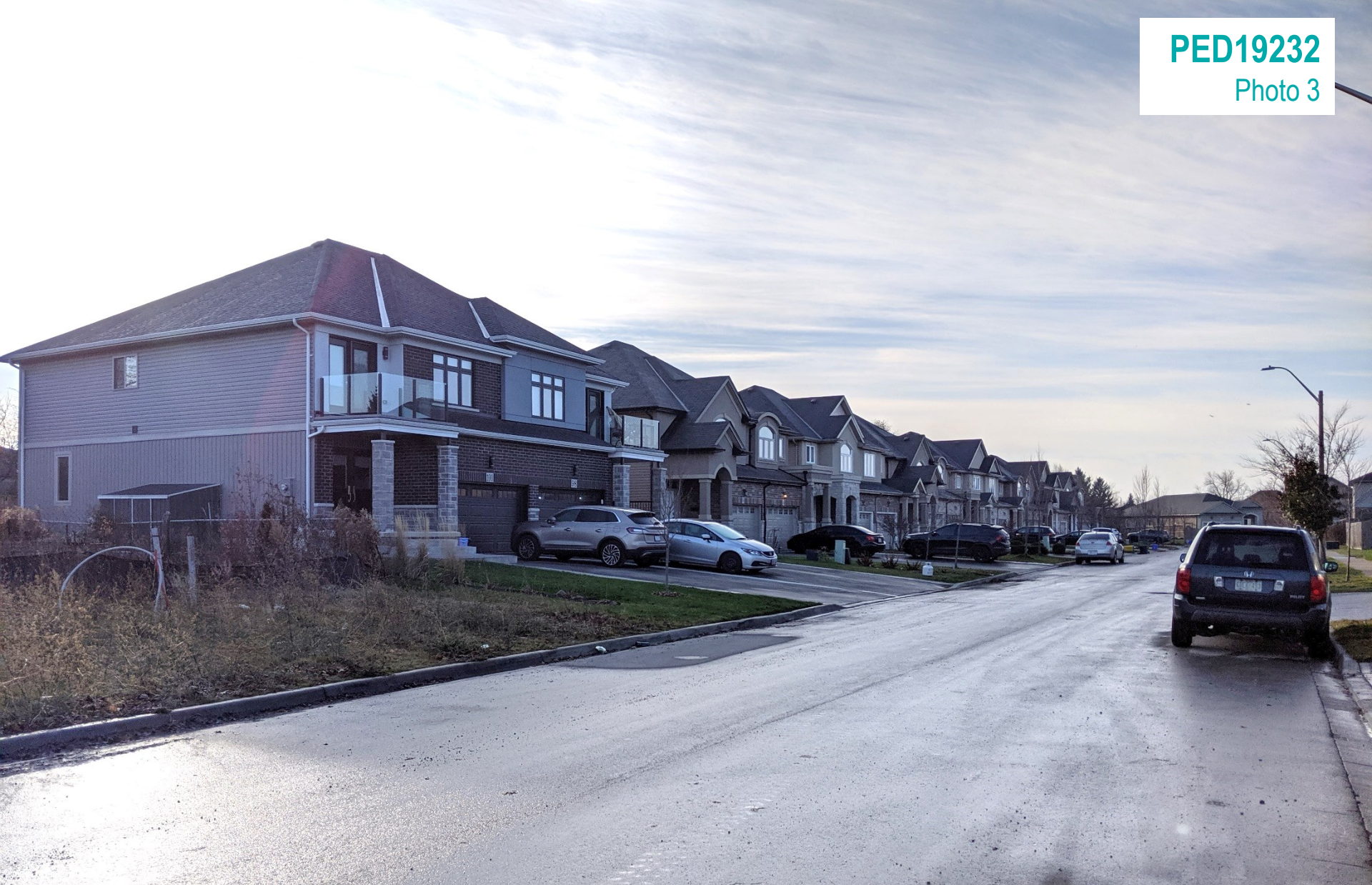
Existing streetscape along Springvalley Crescent to the south