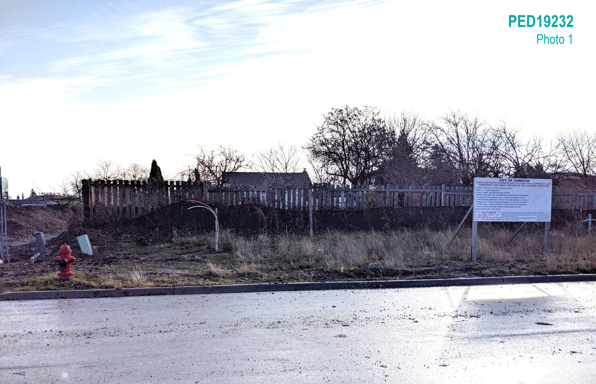
Subject Lands from Springvalley Crescent