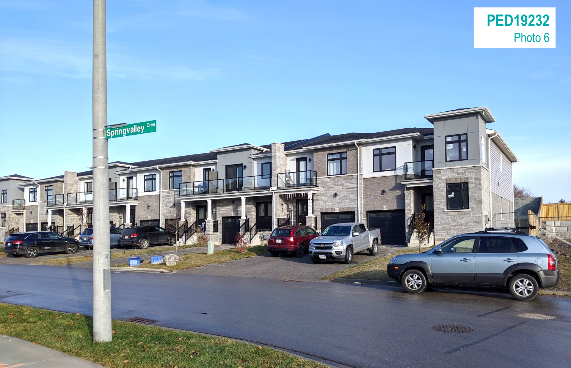
Street townhouses along Springvalley Crescent, northwest of Subject Lands