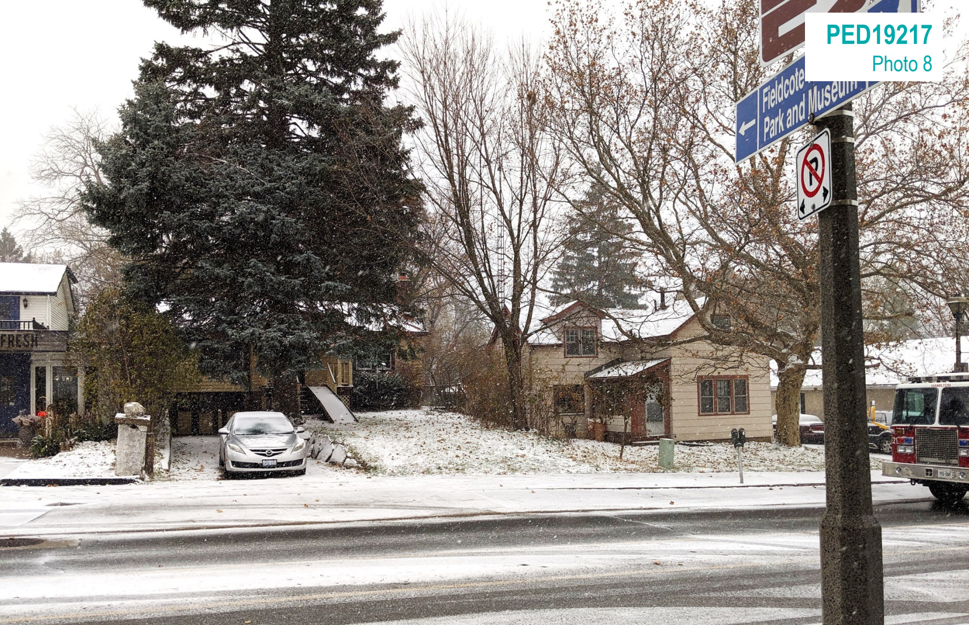
Existing uses on the west side of Wilson Street East, including commercial