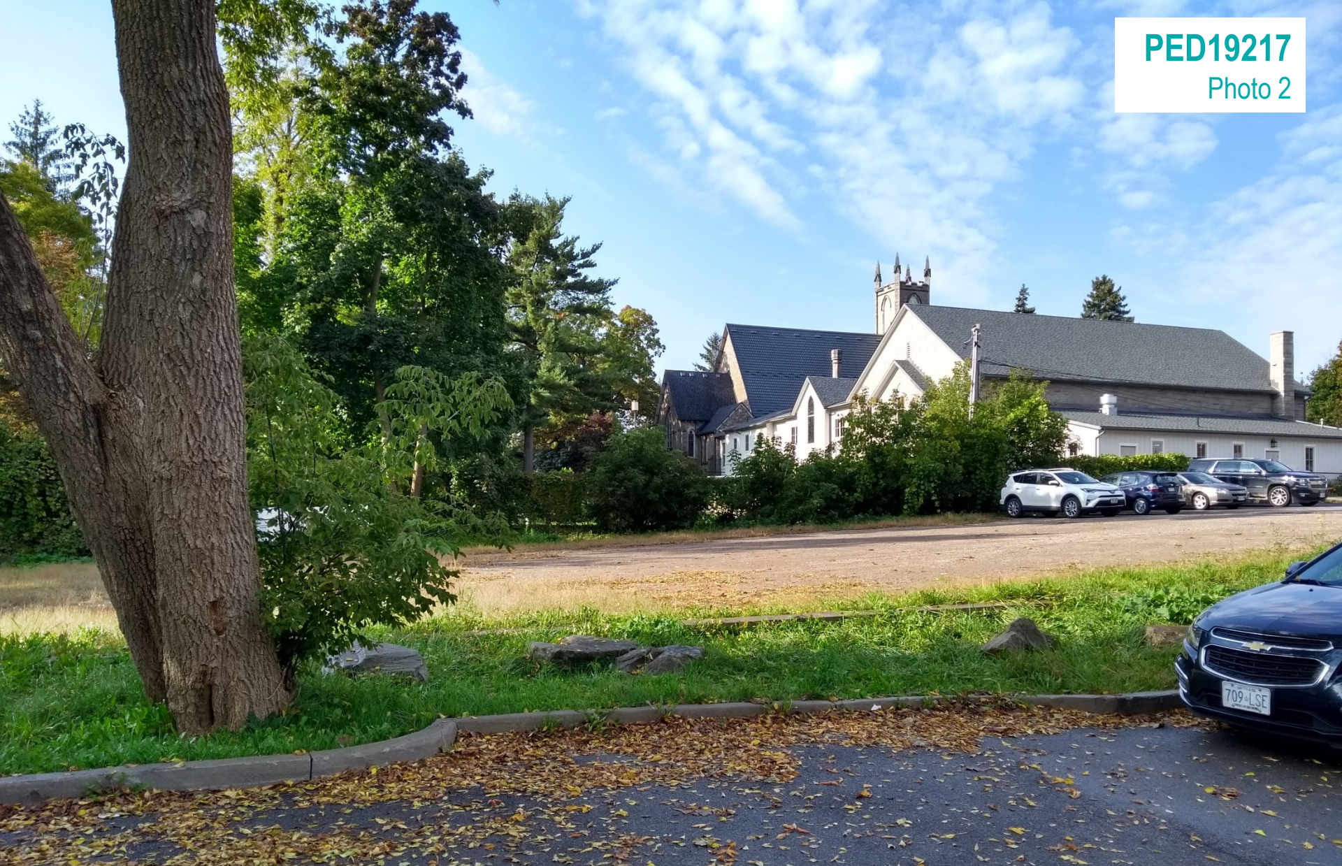
Rear of the Subject Lands looking towards St Johns Cemetery