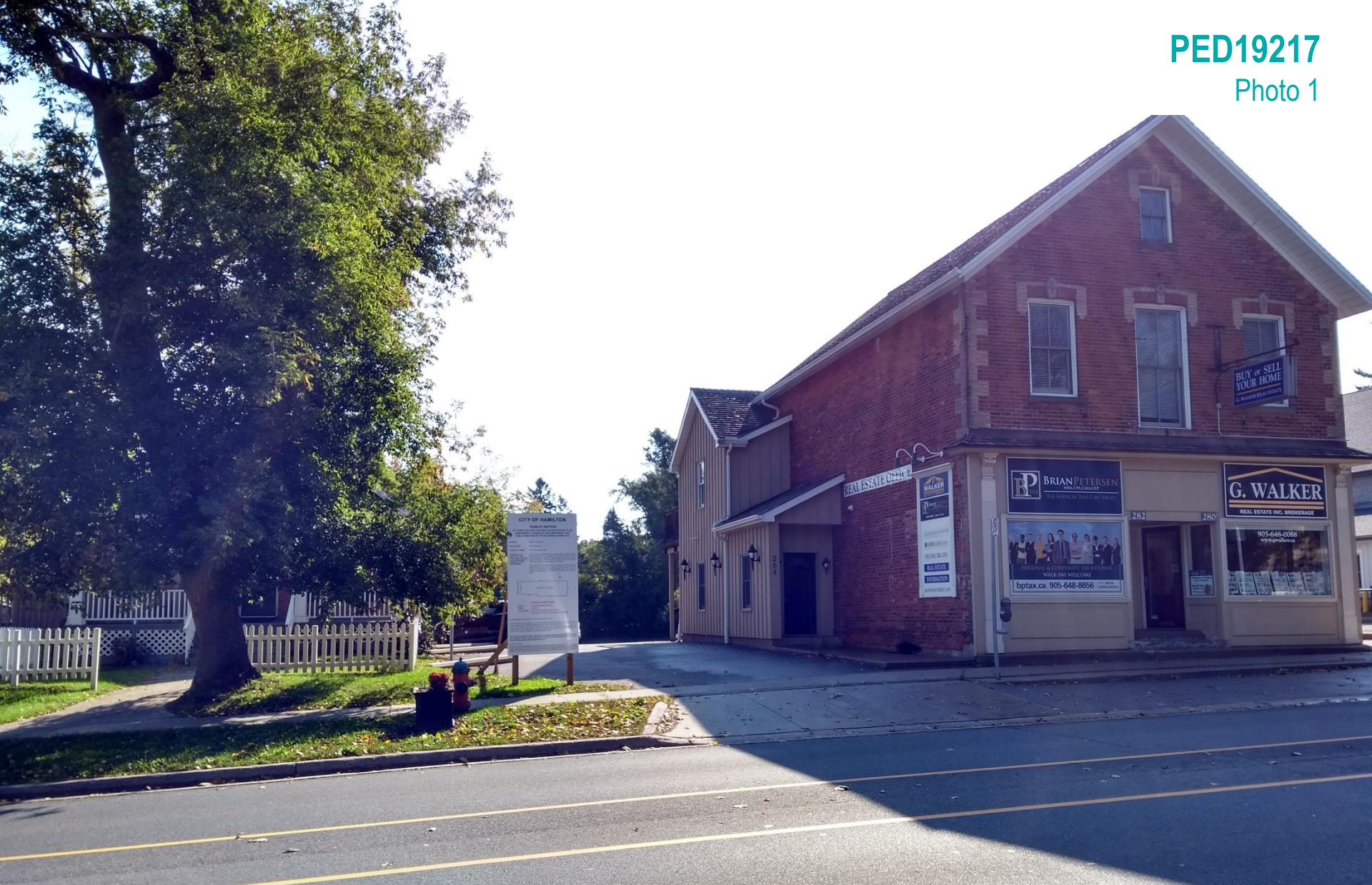
Subject Lands from Wilson Street East