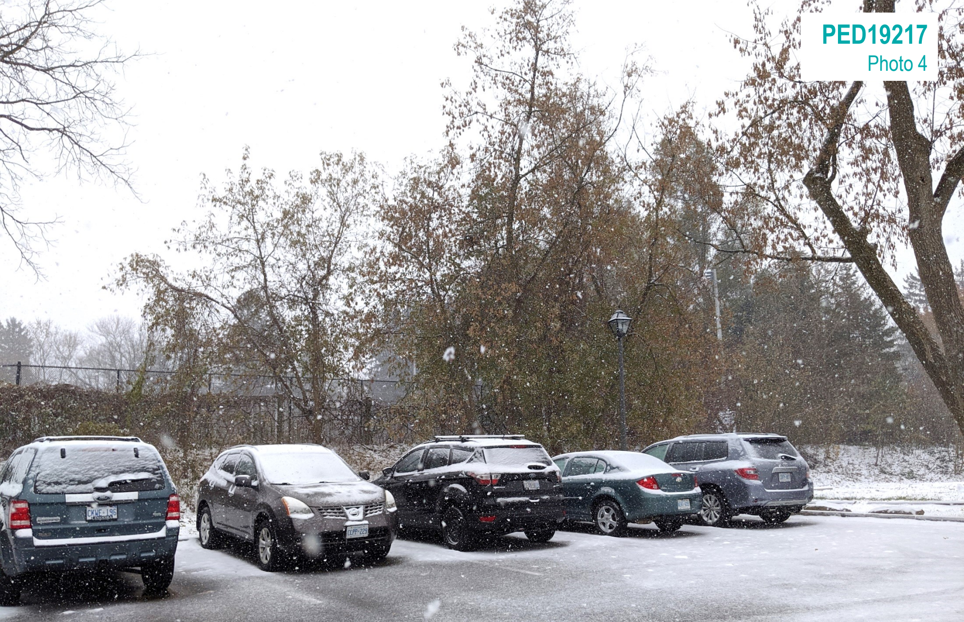
Rear of the Subject Lands looking towards the Village Green Park, including steep slope upward