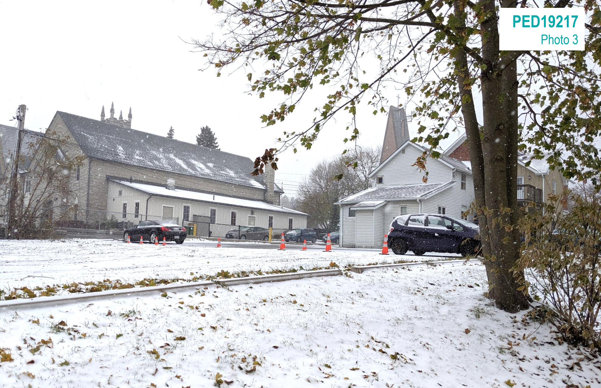
280 Wilson Street East from the rear, showing rear of existing building