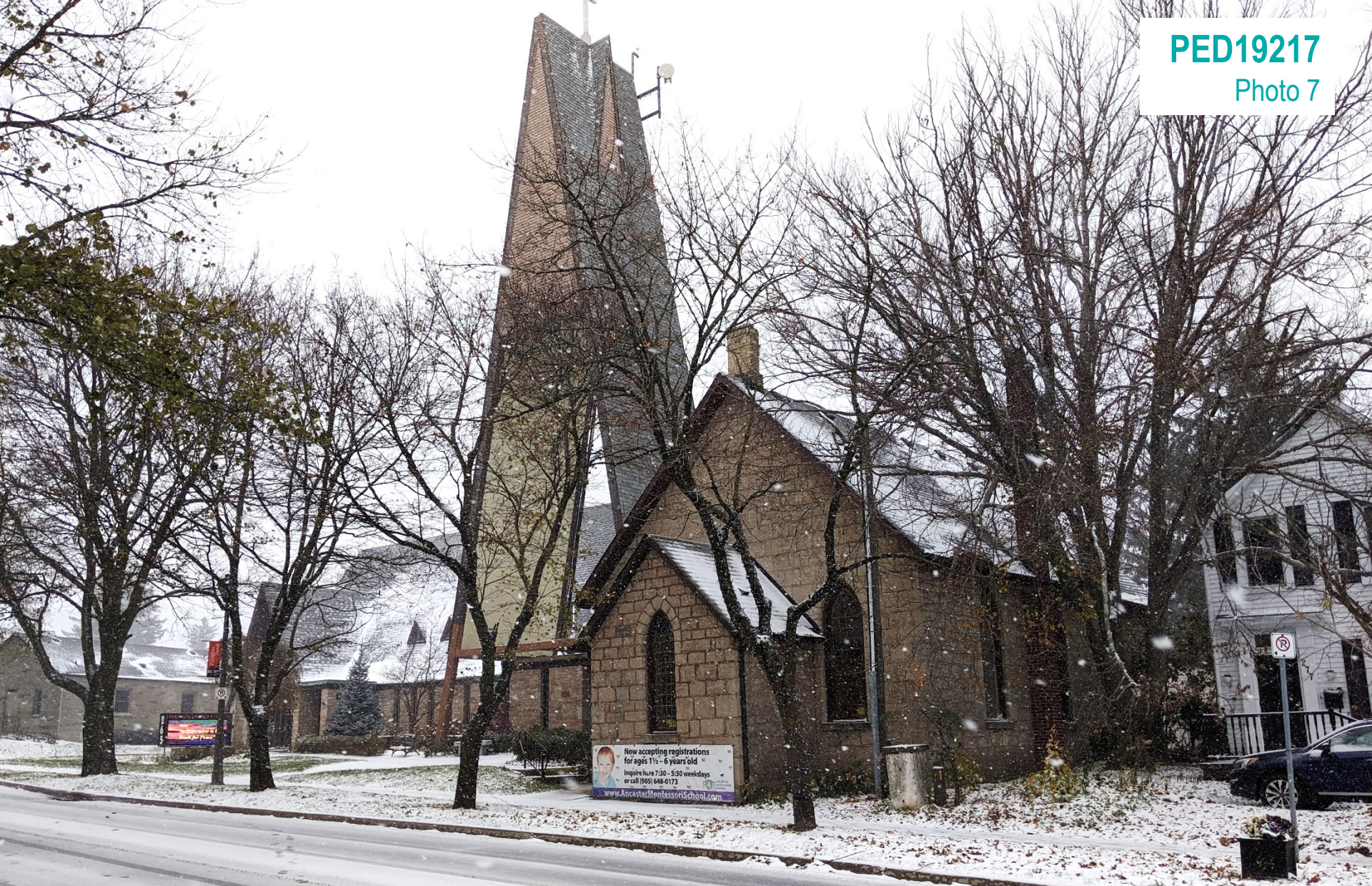
Ryerson United Church to the west of the site