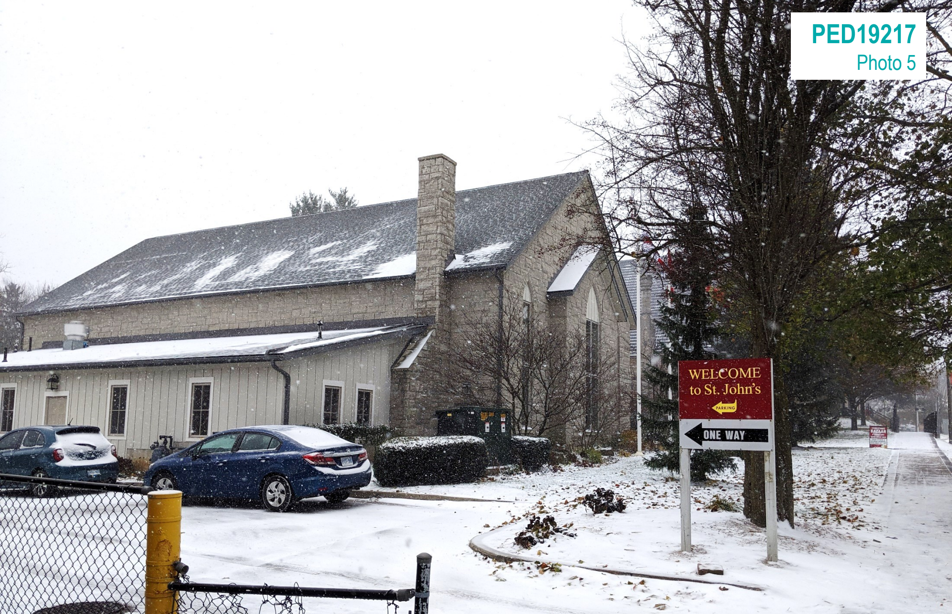
St. John's Anglican Church to the south