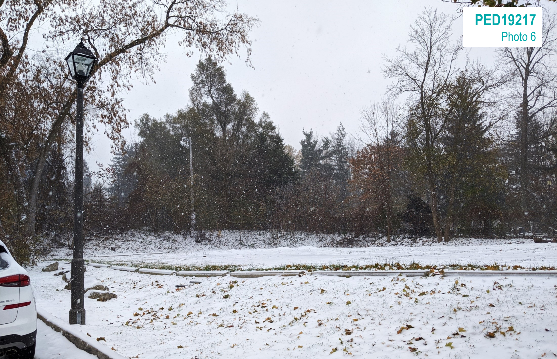
Location of proposed multiple dwelling from Ancaster Town Hall parking lot