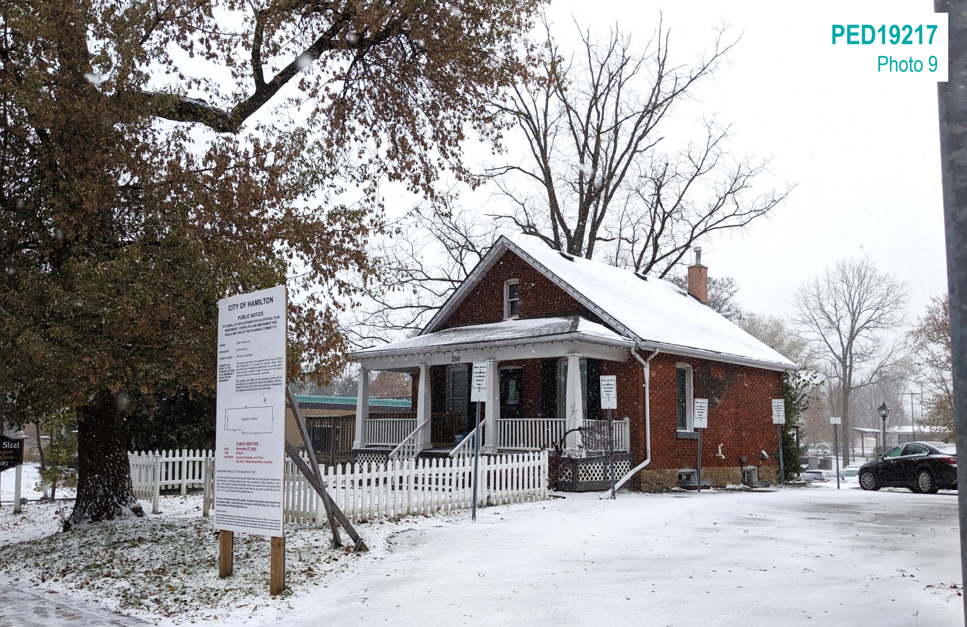
Existing commercial use to the north of the Subject Lands