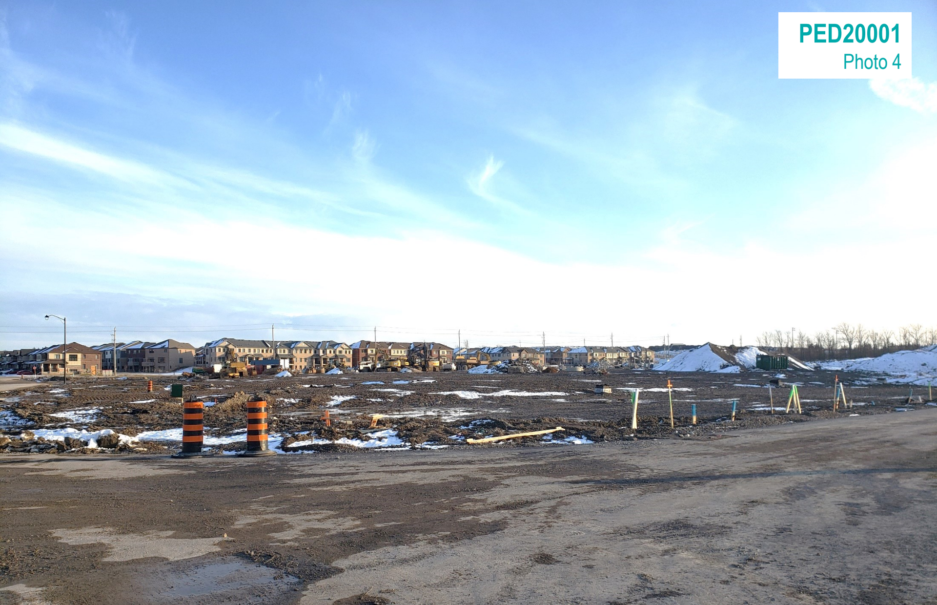
Future Neighbourhood Park to the east