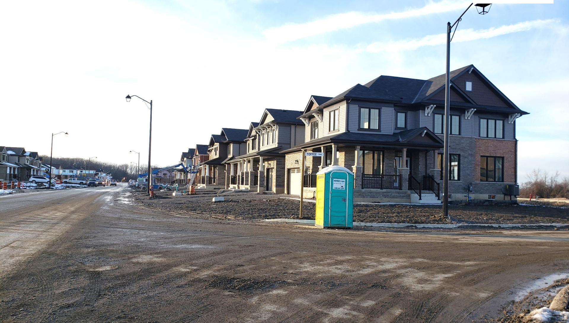
Existing Townhouses to the north