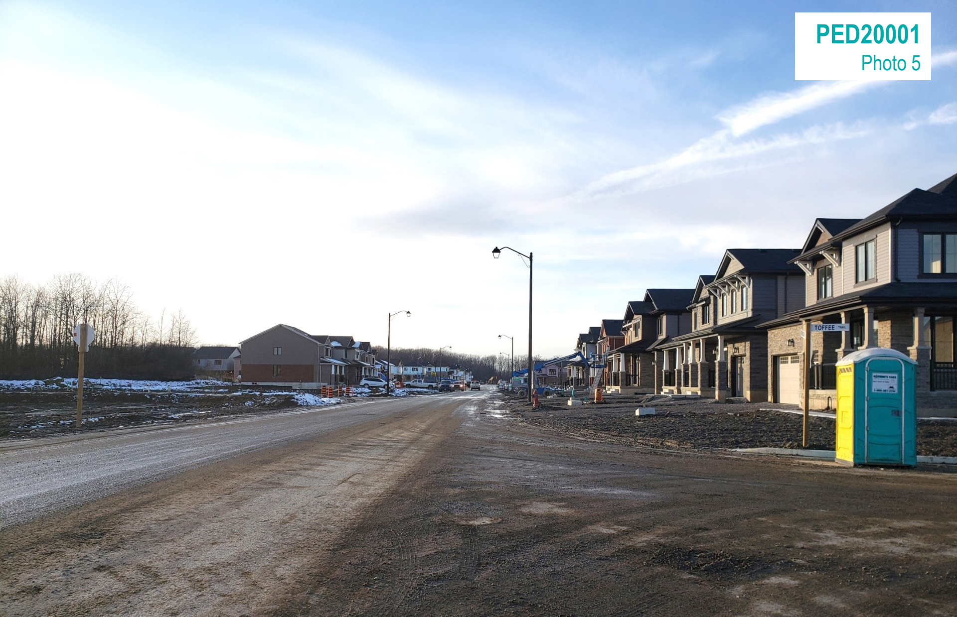
Existing Townhouses and woodlot to the west