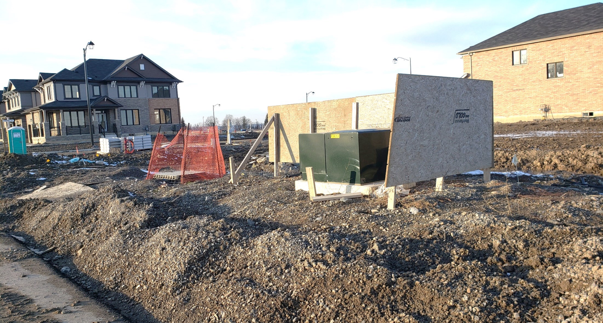
Existing Townhouses and future Townhouse locations to the north