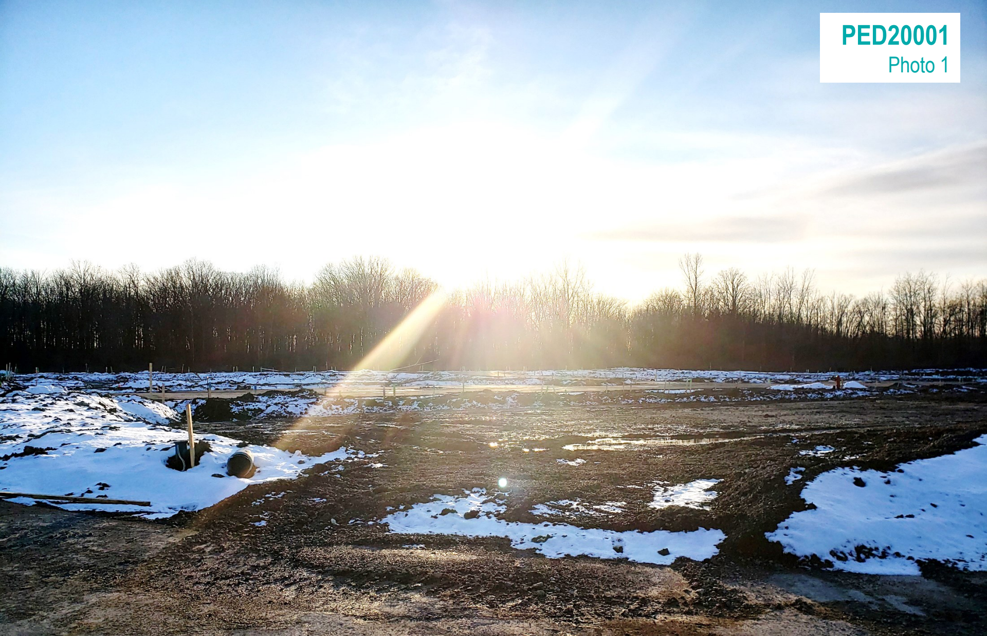
Subject Lands, wood lot to the south