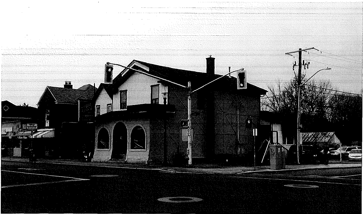
Image 2: View towards northeast corner of King Street East and Mountain Avenue North showing the south façade of 23 & 25 King Street East and the east façade of 25 King Street East, Stoney Creek (MB, 2020).