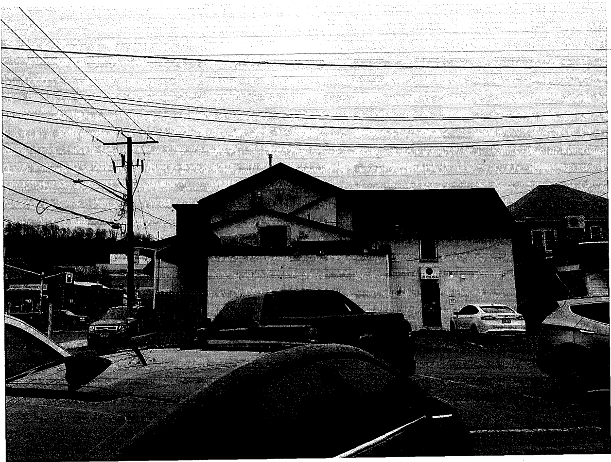
Image 3: View of back (north) façade, 23 King Street East is located on the right and 25 King Street East is located on the left side of the photo.