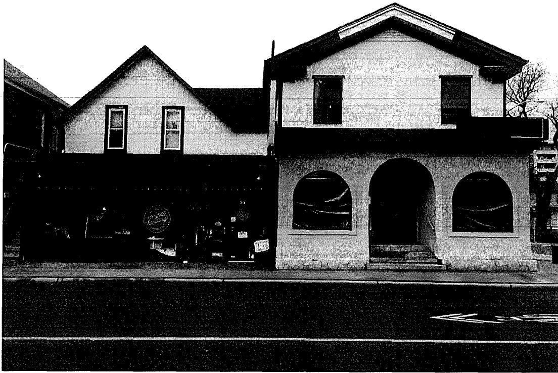
Image 1: View of the street facing (south) façade, along King Street East, Stoney Creek. 23 King Street East is located on the left (west) side and 25 King Street East is located on the right side of the photo (MB 2020).