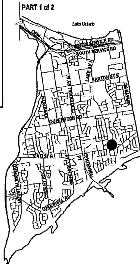
Key Map - Ward 5