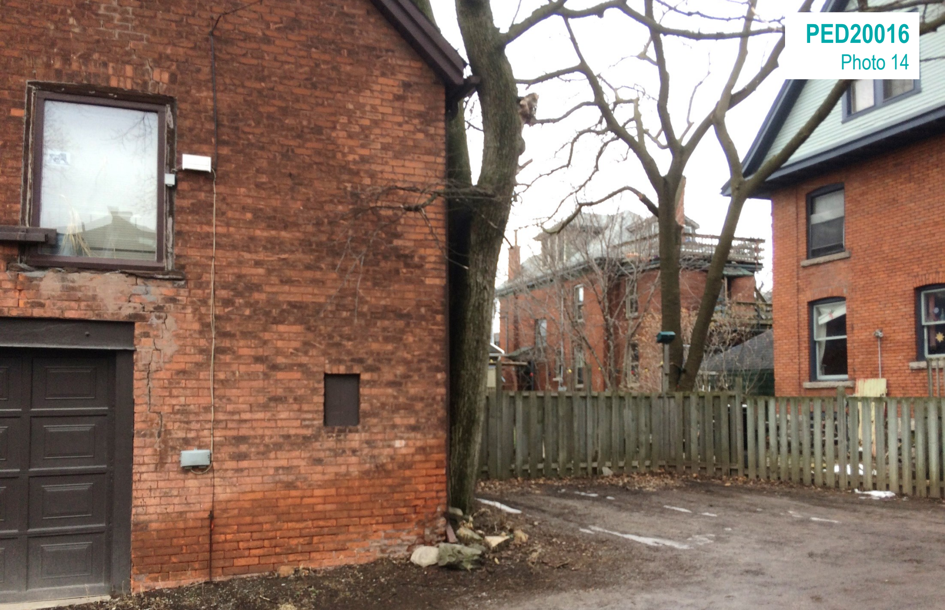
Parking area and existing accessory building locate to the north of the subject property, as seen from the alleyway looking north