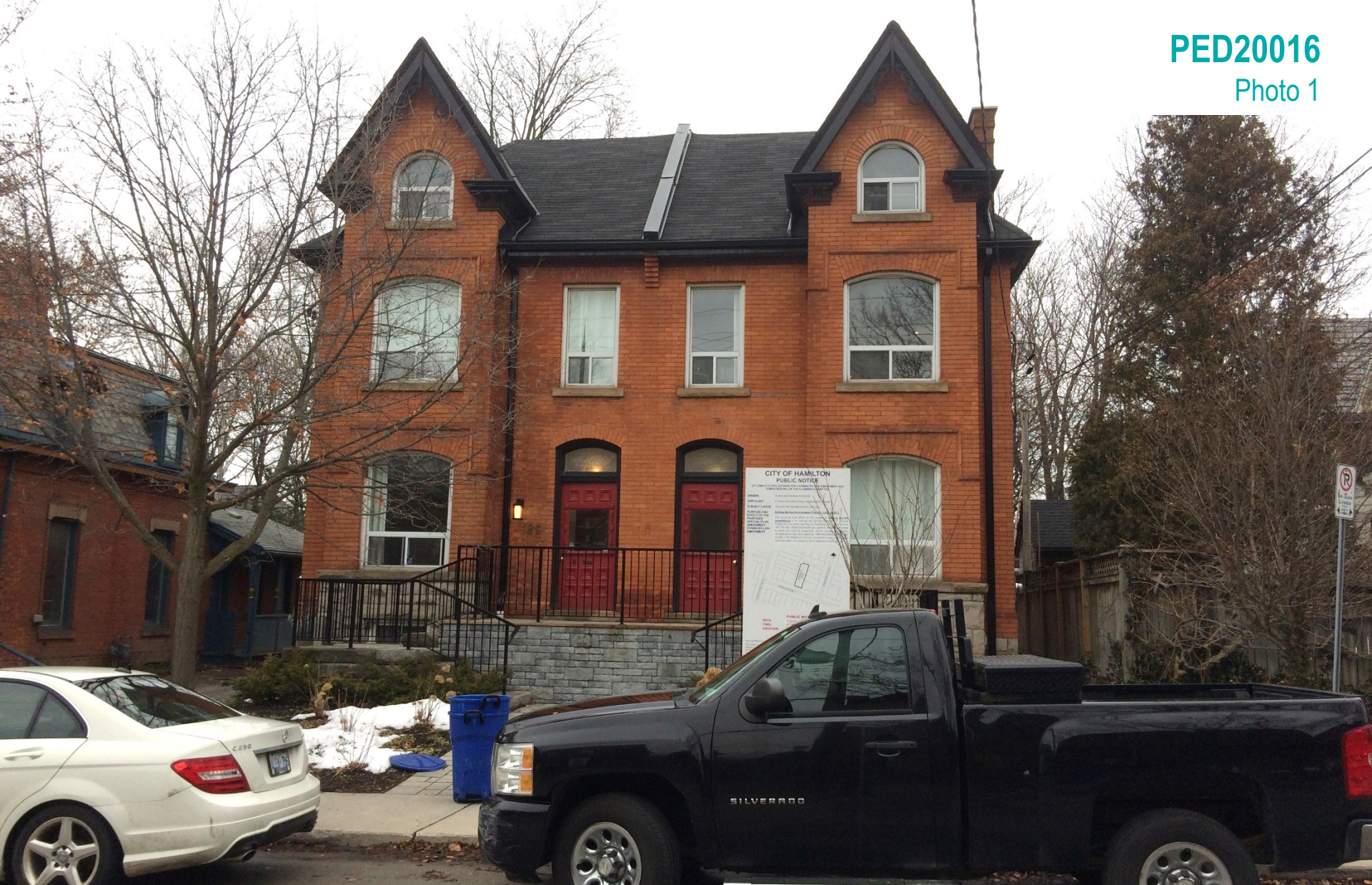
Subject property, as seen from Markland Street looking north