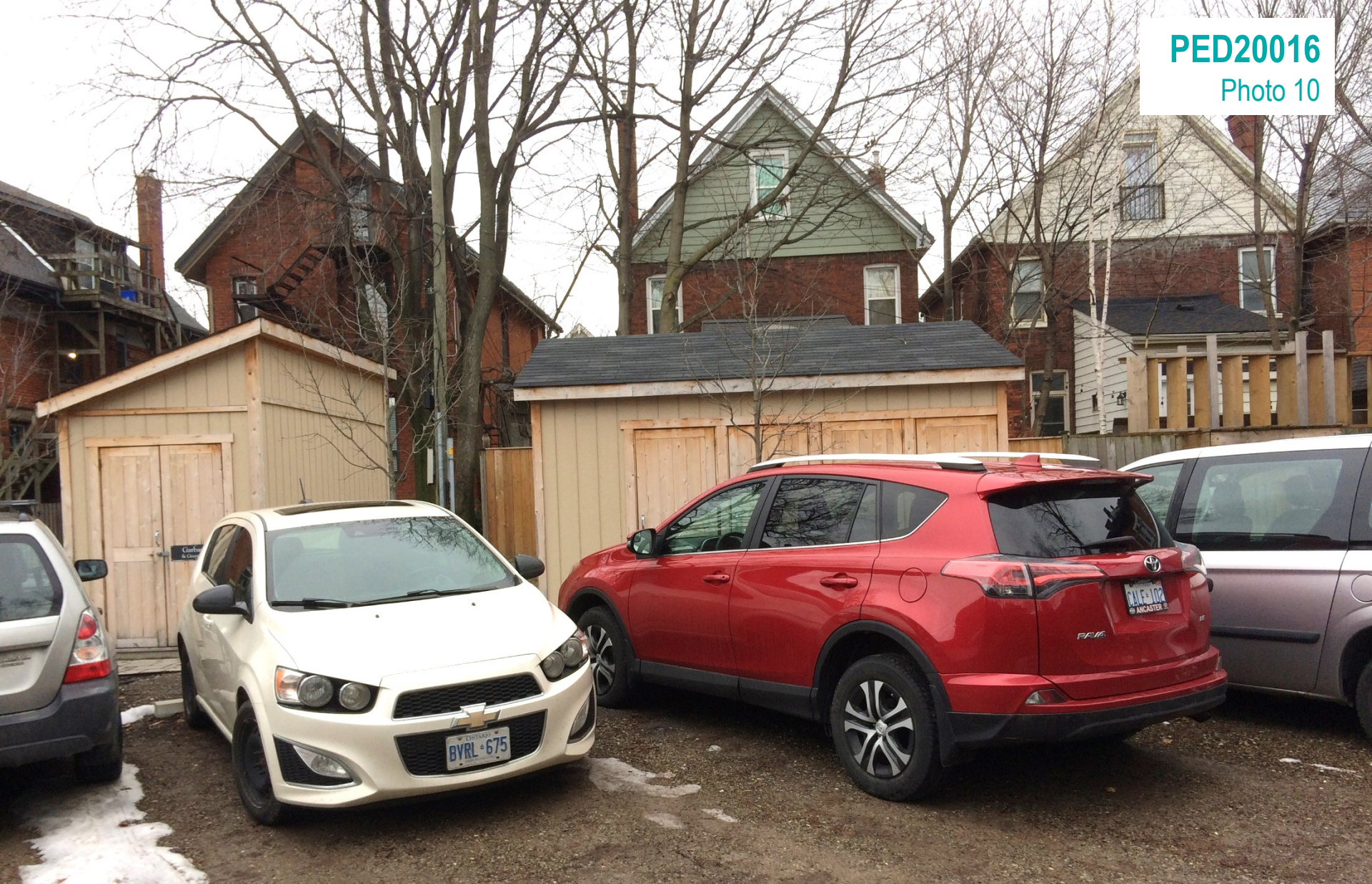
Parking spaces and accessory building located at the rear of the subject property, as seen from the alleyway looking east