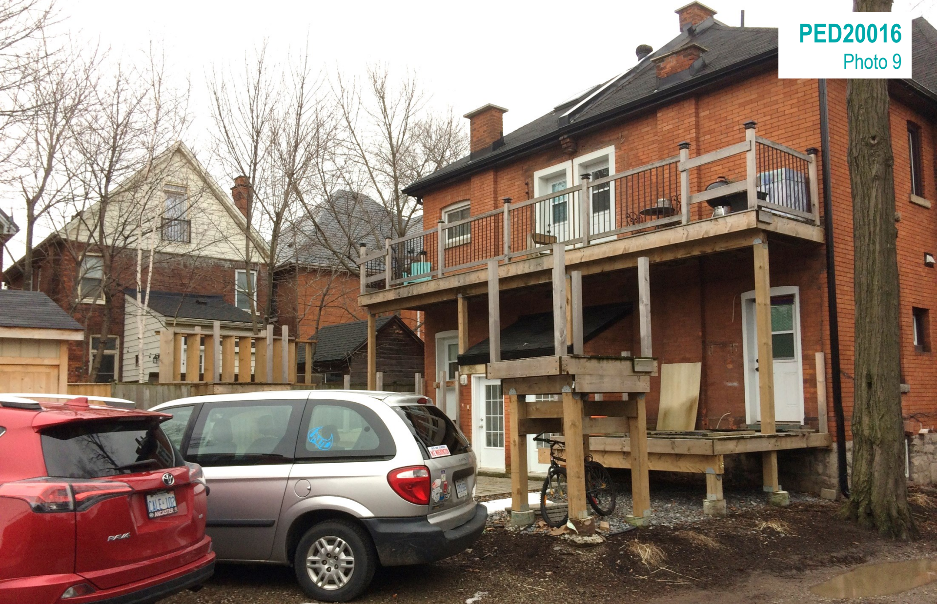
Rear of the subject property, as seen from the alleyway looking south east