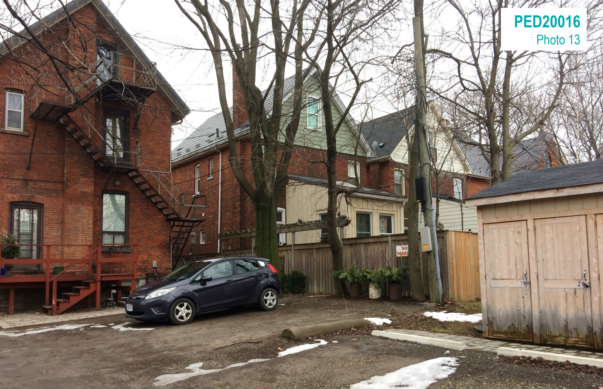
Parking area and existing dwellings located to the east of the subject property, as seen from the alleyway looking south east