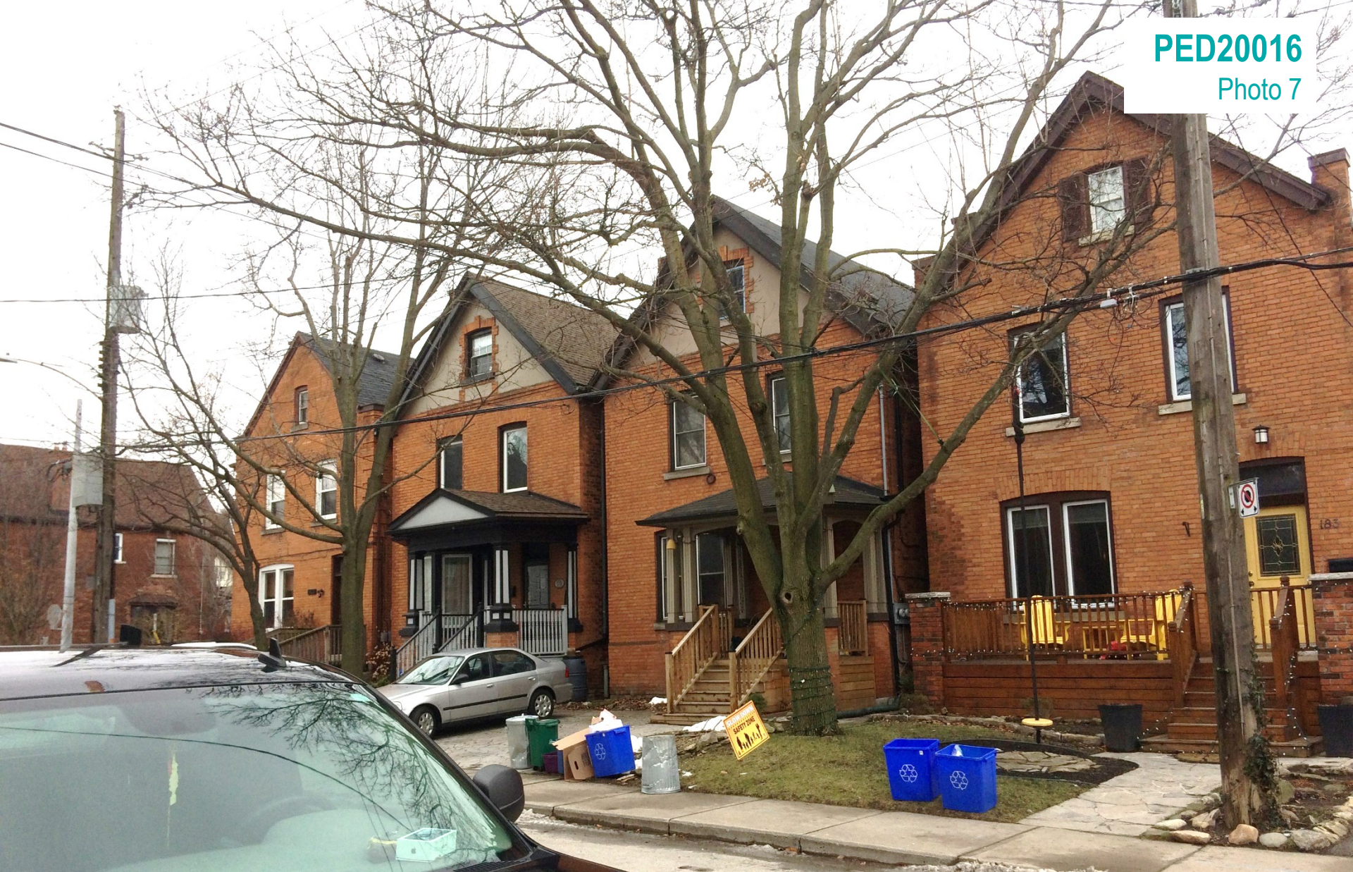
Properties 177, 179, 181 and 183 Markland Street, located to the south east of the subject property, as seen from Markland Street looking south east