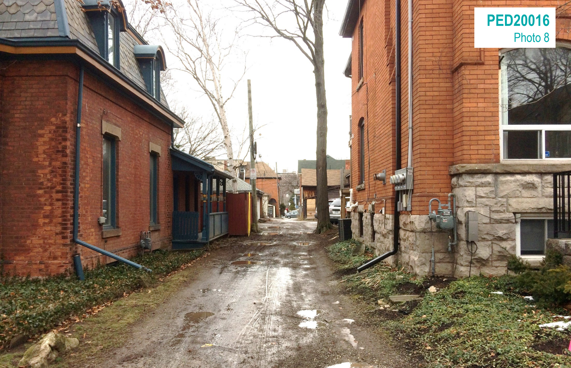
Alleyway to the west of the subject property, as seen from Markland Street looking north