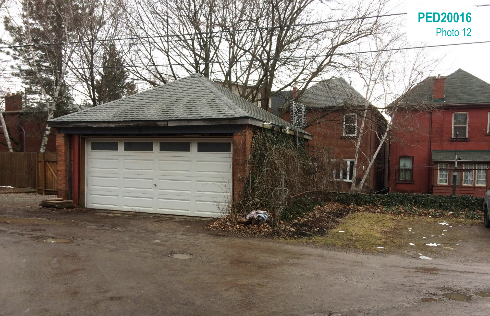
Existing accessory building and parking areas for the properties located on the west side of the alleyway, as seen from the alleyway looking south west