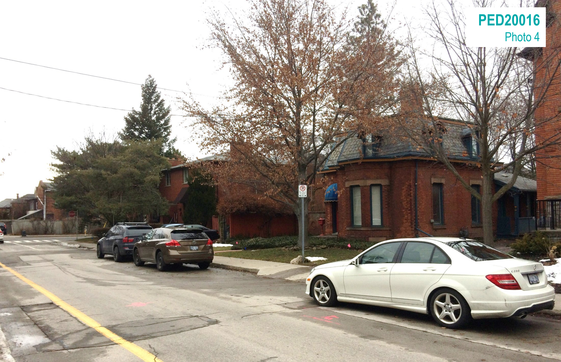
Properties at 188, 192, and 194 Markland Street, located to the west of the subject property, as seen from Markland Street looking north west