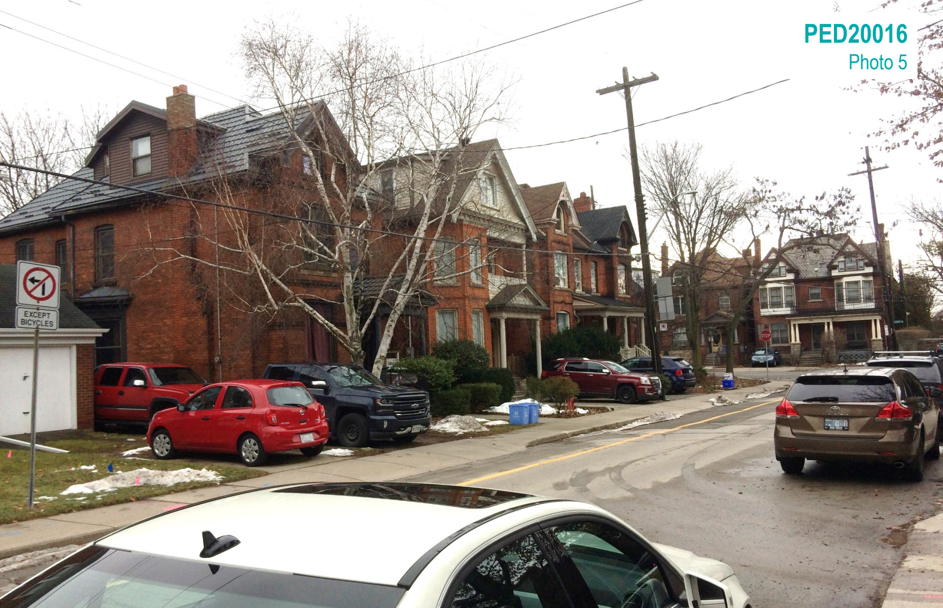
Properties at 189, 191, 193, and 195 Markland Street, located to the south west of the subject property, as seen from Markland Street looking south west