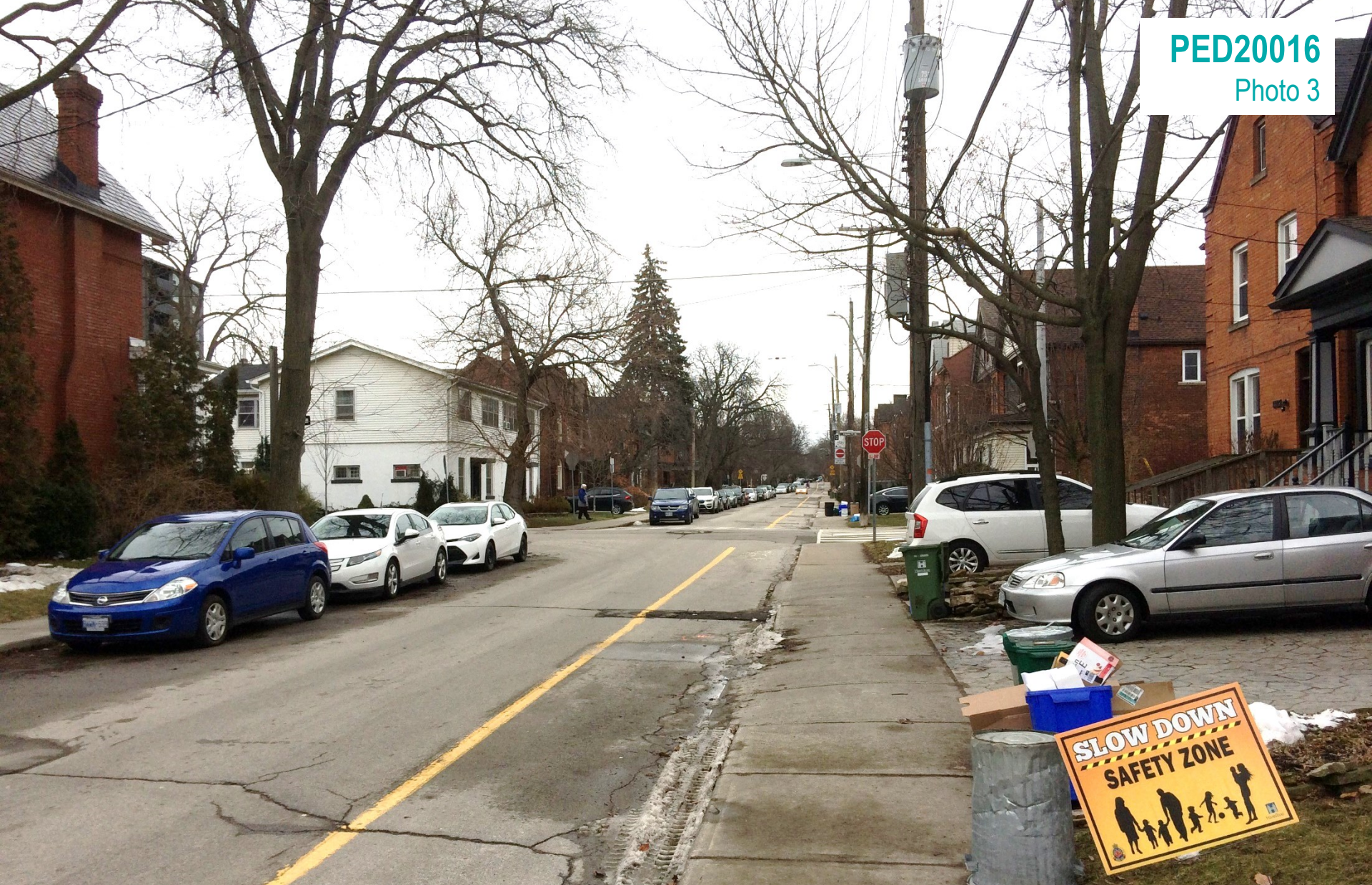
Markland Street, as seen from Markland Street looking east