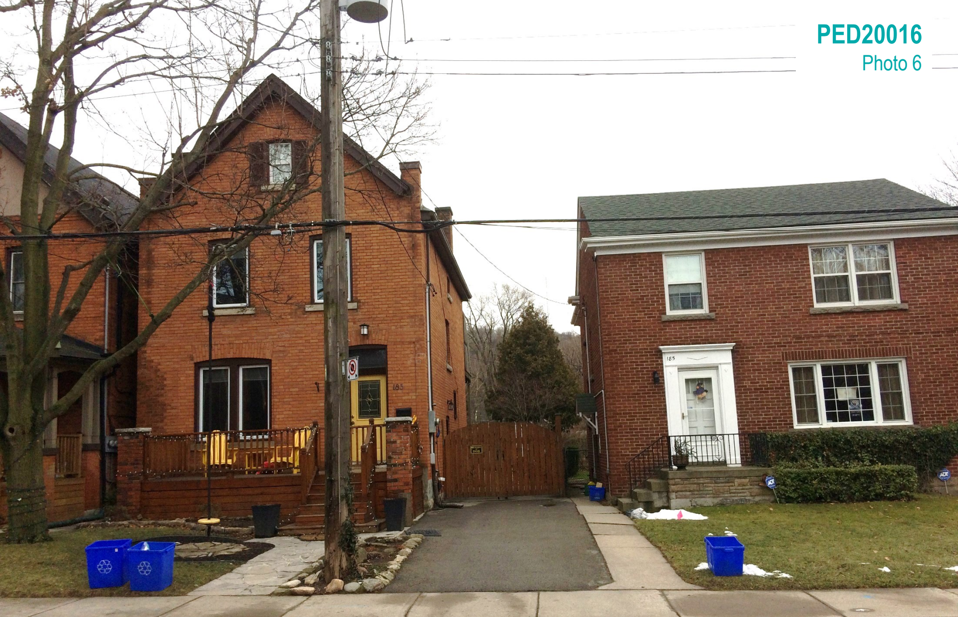
Properties at 183 and 185 Markland Street, located to the south of the subject property, as seen from Markland Street looking south