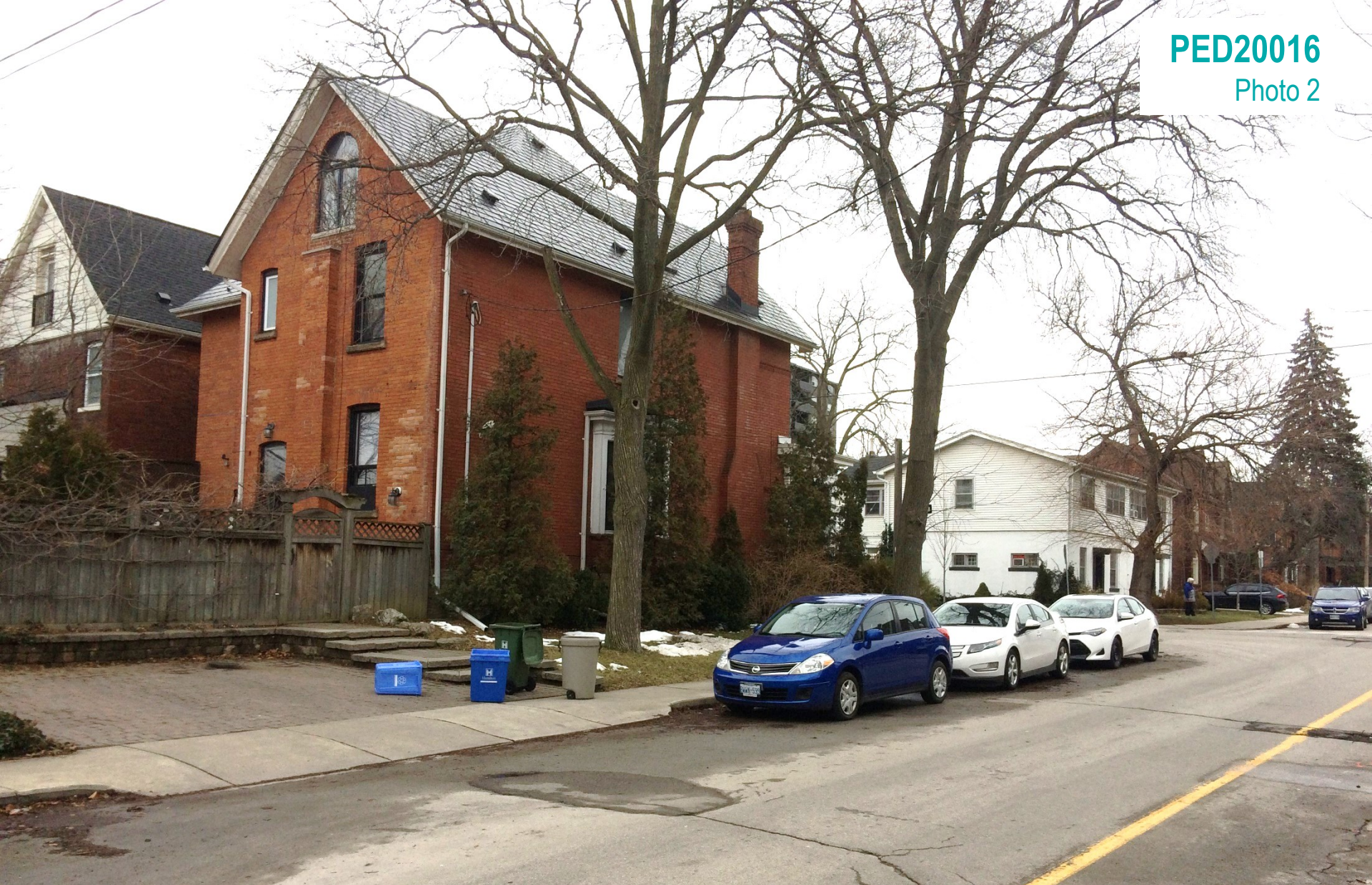
Property at 290 Hess Street South, located to the east of the subject property, as seen from Markland Street looking north east