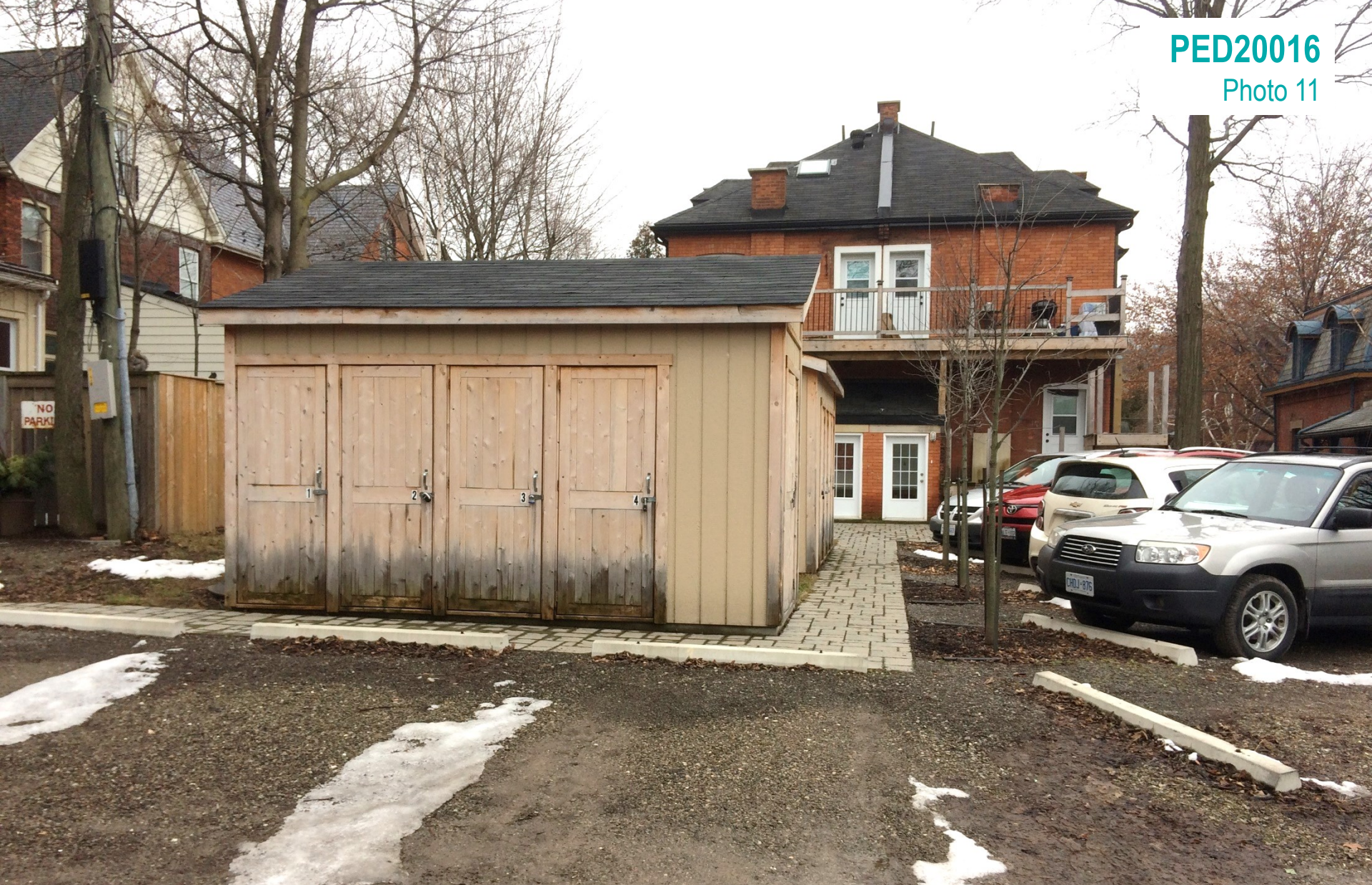
Parking spaces and accessory building located at the rear of the subject property, as seen from the alleyway looking south