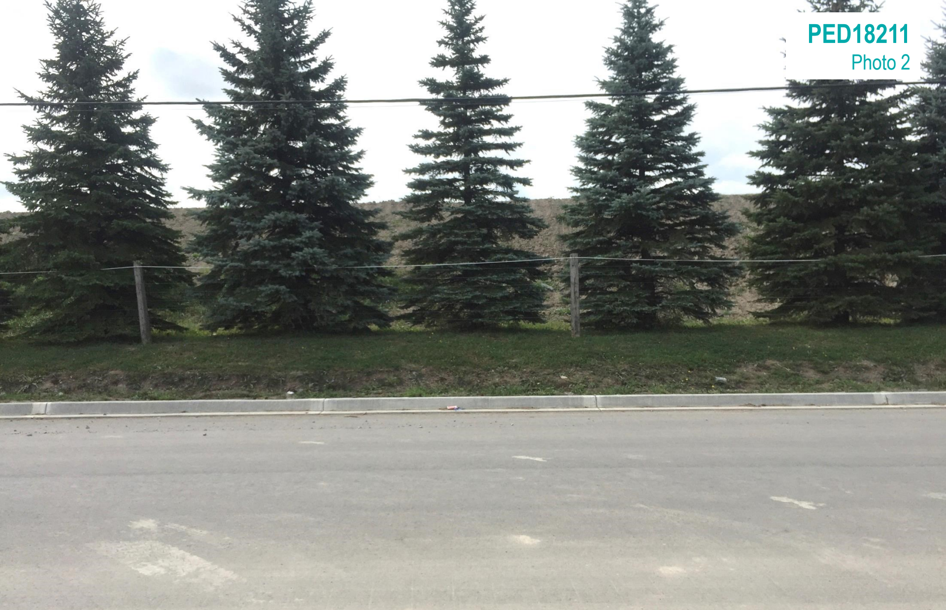
Looking south along Green Mountain Road West at Terrapure