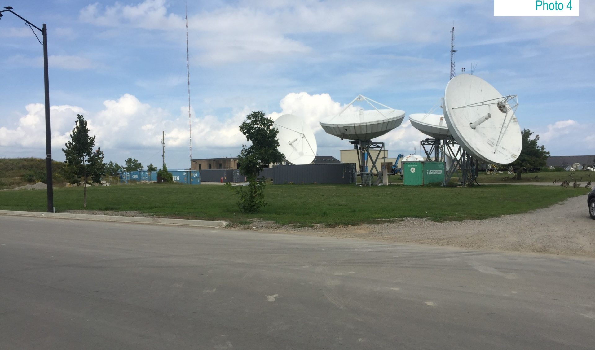
Looking north at the Subject Property