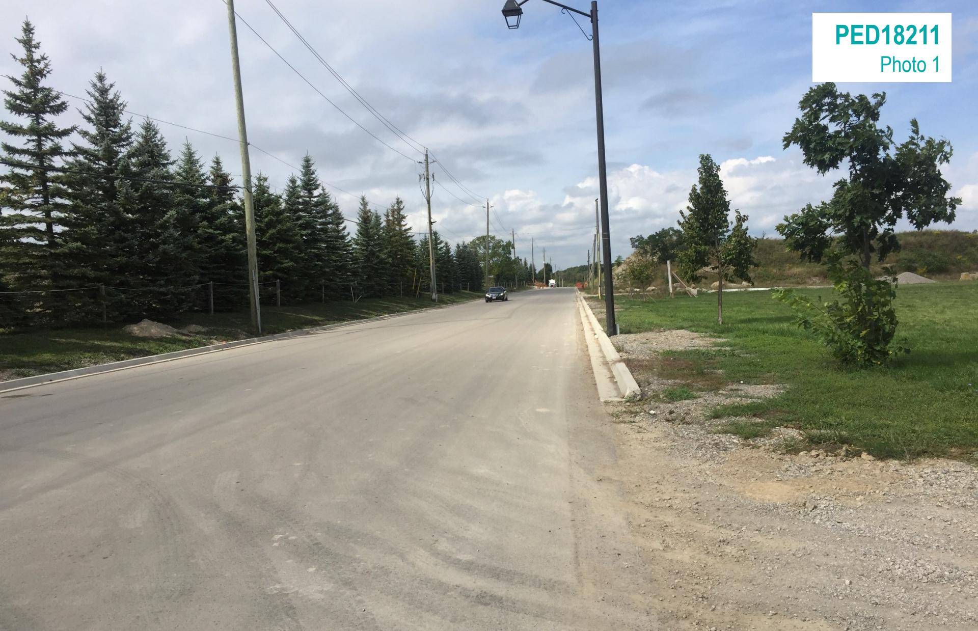
Looking west along Green Mountain Road West