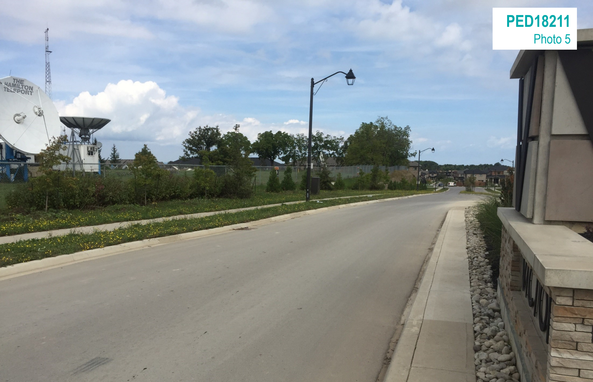
Looking north along Morrissey Boulevard