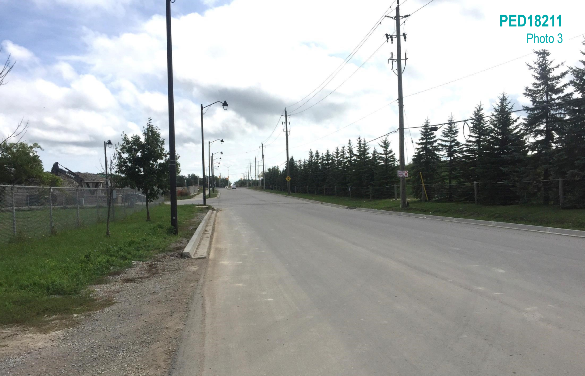
Looking east along Green Mountain Road West