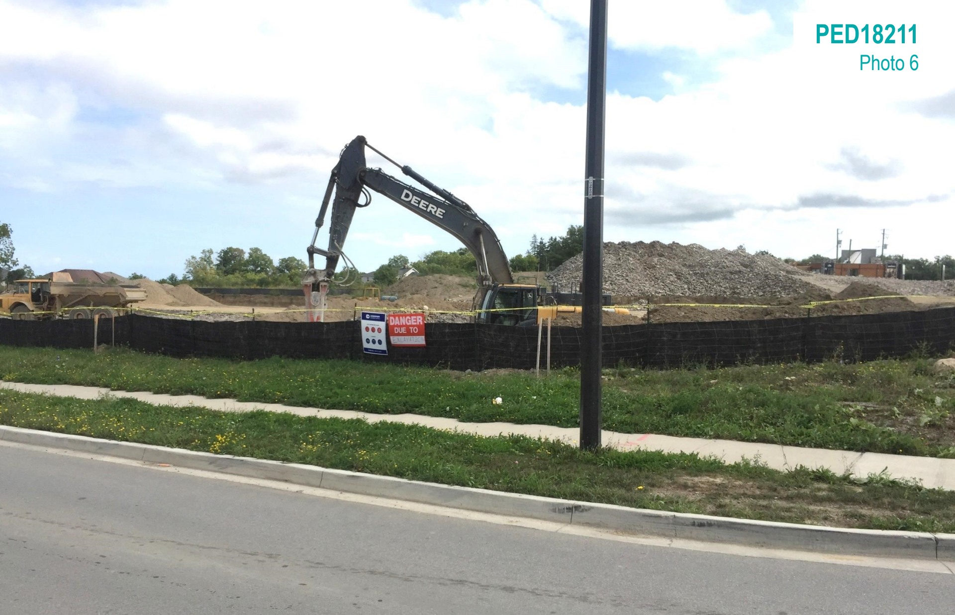
Looking east along Morrissey Boulevard