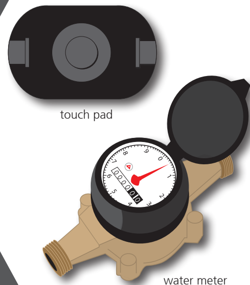
water meter PW-WW-CS-CE-V-008-048 rev4