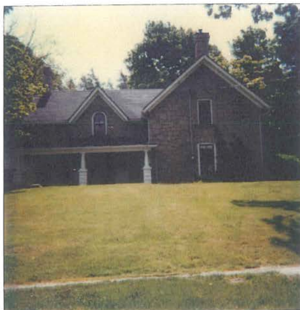
SIDE VIEW OF MILLER'S HOUSE FACING NORTH (WILSON ST.)

558 The Miller's House 580 Wilson St. E. ANCASTER, Ont.