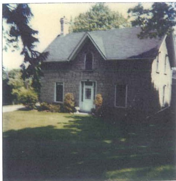
FRONT FACADE OF MILLER'S HOUSE FACING WEST